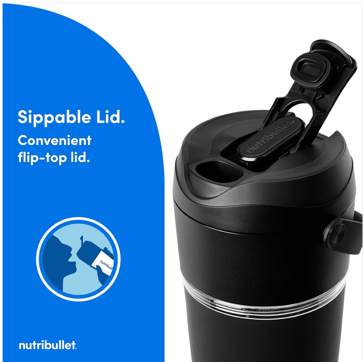
Figure 6: Sippable flip-top lid for convenient drinking.