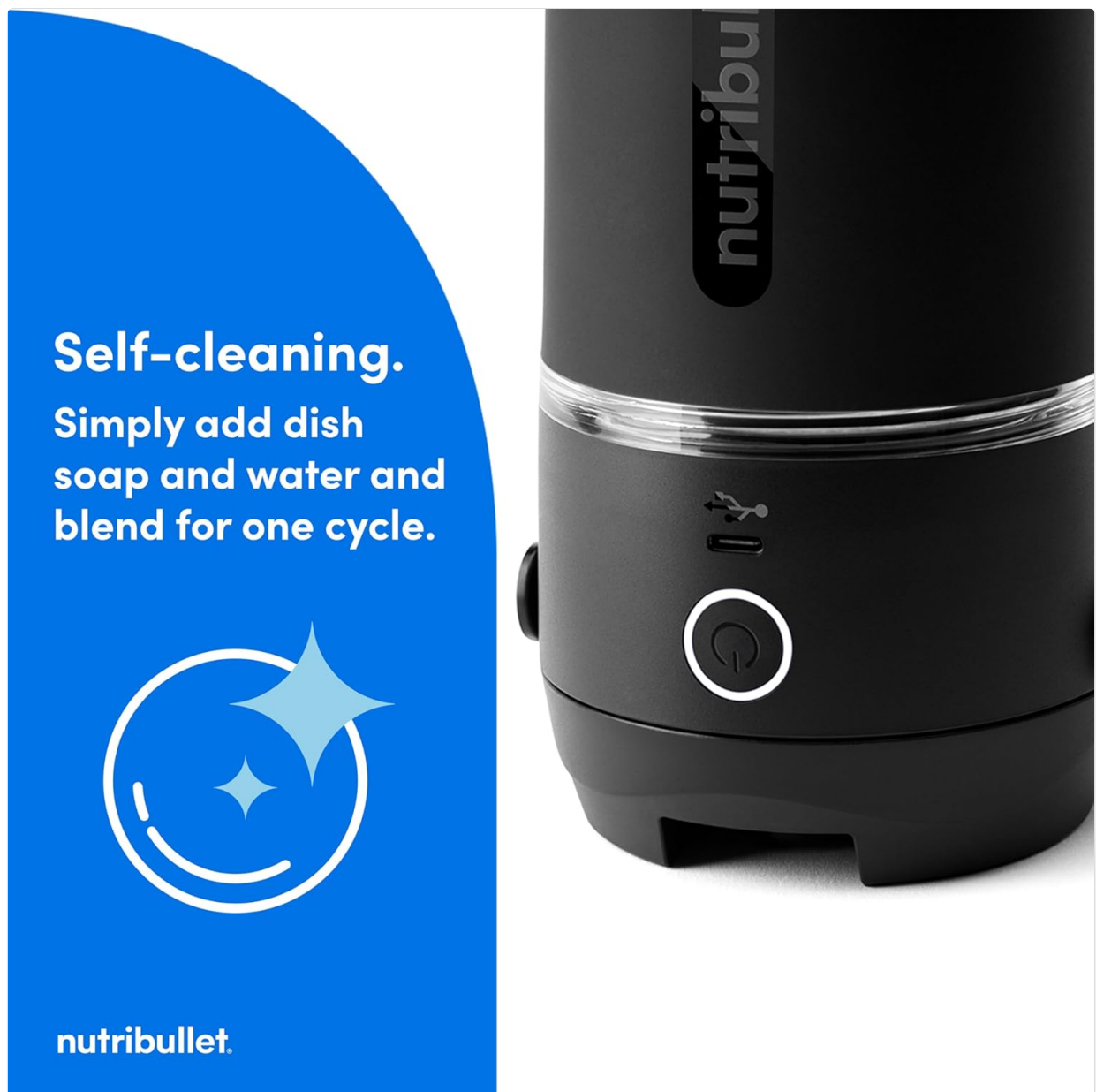
Figure 7: Self-cleaning feature for easy maintenance.