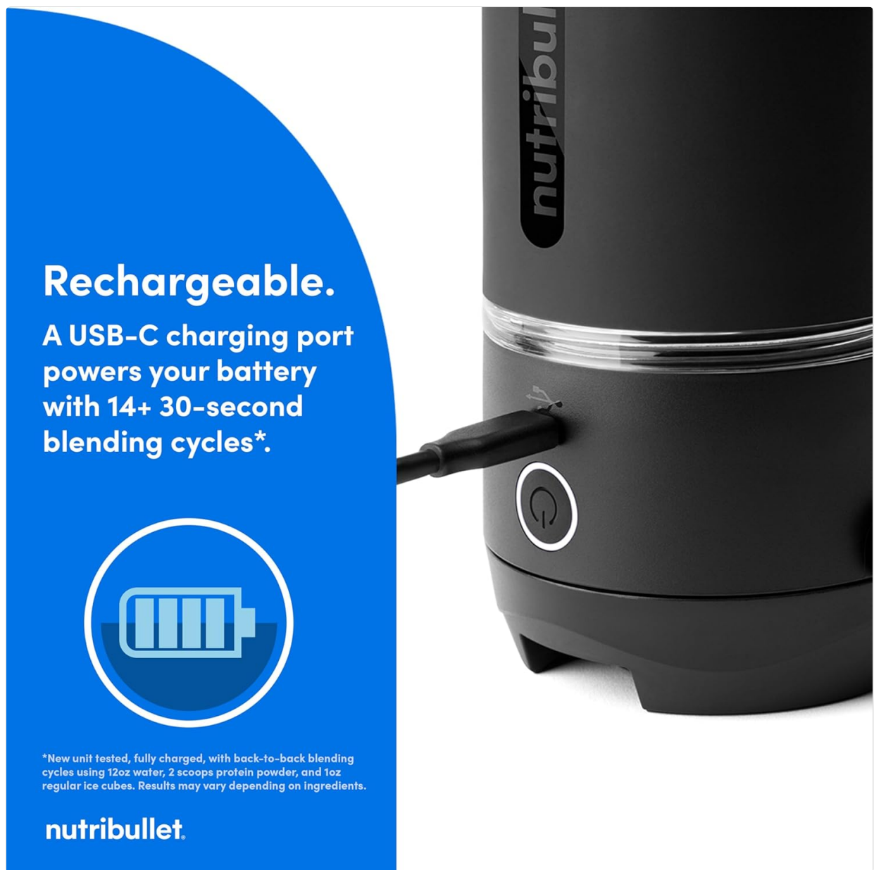
Figure 2: USB-C charging port on the motor base.