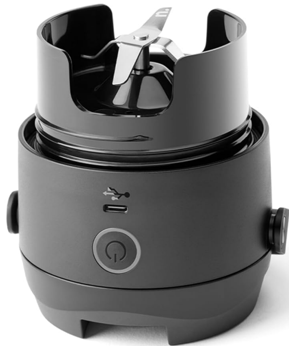
Figure 5: The powerful 11V motor is designed to blend ice.