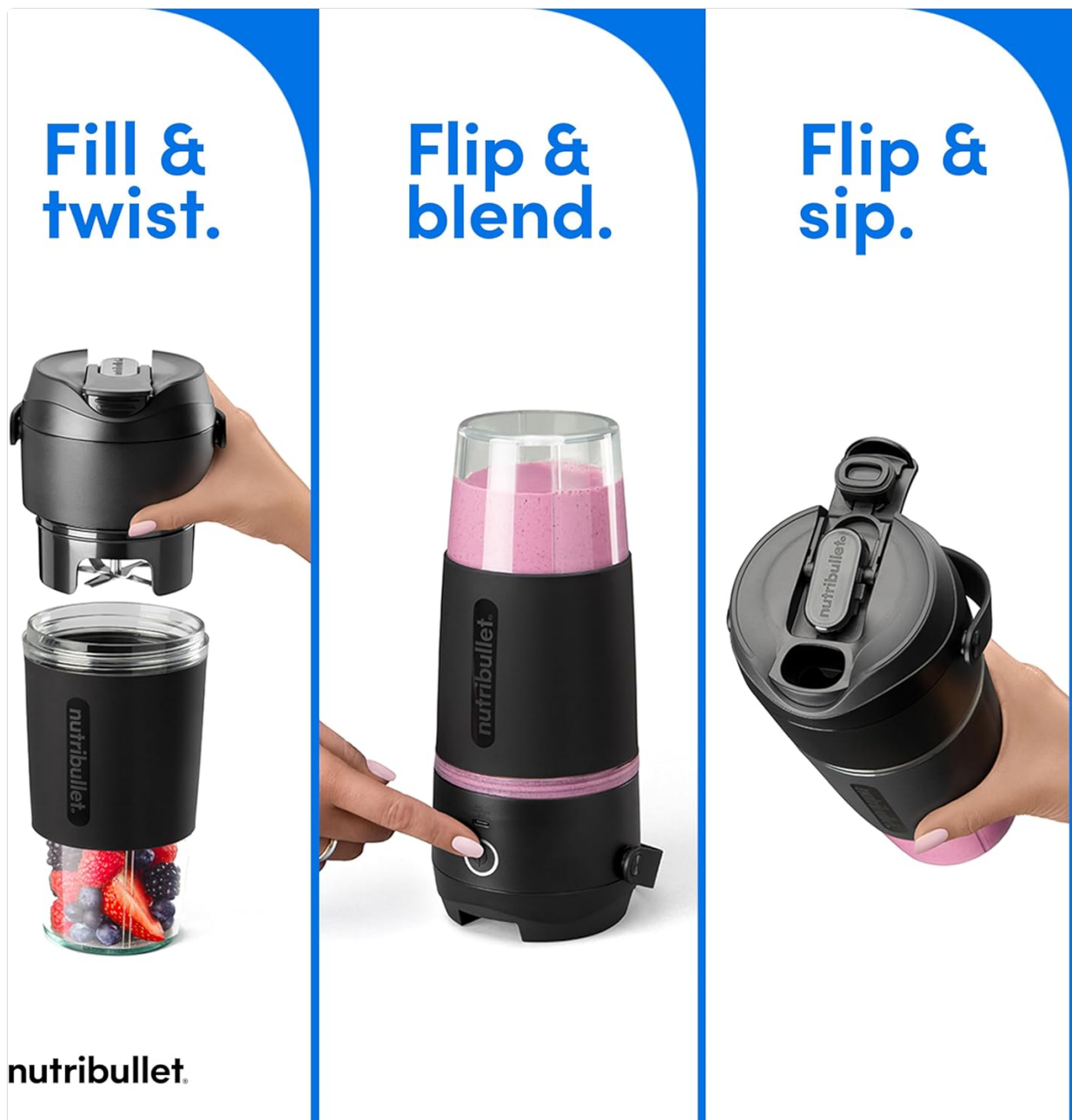
Figure 3: Assembly and usage steps: Fill & twist, Flip & blend, Flip & sip.