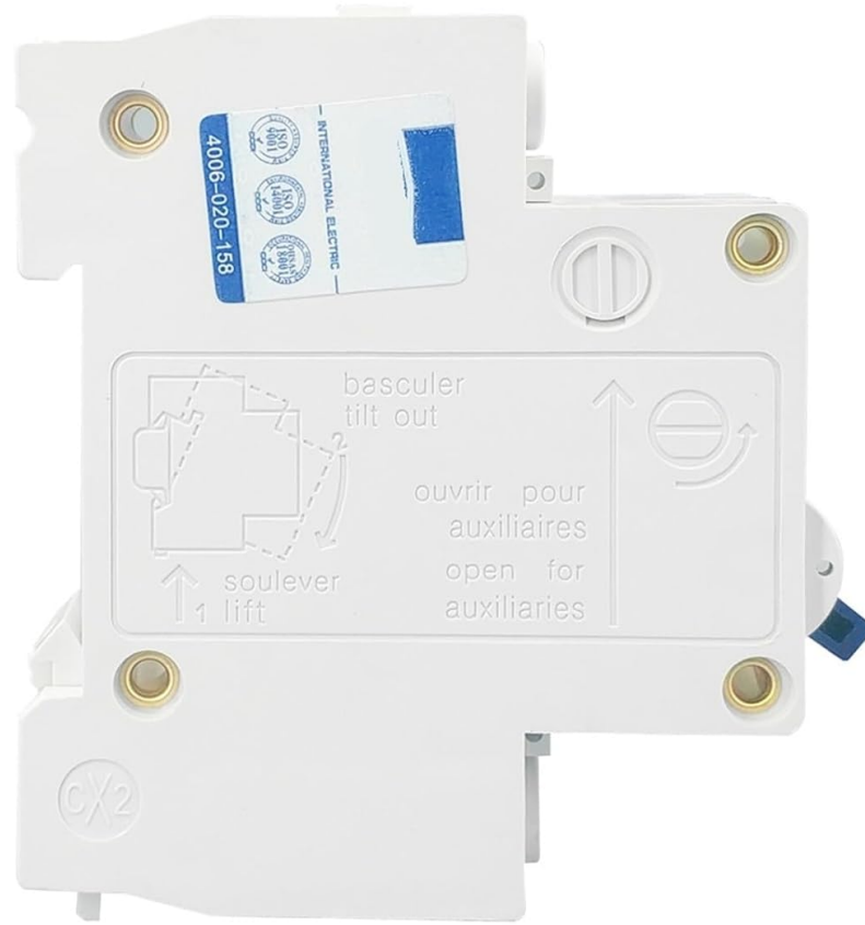
Figure 4: Rear view illustrating the 'lift' and 'tilt out' mechanism for DIN rail mounting/removal.