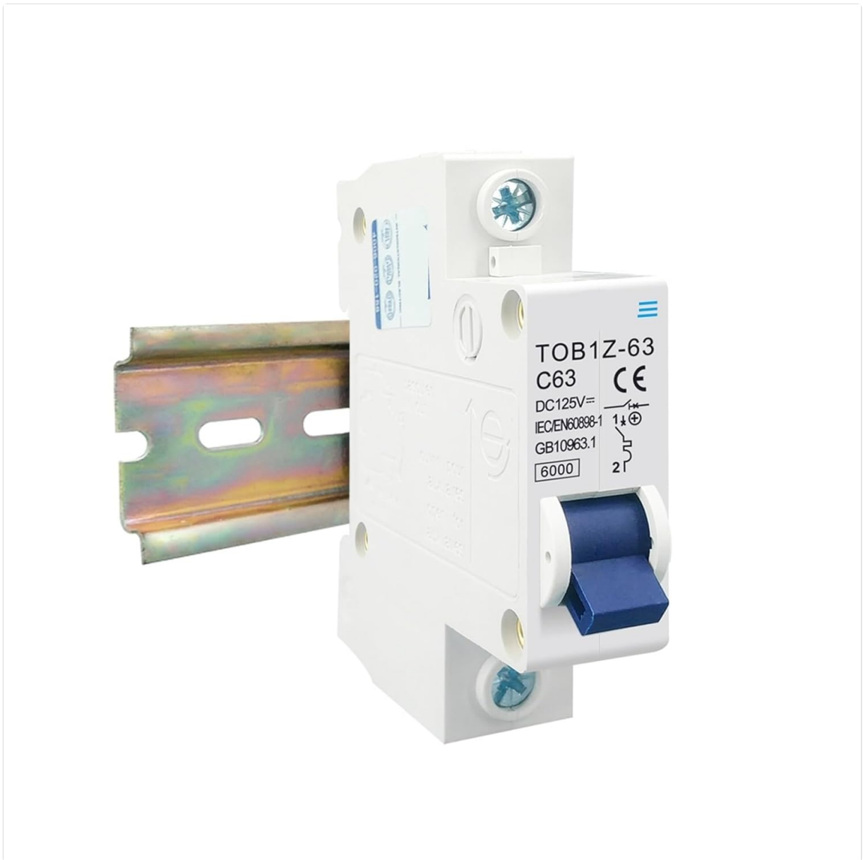
Figure 3: TOB1Z-63 mounted on a DIN rail.