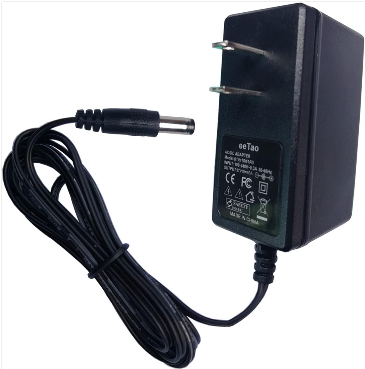
Image: A side view of the eeTao AC/DC adapter, highlighting its compact design and the barrel connector for device input. The product label with model number SAW30A-190-1500U is visible.