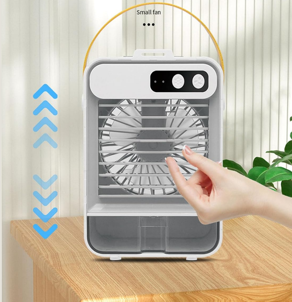
Figure 3.2: Adjusting the front grid for customized airflow.