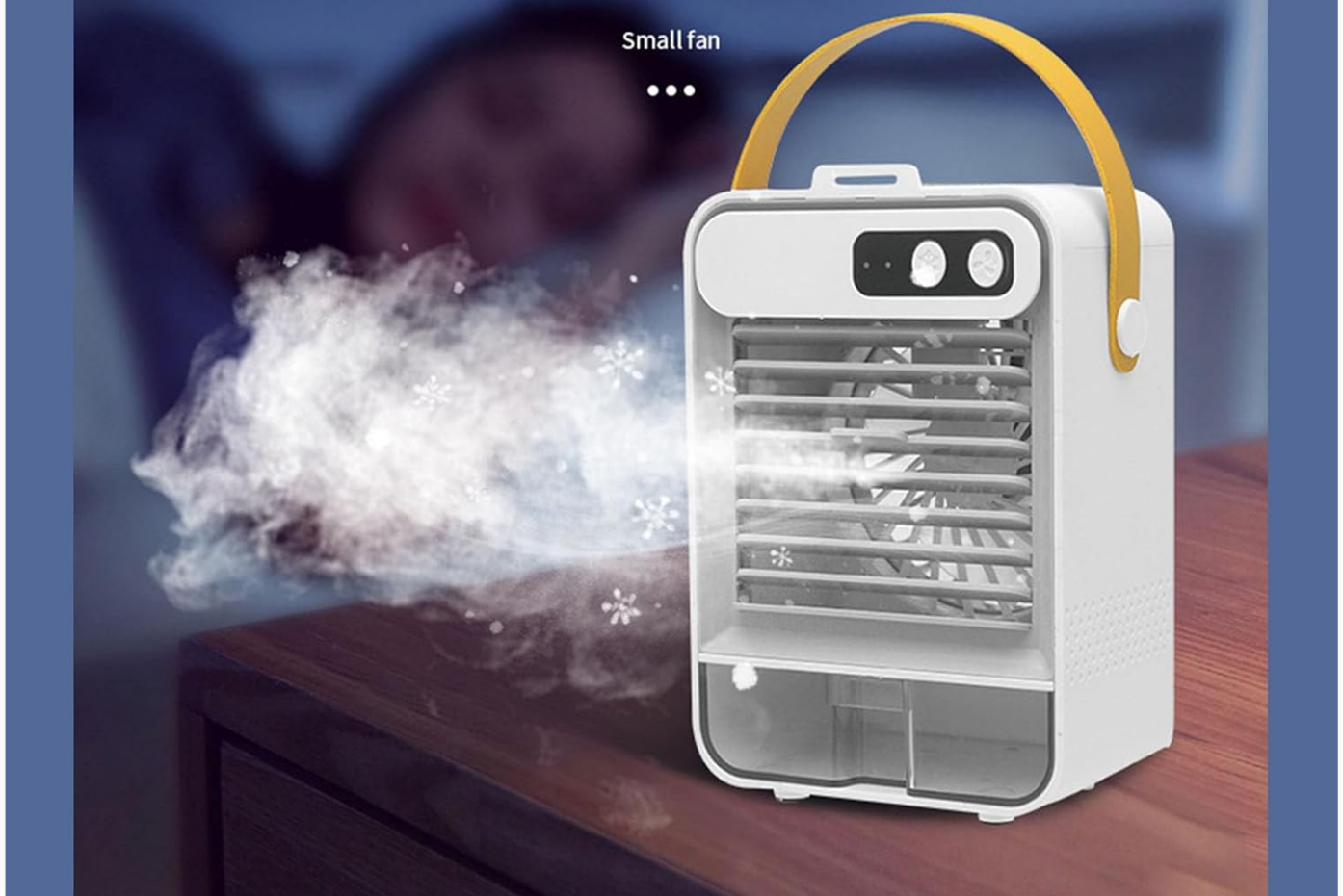
Figure 3.3: The unit's low noise level ensures a peaceful environment.

20dB(A) Minimum working sound Fresh breeze on your face, sleep through the night