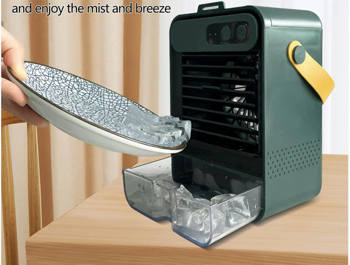
Figure 2.2: Adding ice cubes to the unit for enhanced cooling effect.

Add ice cubes to the ice box and enjoy the mist and breeze