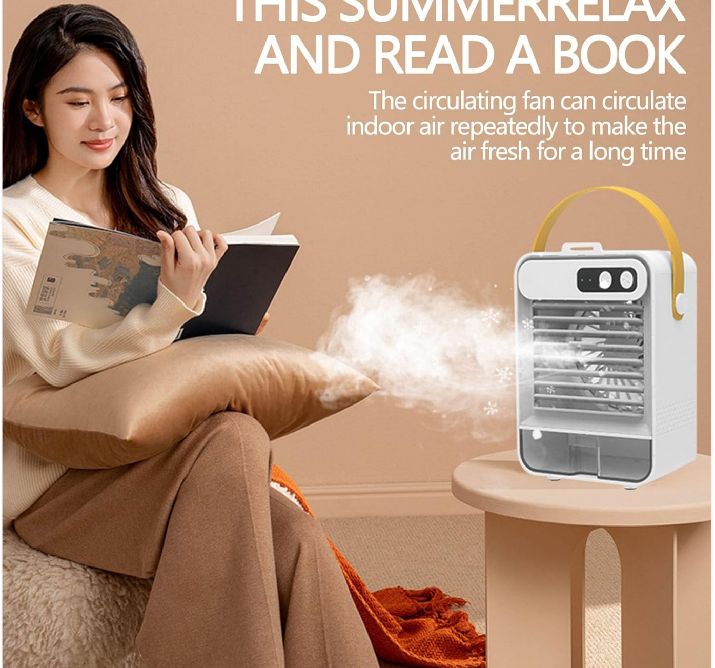
Figure 1.2: The portable air conditioner provides a comfortable environment for relaxation.

The circulating fan can circulate indoor air repeatedly to make the air fresh for a long time