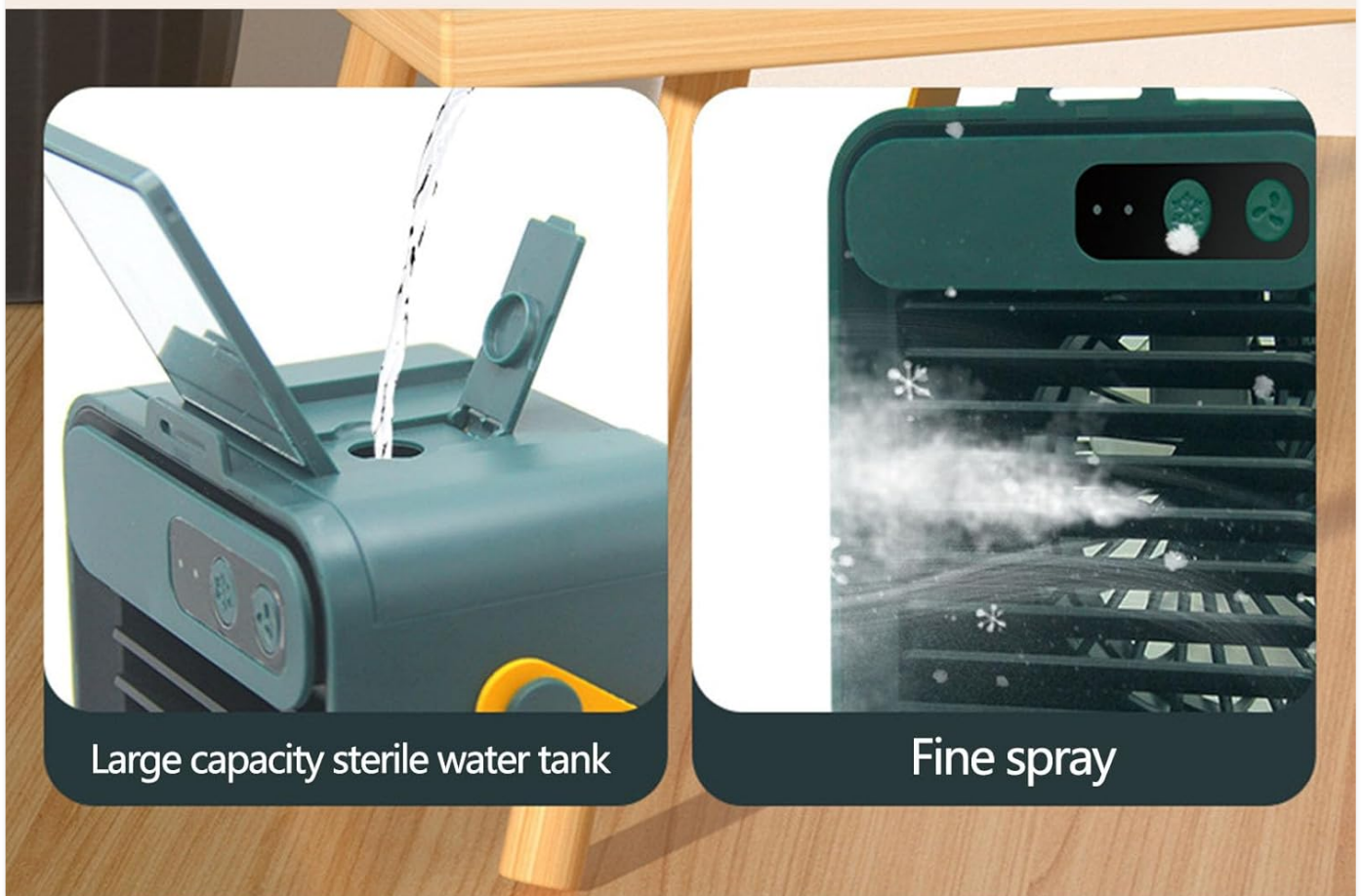
Large capacity sterile water tank