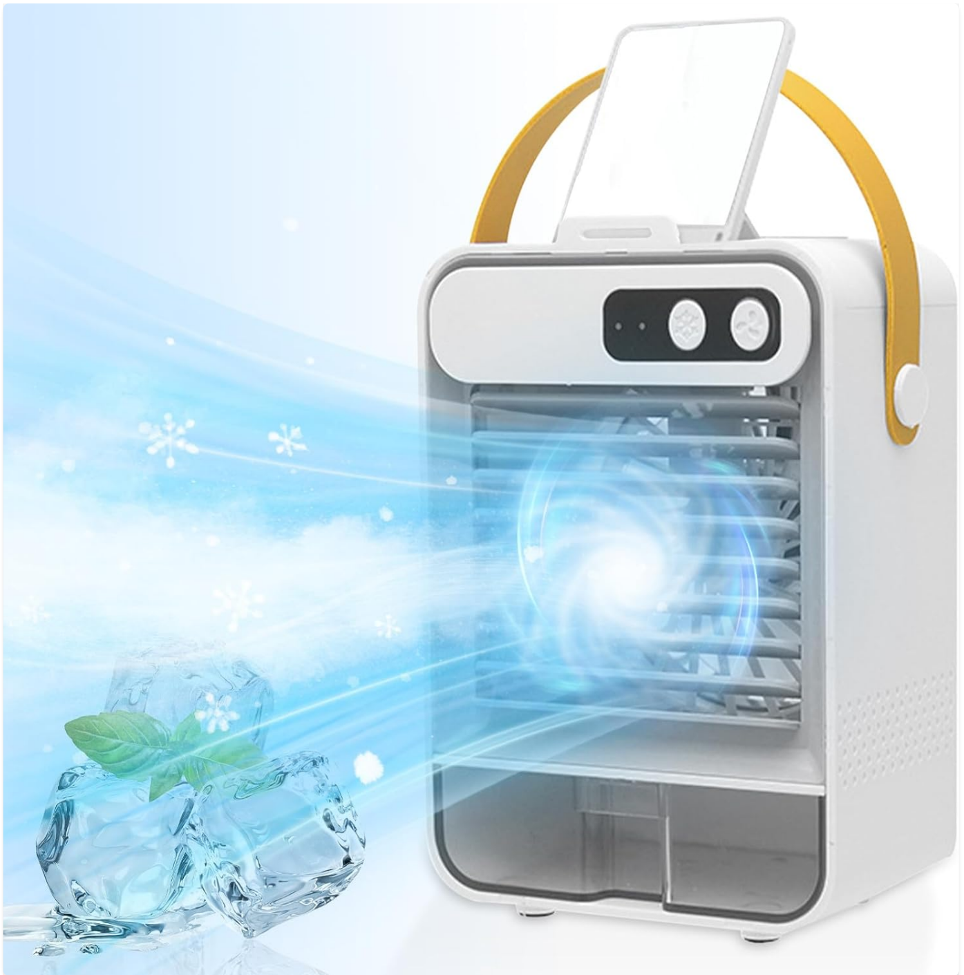
Figure 1.1: The portable air conditioner in operation, demonstrating its cooling effect.

Key features include a multi-functional design suitable for dry environments, an easy-to-use push-button control panel, a large-capacity water tank for extended use, and an energy-saving, ultra-quiet operation that minimizes disturbance.