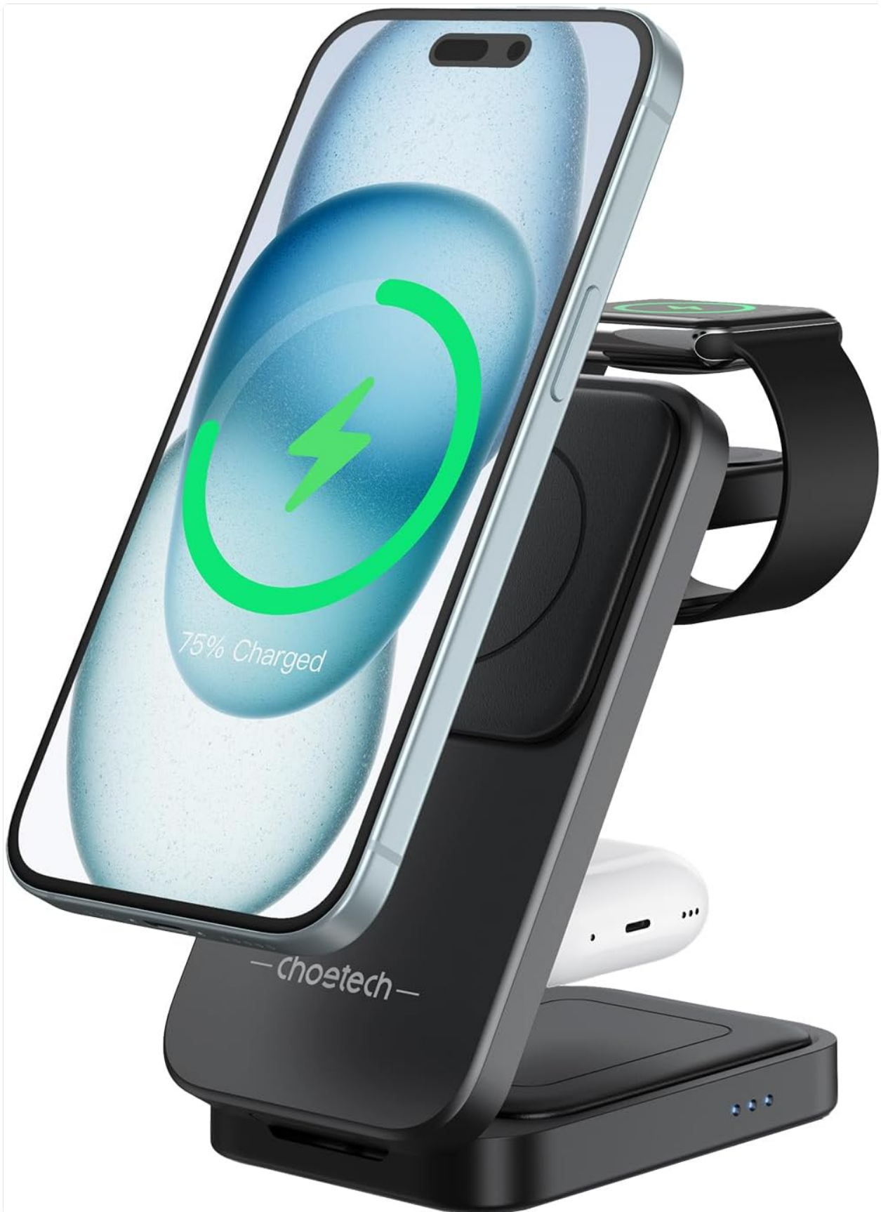
Image: The 3-in-1 charging stand with an iPhone magnetically attached, AirPods charging at the base, and an Apple Watch charging on the side arm.