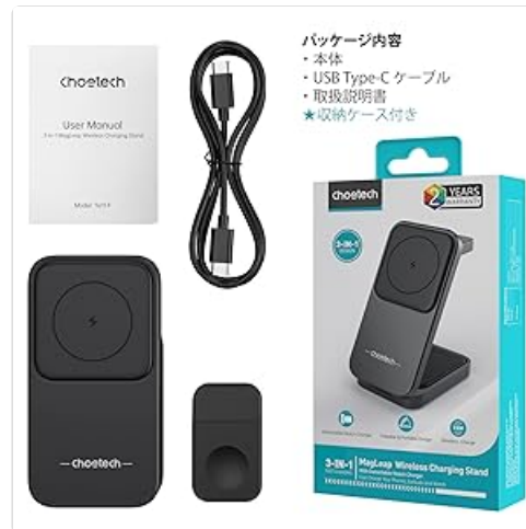
Image: Contents of the product package, showing the main charging unit, USB-C cable, storage case, and user manual.