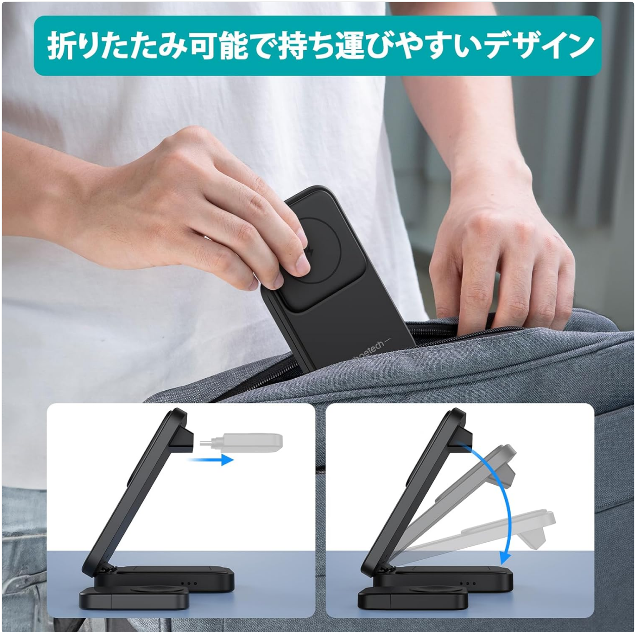
Image: The foldable design of the charging stand, illustrating how it can be easily collapsed and stored in a bag for portability.