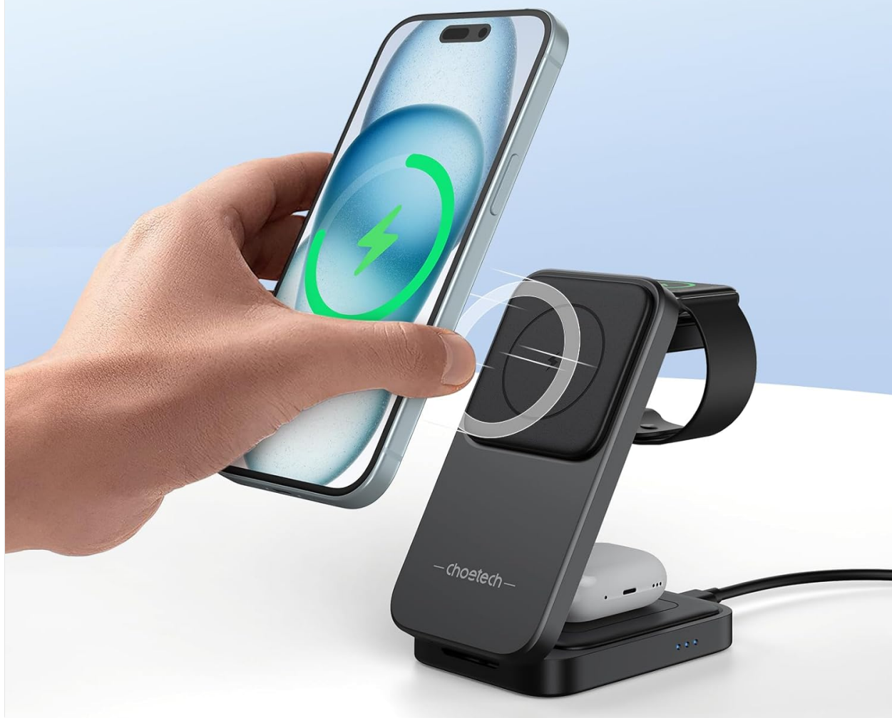
Image: A hand demonstrating the magnetic attachment of an iPhone to the charging stand, ensuring precise alignment for charging.