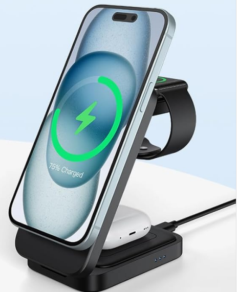
Image: A graphic illustrating the broad compatibility of the charging stand with various iPhone (12 series and later), Apple Watch (Series 2 and later), and AirPods (Pro 2 and later) models.