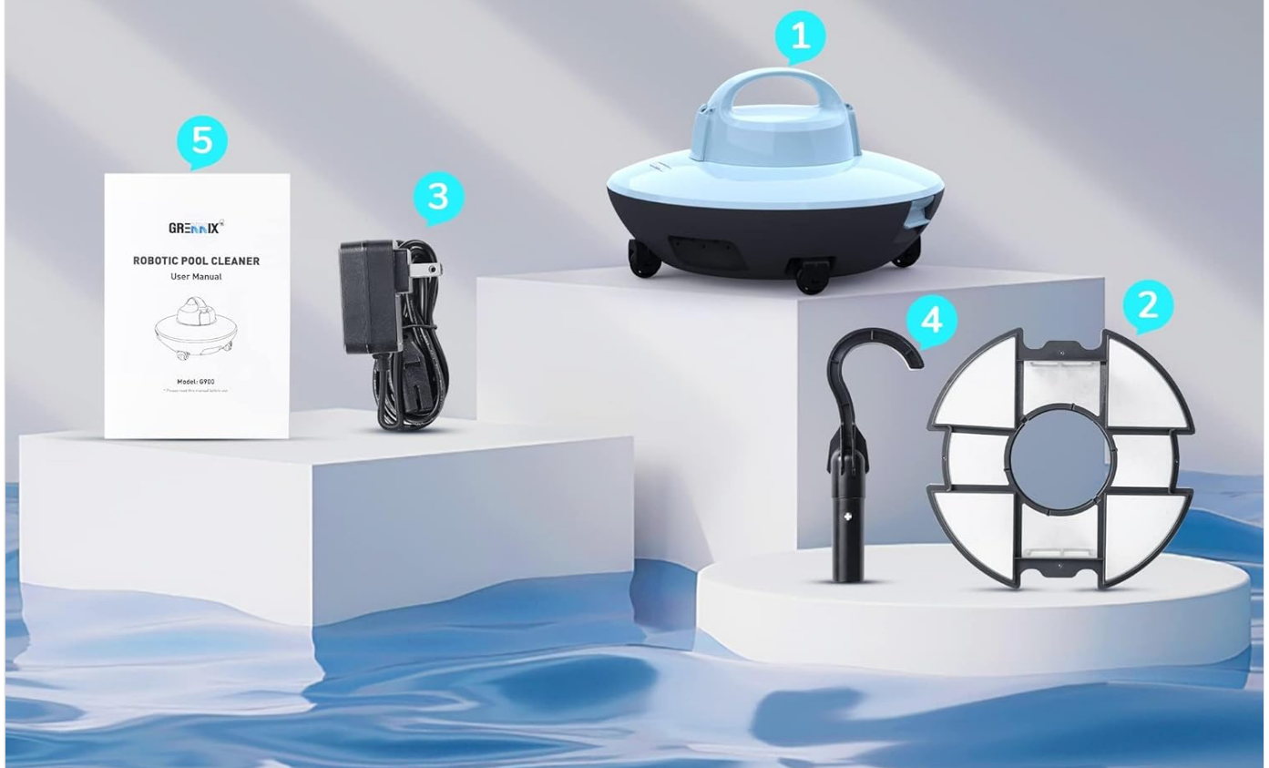
Figure 3.1: Included Accessories. The image shows the G900 cleaner, a filter, a power adapter, a retrieval hook, and the user manual.