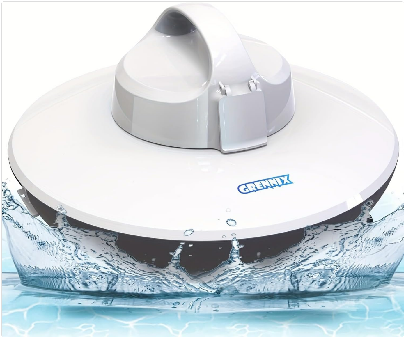
Figure 4.1: Grennix G900 Robotic Pool Cleaner. The cleaner is shown partially submerged in water, with water splashing around it.