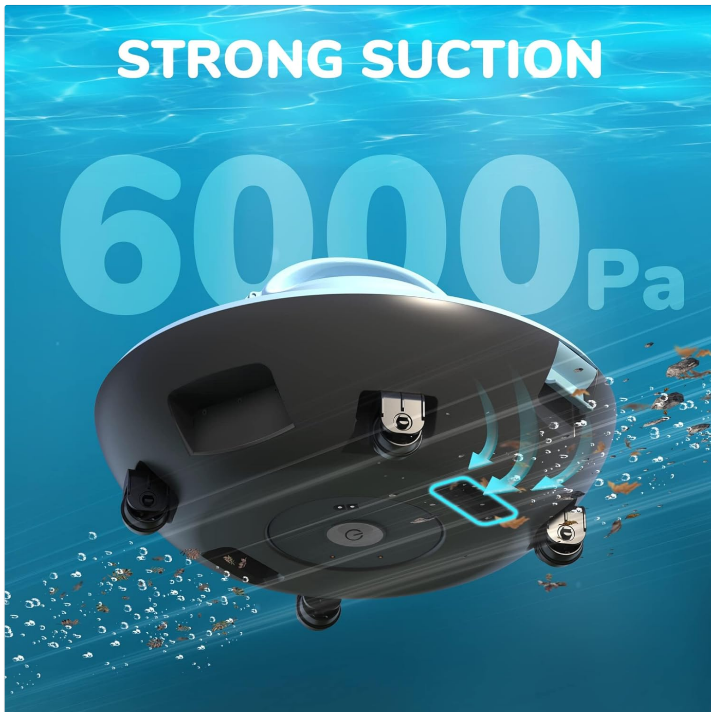
Figure 4.3: Strong Suction. The image shows the cleaner underwater, illustrating its 6000Pa suction power effectively collecting debris from the pool floor.