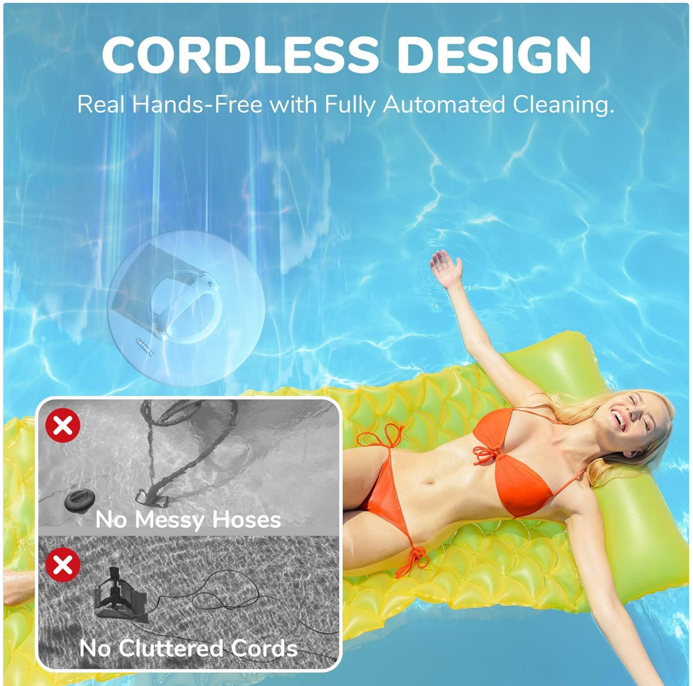
Figure 6.1: Cordless Design in Action. This image demonstrates the hands-free, fully automated cleaning experience without the need for messy hoses or cluttered cords.

Real Hands-Free with Fully Automated Cleaning.