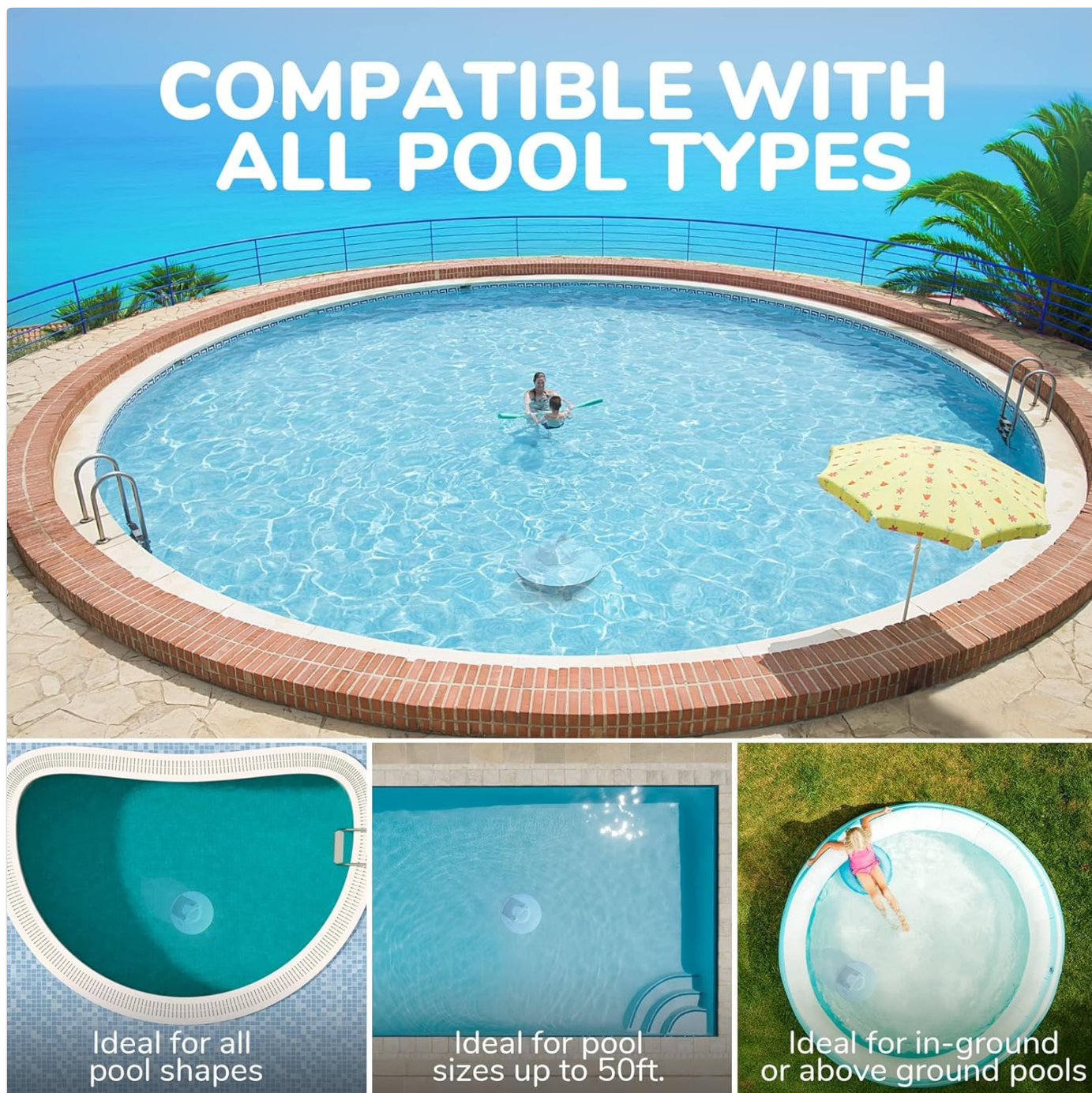
Figure 5.2: Compatible with All Pool Types. This graphic illustrates supported pool types (flat bottom, all shapes, above ground, indoor swimming pools) and unsupported types (steep slopes, diving pools, steps, walls, water lines).