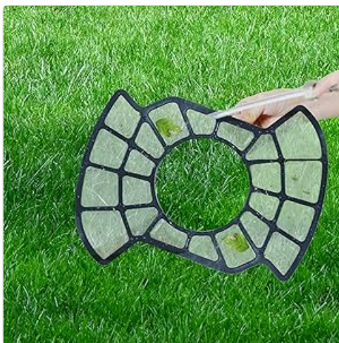
Figure 7.1: Cleaning the Filter. A hand is shown rinsing the filter screen with a hose, demonstrating the ease of maintenance.