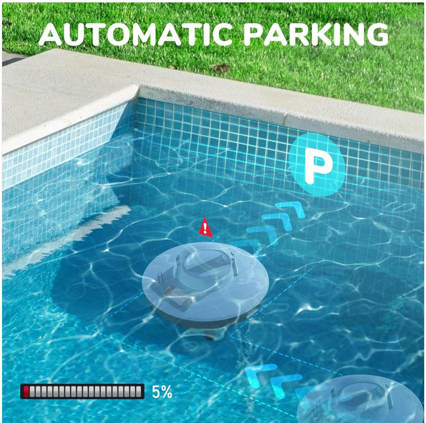
Figure 6.2: Automatic Parking. The cleaner is shown moving towards the pool edge, indicating its self-docking feature when the battery is low or cleaning is complete.