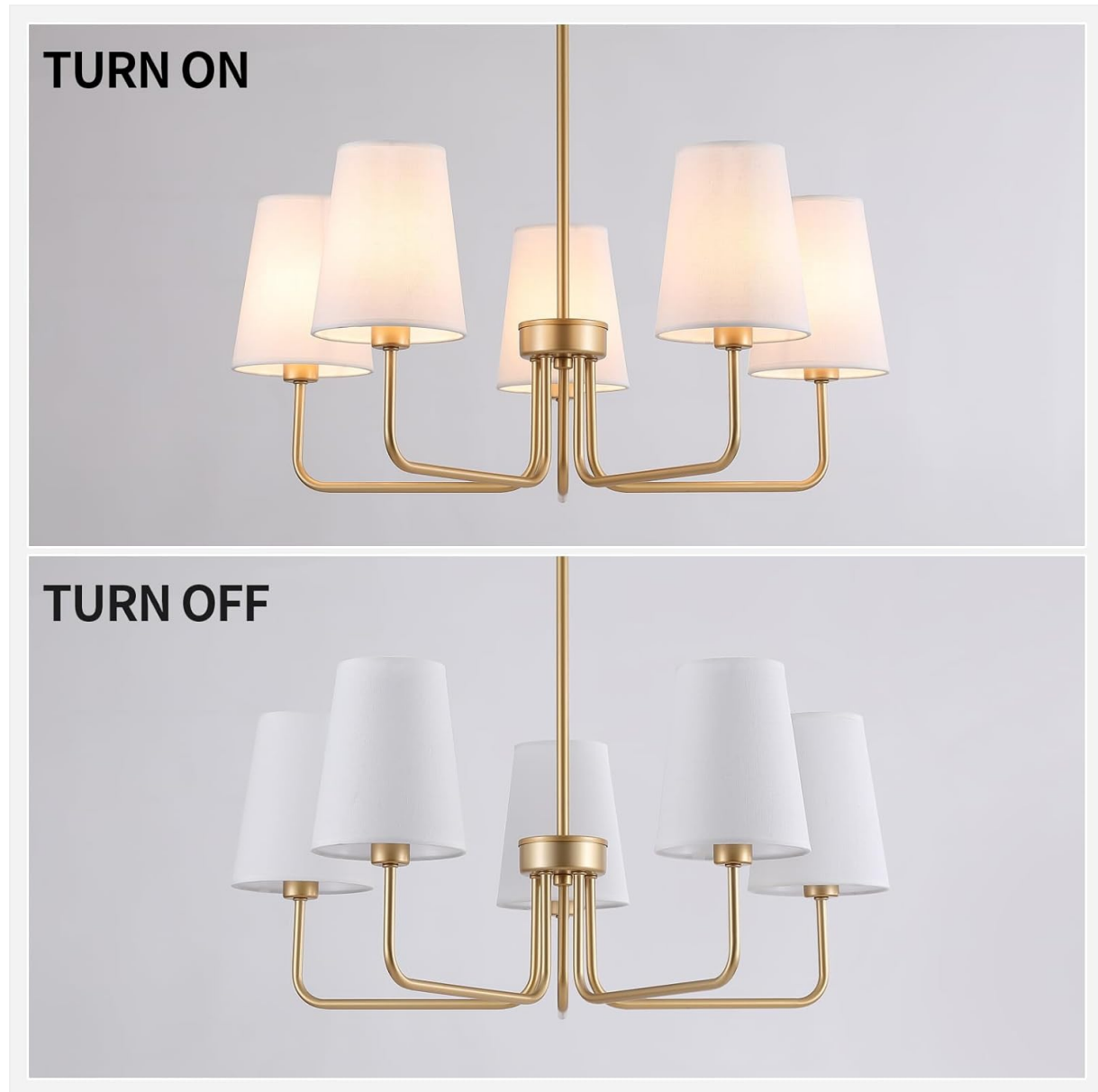
Figure 4: Chandelier ON/OFF State