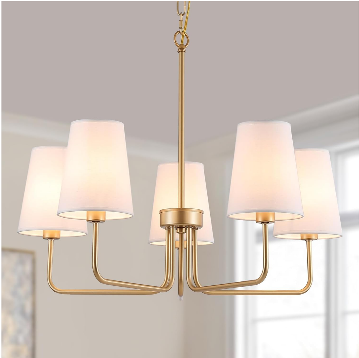
Figure 1: AMZASA Farmhouse Chandelier (Model AS9027-5WH)