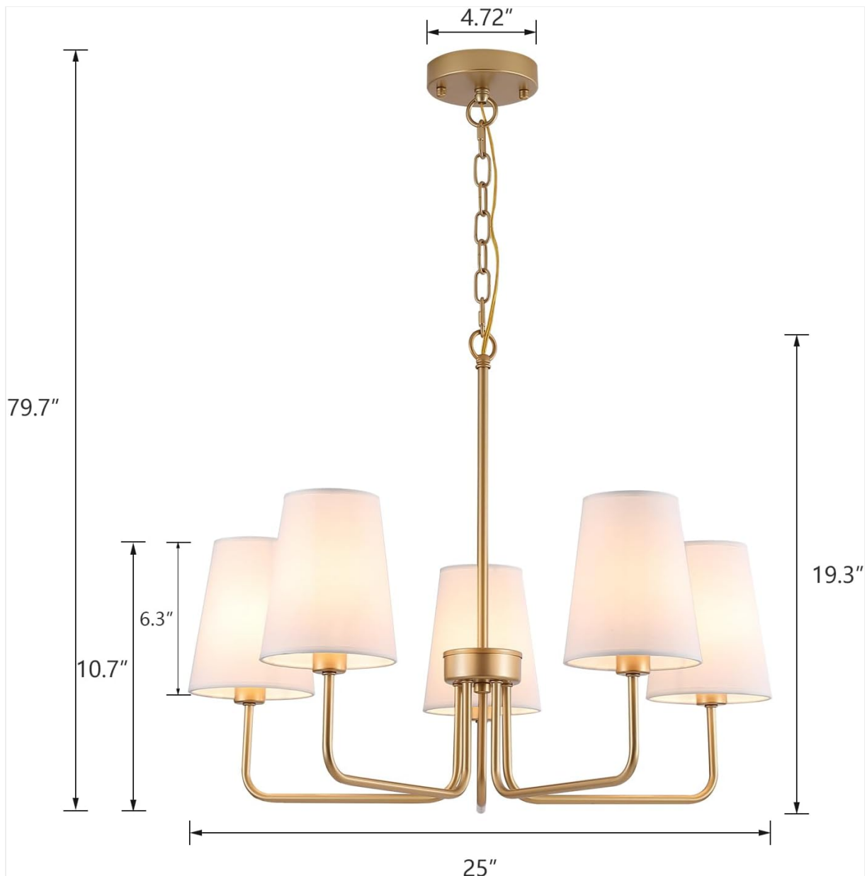
Figure 2: Chandelier Dimensions