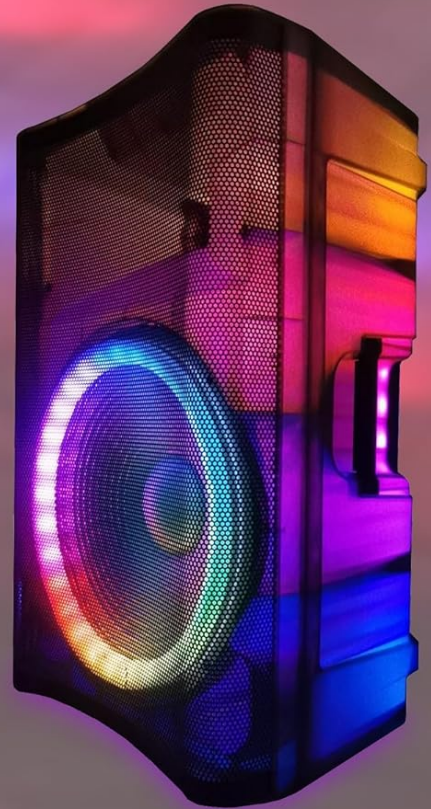
Image: The EMB Home PKL5000 speaker highlighting its 360-degree surround cabinet party lights, designed to enhance the party atmosphere.

Dual-tuned acoustical speaker ports designed to deliver best-in-class power and clarity.