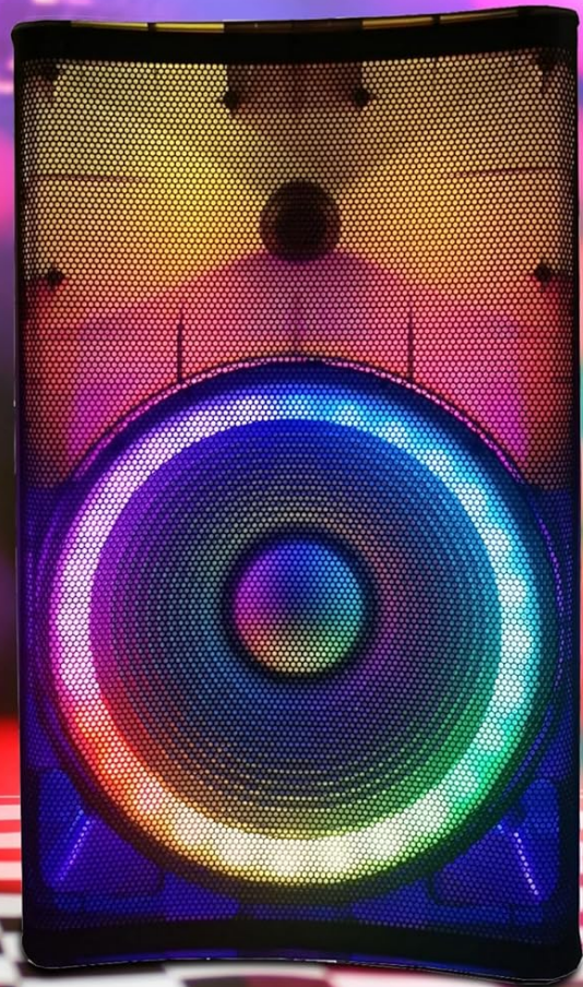
Image: The EMB Home PKL5000 speaker with indicators for a charging time of 4.5 hours and a play time of 5 hours.

➔ Charging Time: 4.5 Hours ➔ Play Time: 5 Hours