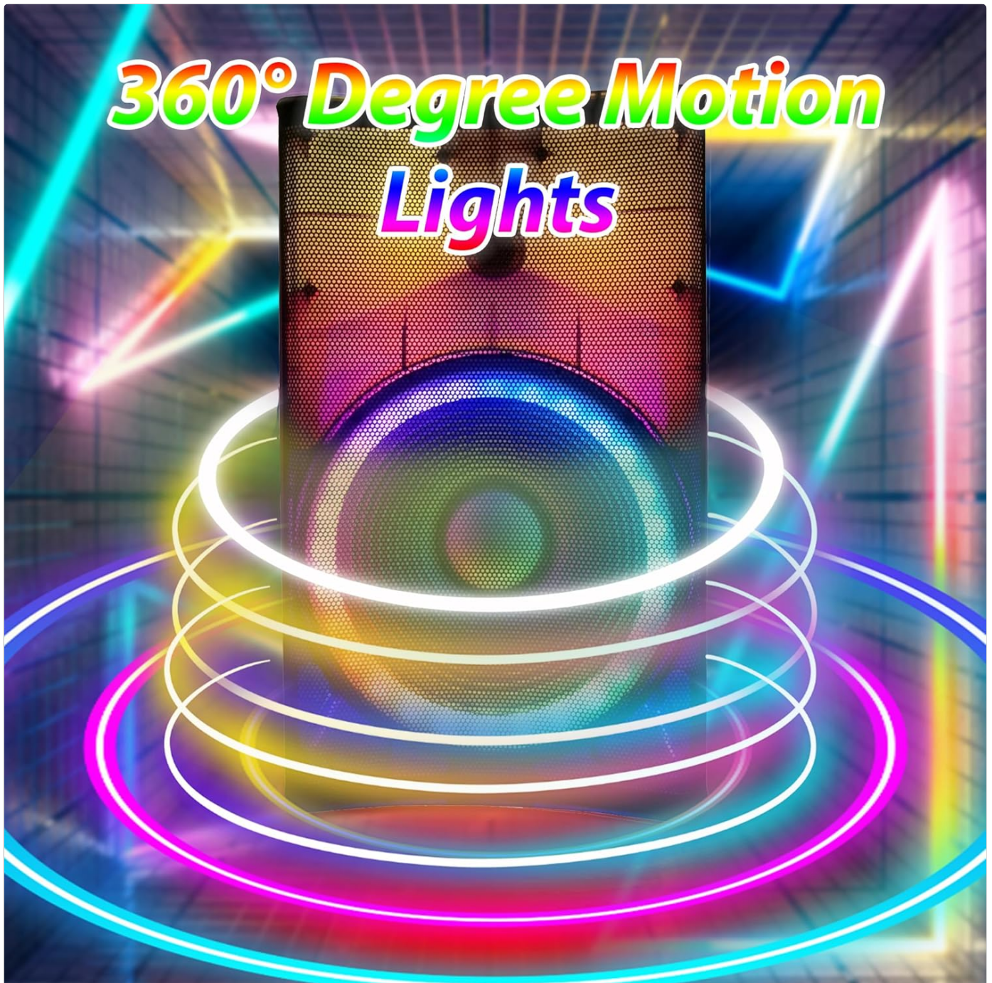
Image: The EMB Home PKL5000 speaker showcasing its dynamic 360-degree motion lights, creating a vibrant visual effect.