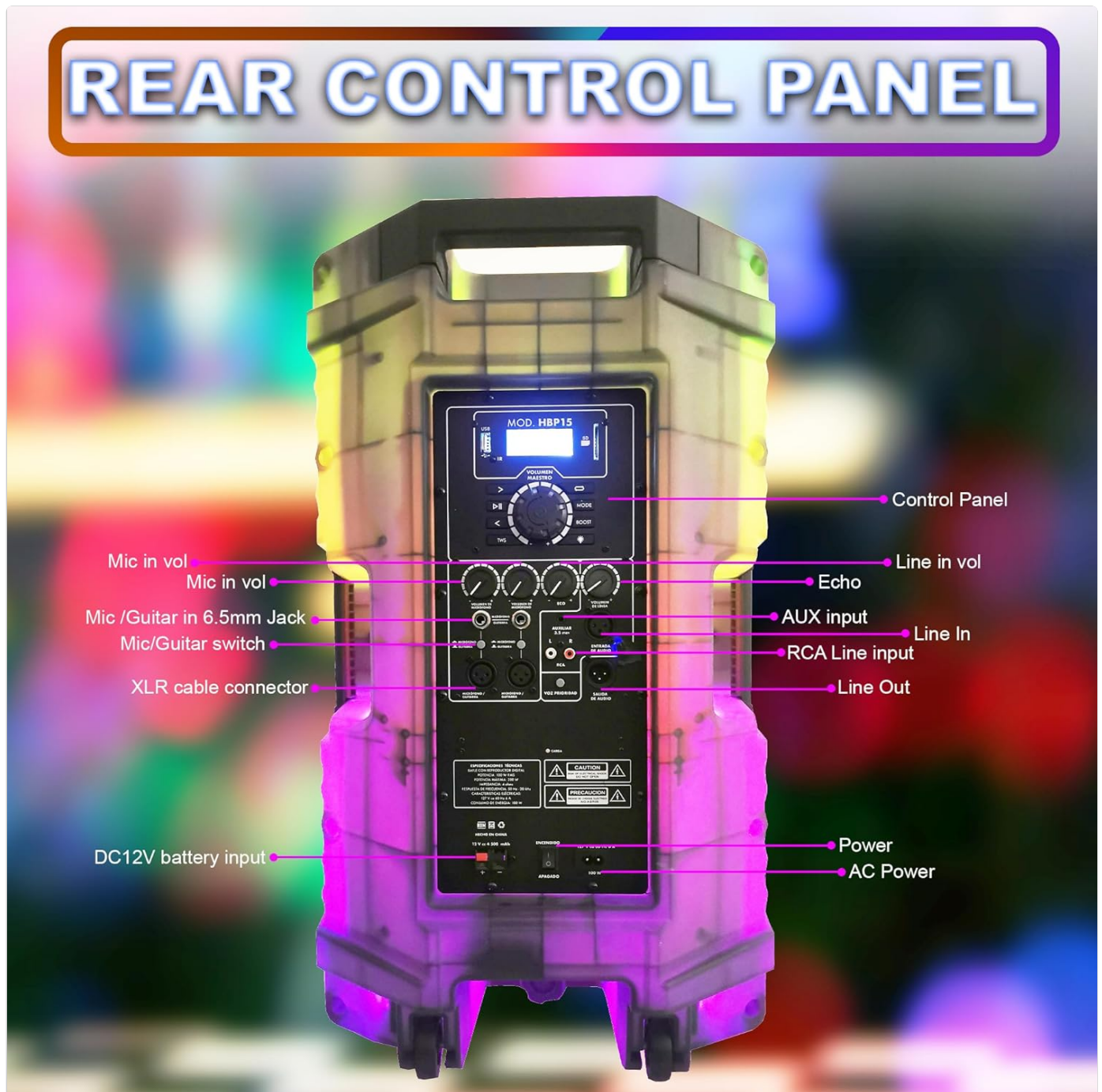
Image: Detailed view of the EMB Home PKL5000 speaker's rear control panel, showing inputs, outputs, and adjustment knobs.

Familiarize yourself with the various controls and ports located on the rear panel of your PKL5000 speaker.