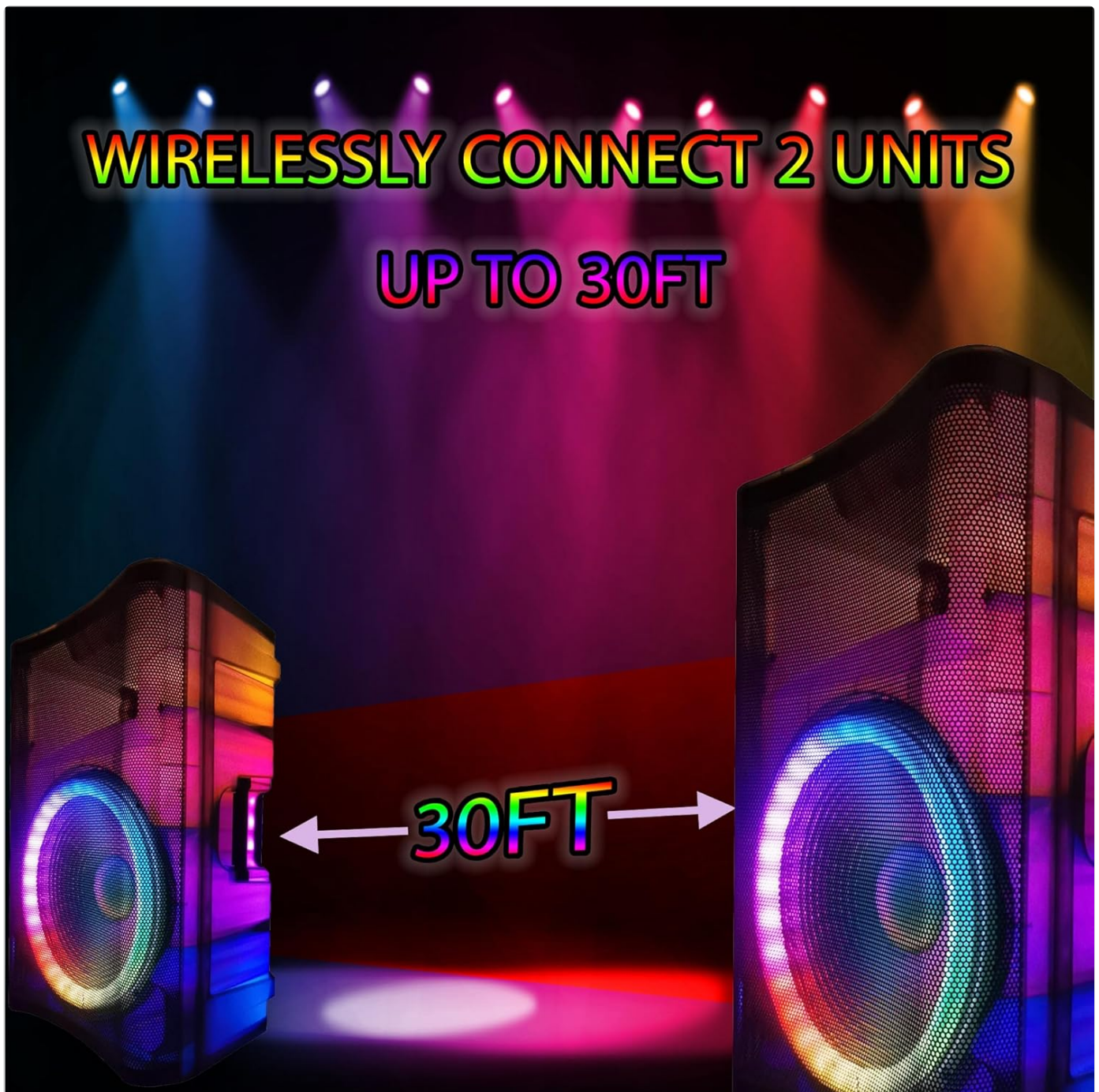
Image: Two EMB Home PKL5000 speakers positioned apart, illustrating their ability to wirelessly connect up to 30 feet for a stereo sound experience.