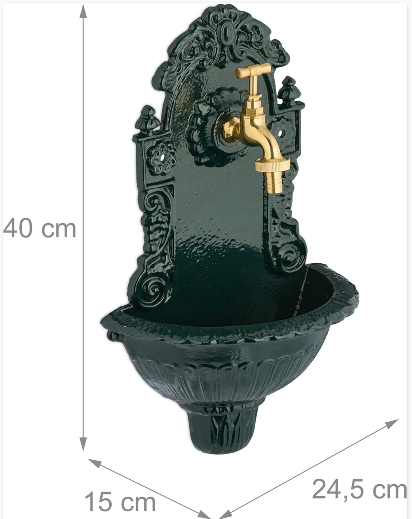
Product dimensions for installation planning.