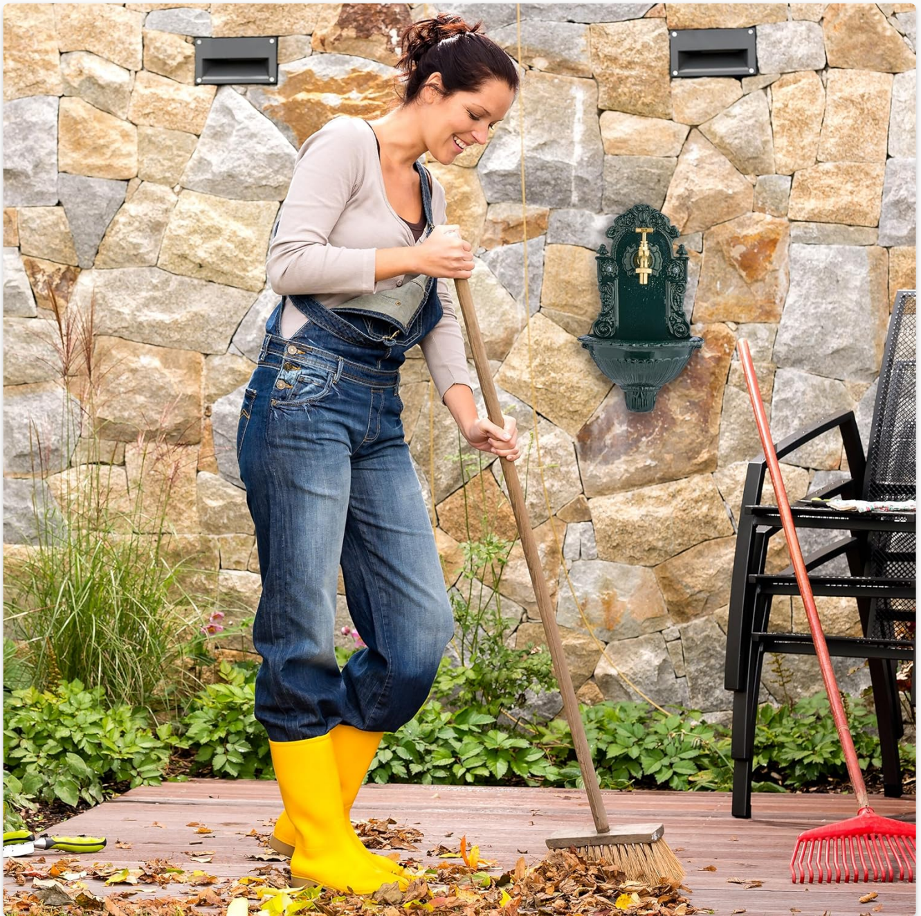
The Relaxdays outdoor garden fountain integrated into a garden environment.