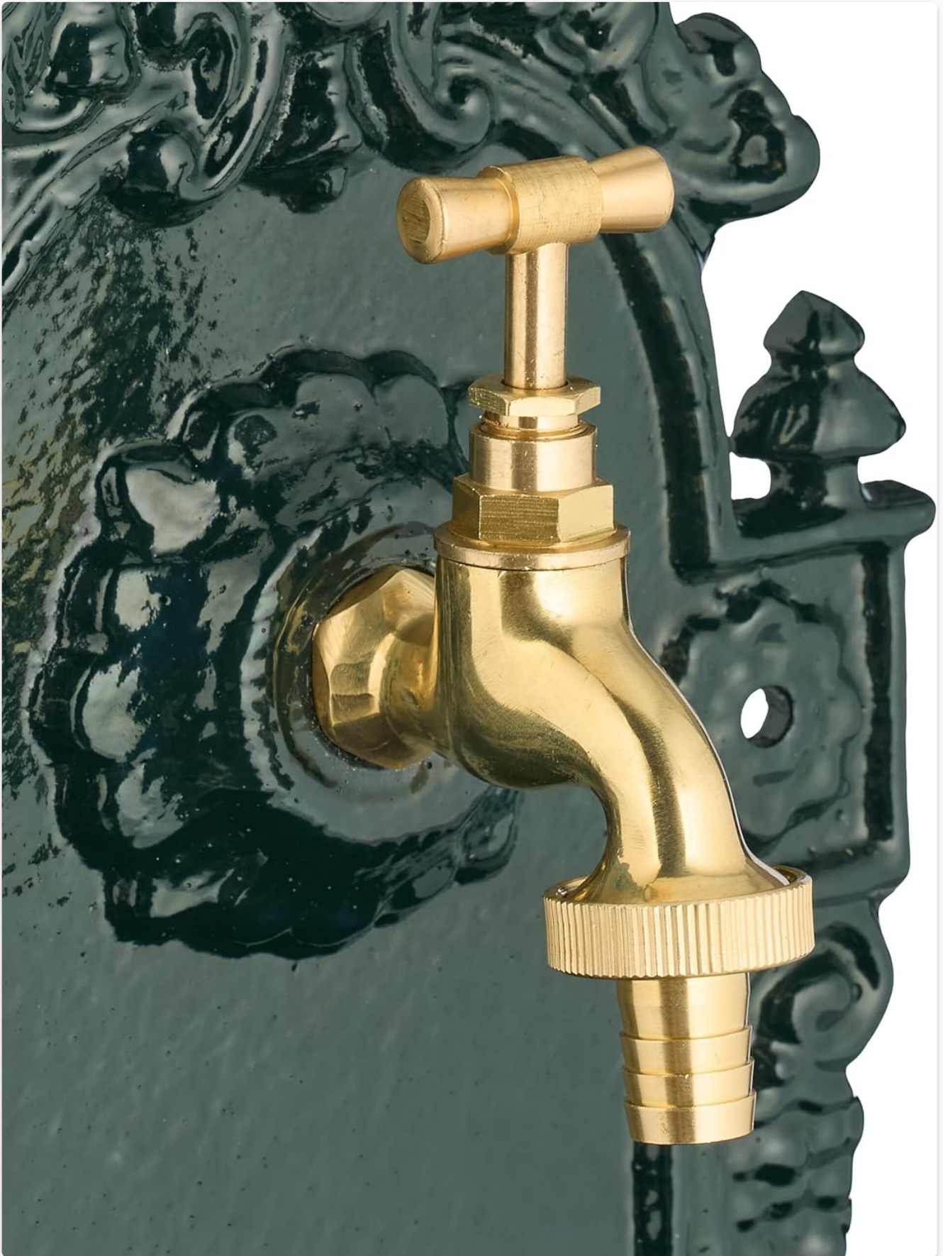
Detail of the golden tap on the fountain.