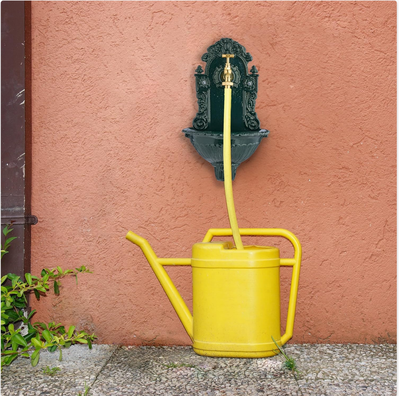
The fountain in use, filling a watering can.