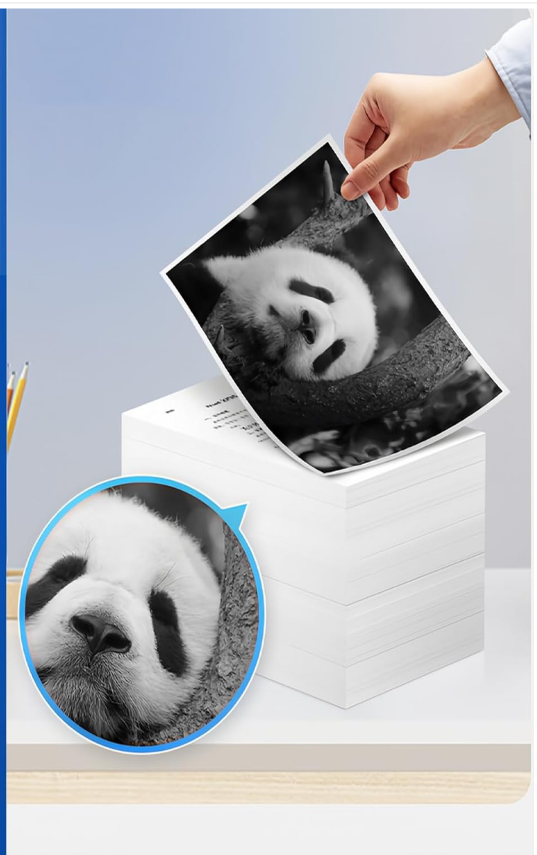
Image 4.2: An example of print quality, showing a black and white image of a panda printed on paper, suggesting clear and detailed output.