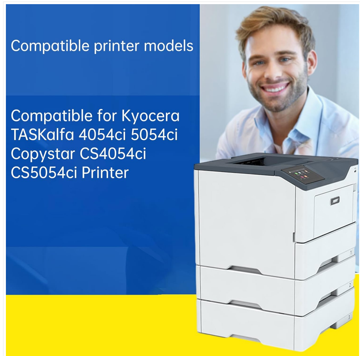
Image 2.1: A graphic illustrating the compatible printer models, including Kyocera TASKalfa 4054ci, 5054ci, Copystar CS4054ci, and CS5054ci. A printer unit is shown in the background.

This cartridge includes an enhanced compatible chip to ensure seamless communication and recognition by your printer.