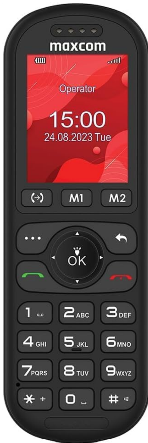
Figure 1: Front view of the Maxcom MM39D phone, showcasing its large buttons and clear display.