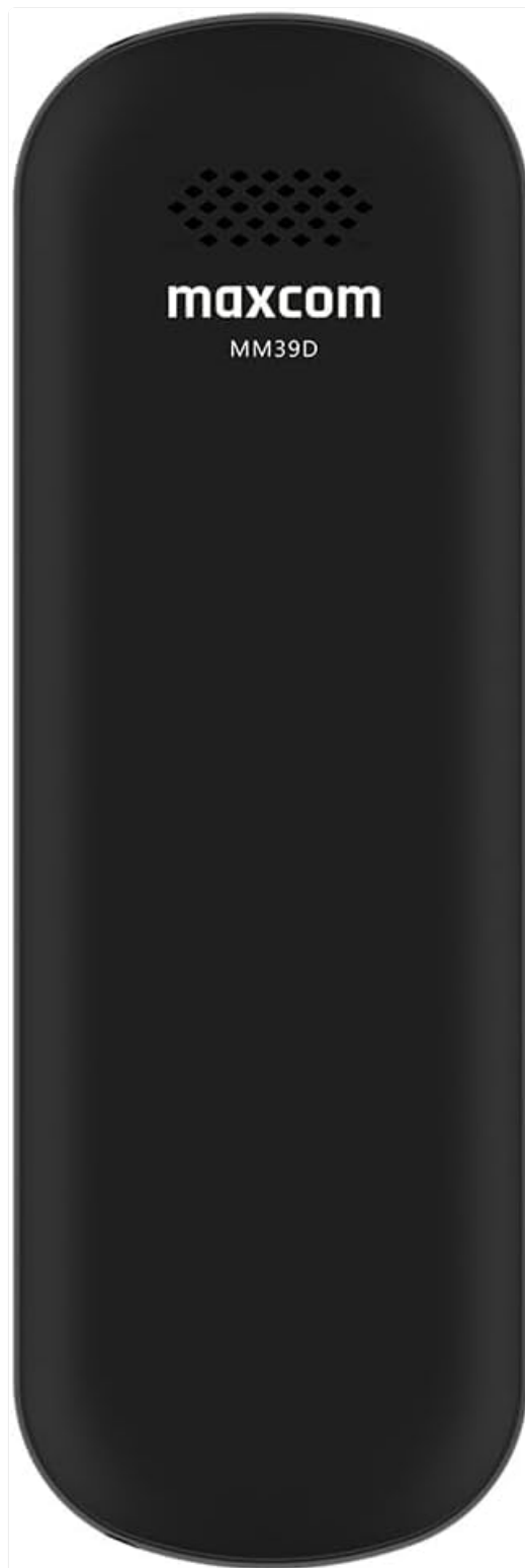
Figure 2: Rear view of the Maxcom MM39D, indicating the area for battery and SIM card installation.