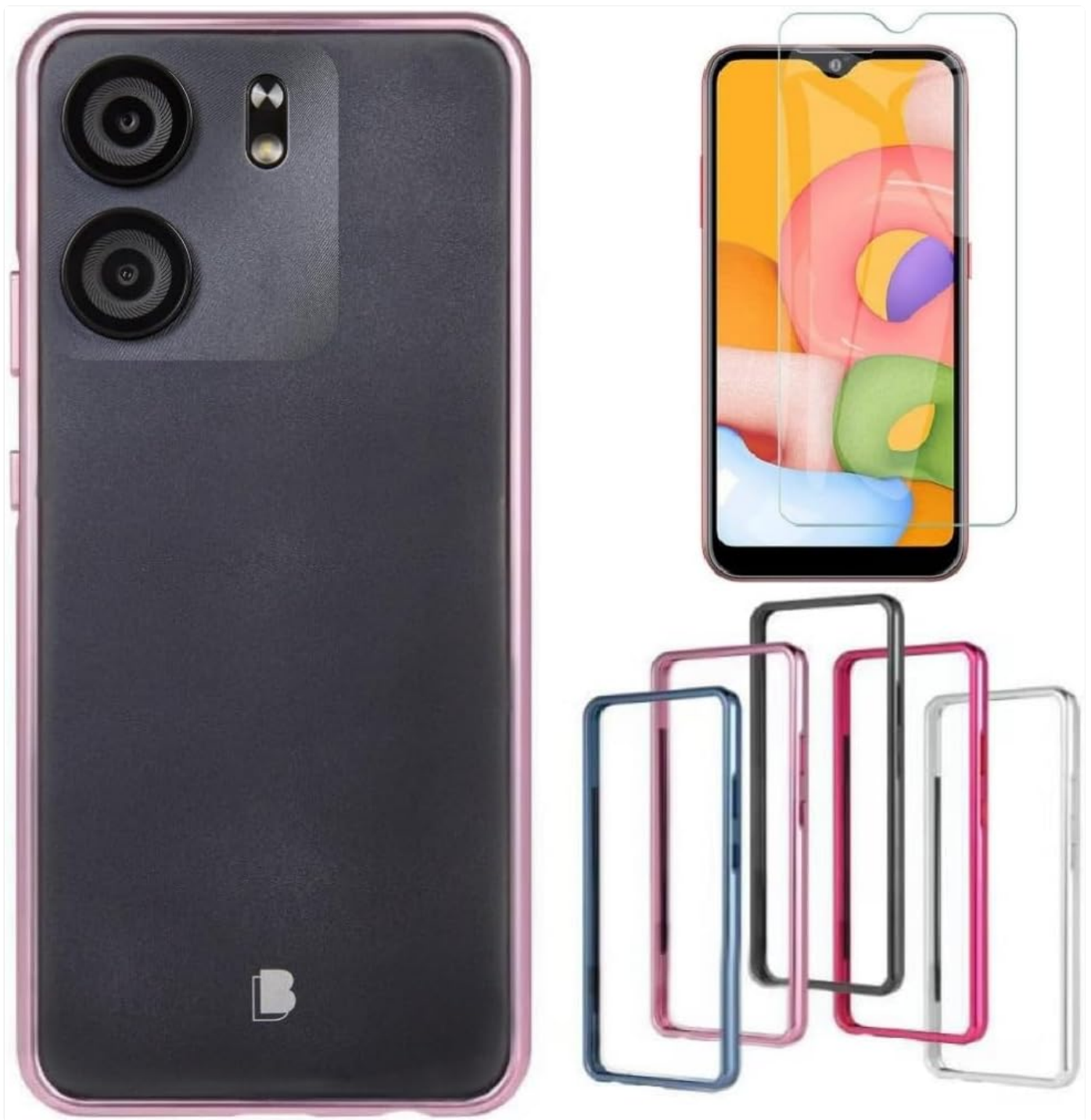
Image: The BLU View 5 B160V phone fitted with the pink bumper case, alongside the tempered glass screen protector. Various color options for the bumper case are also shown.