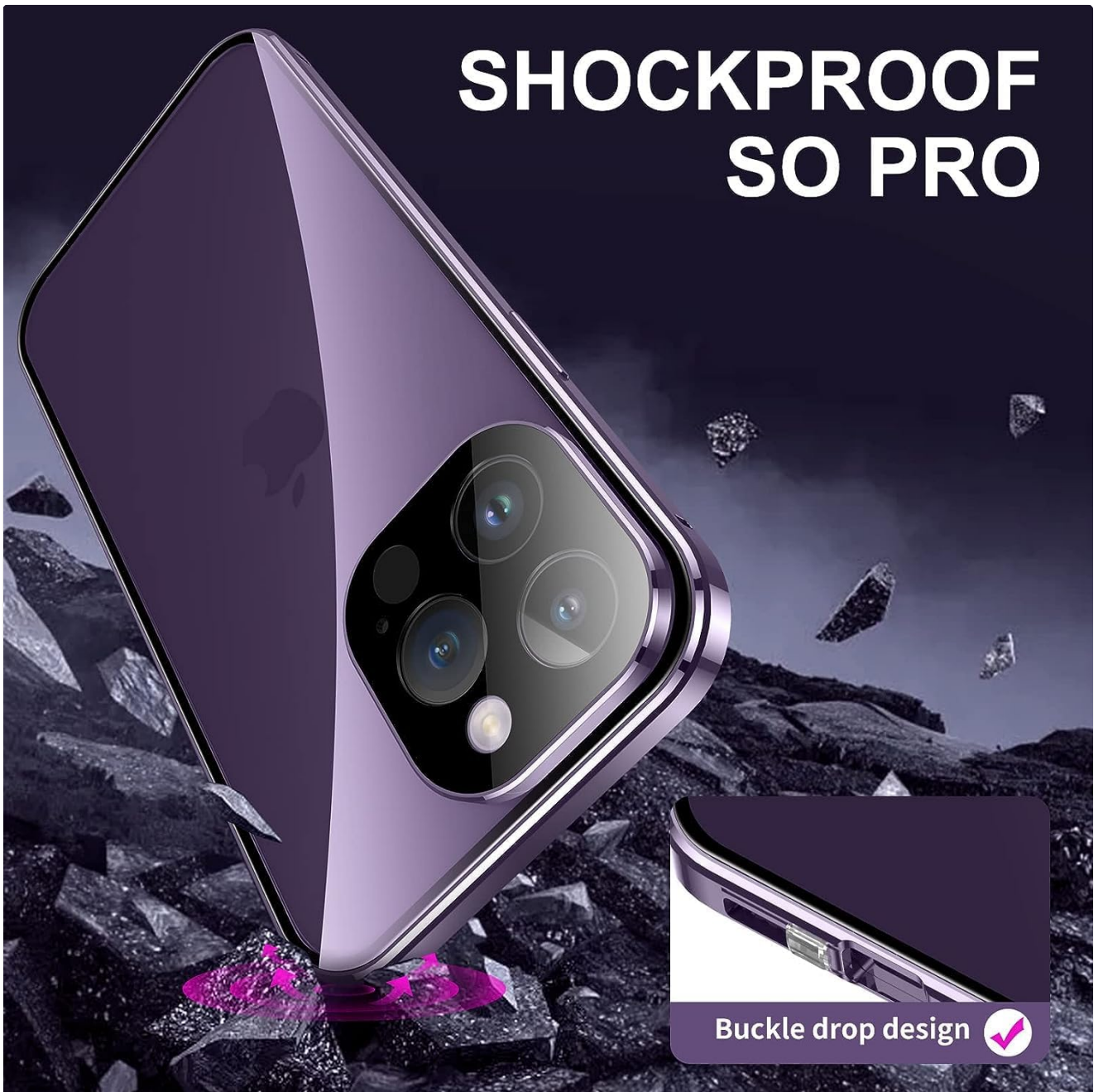
Image: A visual depicting the shockproof capabilities of the phone case, showing it protecting a phone during an impact, with a close-up of the reinforced corner design.