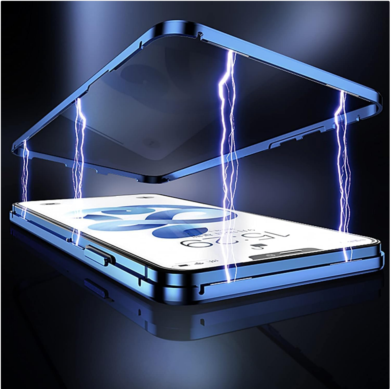
Image: Illustration of the magnetic assembly process for the phone case, demonstrating how the two aluminum frame halves connect around the phone.

The aluminum bumper case features a magnetic design for easy assembly. It consists of two parts that magnetically connect around your phone.