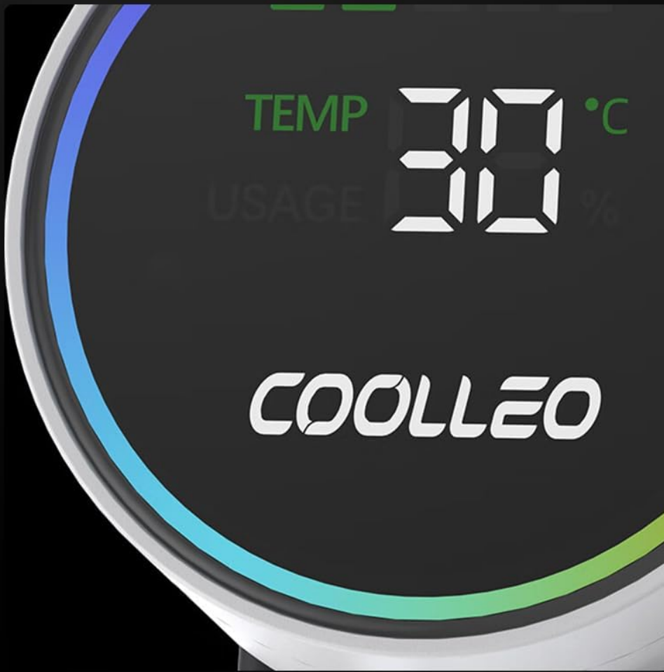
Figure 6: 2.5D Tempered Curved Glass. A close-up of the pump head's display, highlighting the curved glass cover and ARGB lighting effects.

ARGB PHANTOM APERTURE WITH 2.5D CURVED GLASS COVER DELIVERS A WORK OF CRAFTED AESTHETICS WITH A PREMIUM FEEL. SUPPORTING 5V ARGB DIVINE LIGHT SYNCHRONIZATION LETS YOUR HOST ROAM WITH LIGHT.