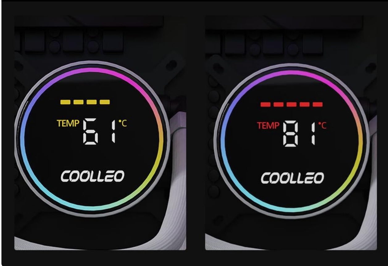
Figure 2: Intelligent Temperature Warning. The digital display on the pump head changes color to indicate CPU temperature status, showing yellow for temperatures above 60°C and red for temperatures above 80°C.

When the CPU temperature exceeds 80 degrees Celsius, a red alert is displayed to remind the CPU usage status in time.