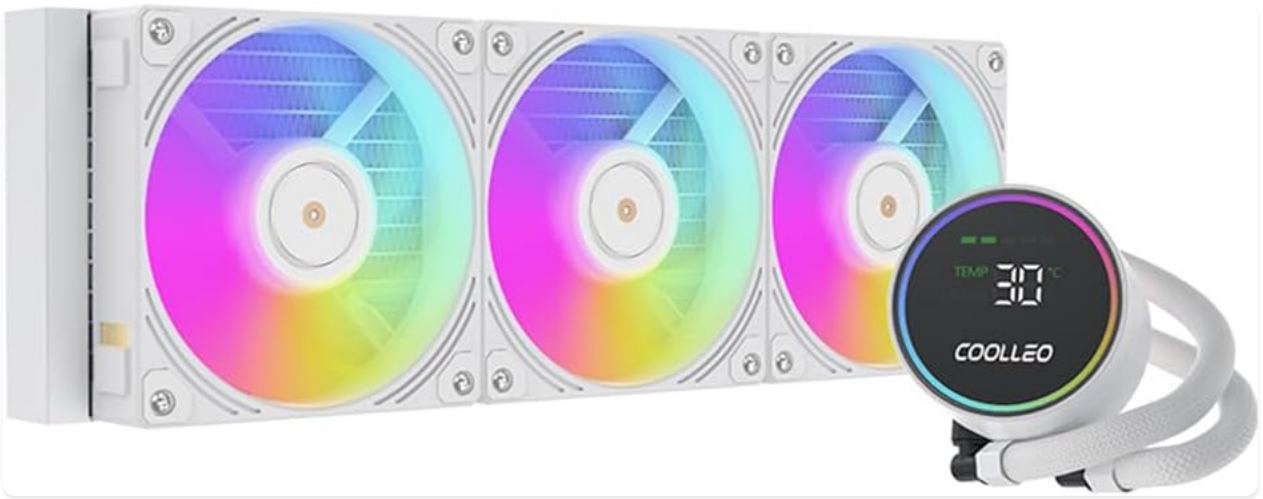
Figure 1: COOLLEO BL360 Digital Display White ARGB 360mm AIO CPU Cooler. This image shows the complete cooler unit, including the radiator with three white ARGB fans and the pump head with its integrated digital display.