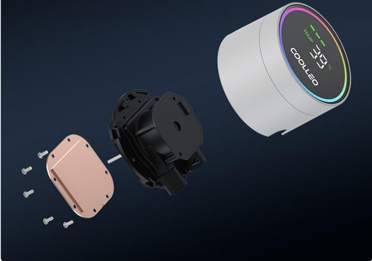
Figure 3: Three-Phase Nine-Stage Motor Pump. An exploded view illustrating the internal components of the pump, highlighting its advanced motor design for improved efficiency and reduced noise.

Three-phase motors are more efficient than single-phase motors/more stable in operation/lower in noise/less vibration, longer in life. Nine-stage stator has more magnetic poles, smoother phase change, and further reduces vibration/lower noise.