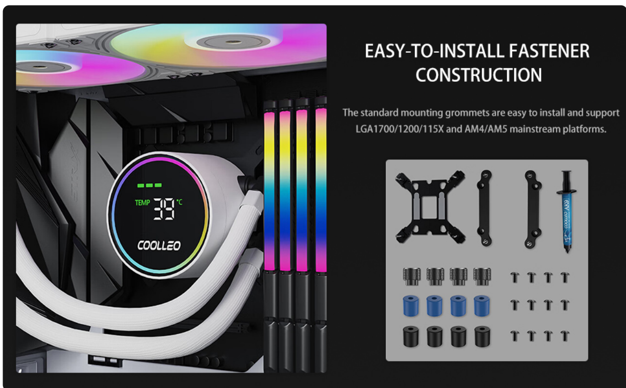
Figure 7: Easy-to-Install Fastener Construction. This image displays the various mounting brackets, screws, and standoffs included for different CPU sockets, along with a tube of thermal paste, facilitating a straightforward installation process.