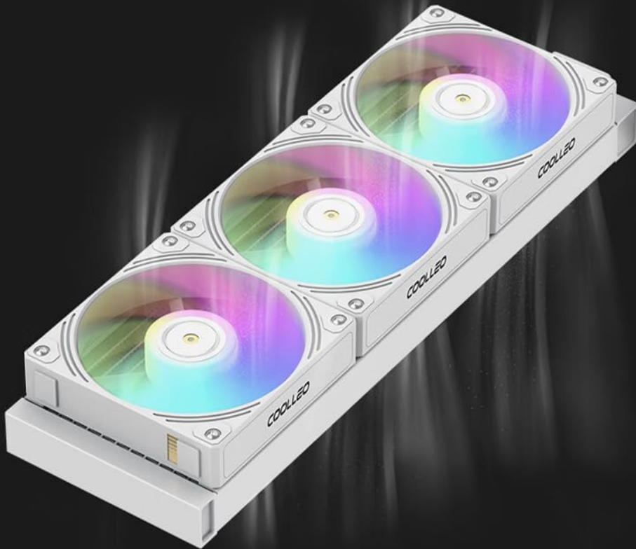
Figure 4: High Air Pressure Thickened Cooling Rows. This image showcases the Hurricane T28Mag fans and their key performance metrics: 2.9 mm/H 2 O full load wind pressure, 80 CFM maximum airflow, and 2050 RPM full load speed.