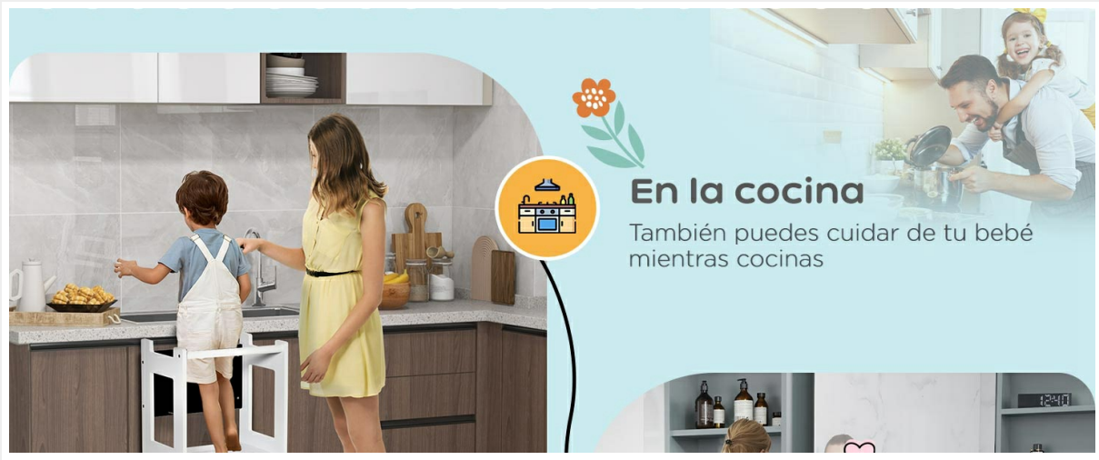
Image: A child assisting an adult in the kitchen while standing on the learning tower.