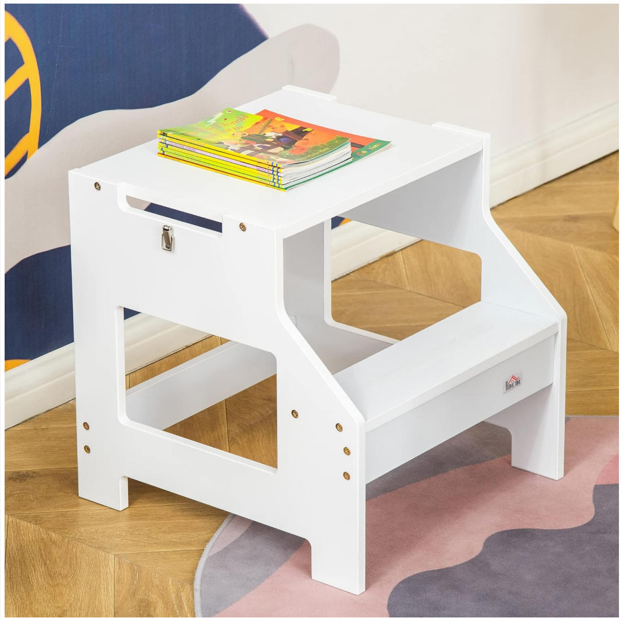
Image: The learning tower transformed into a compact desk and chair, suitable for reading or drawing.