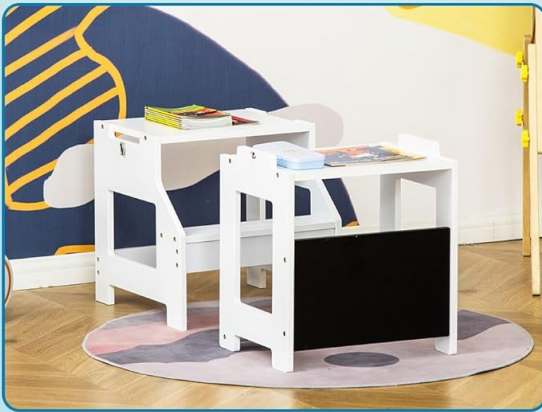
Juego de mesa y silla

Desbloquee para convertir la torre de aprendizaje en una silla y un escritorio