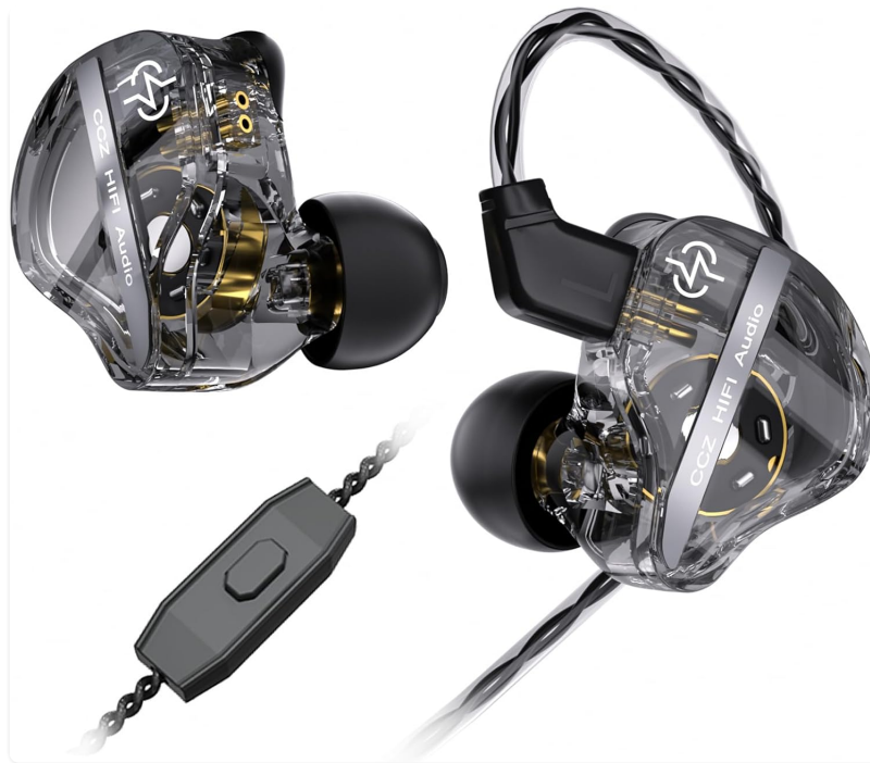
Image: A detailed view of the CCZ DC01 PRO earbuds, highlighting their transparent design and internal acoustic structure.