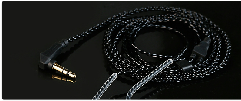
Image: A close-up of the detachable cable's 2-pin connectors, illustrating how they connect to the earbuds.