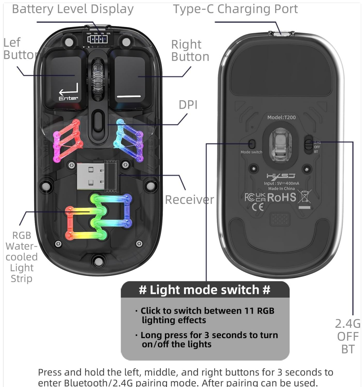
Image: Detailed diagram of the mouse components, including the Type-C charging port and battery level display.