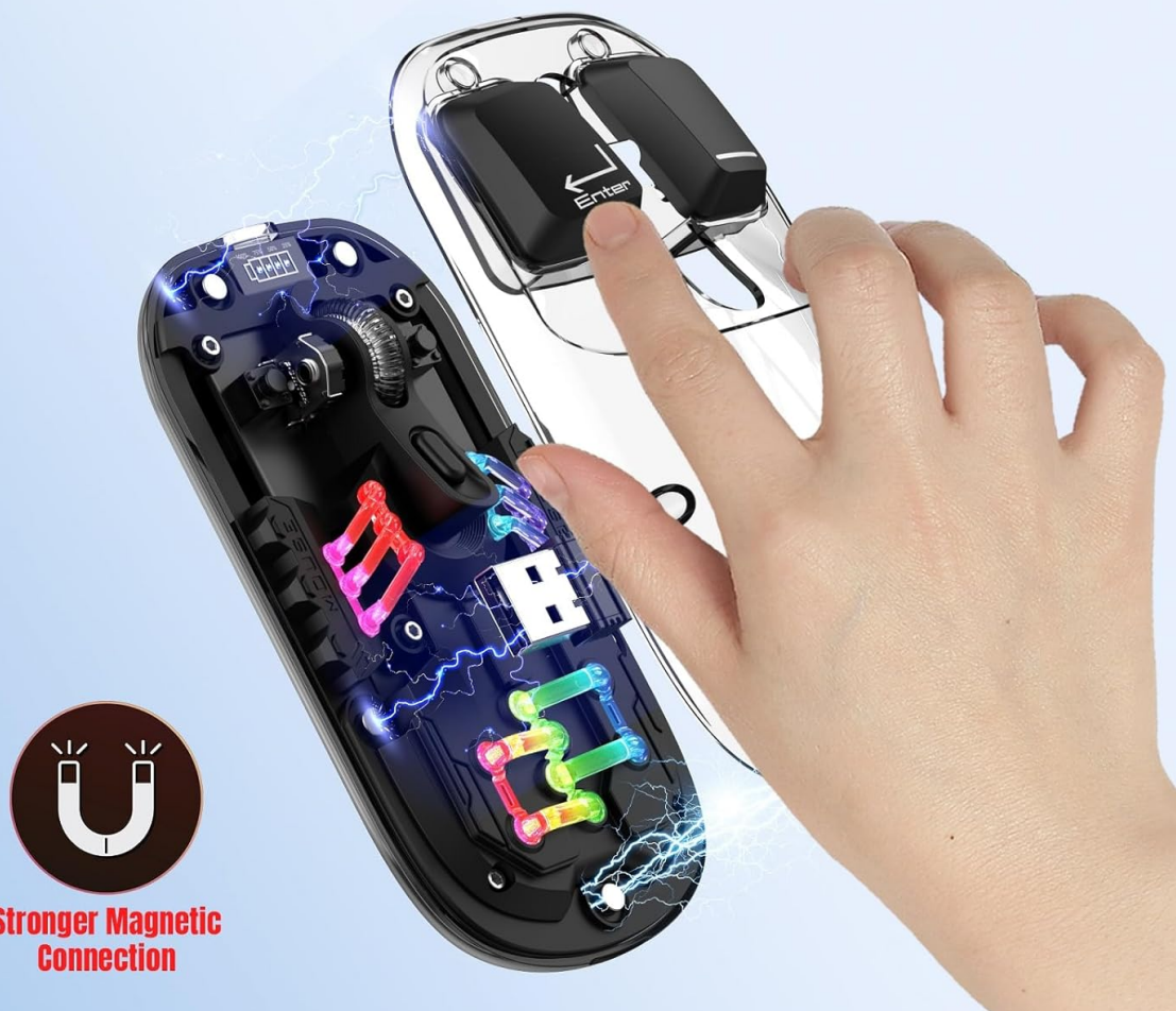
Image: Demonstrating the magnetic top cover and USB receiver location.