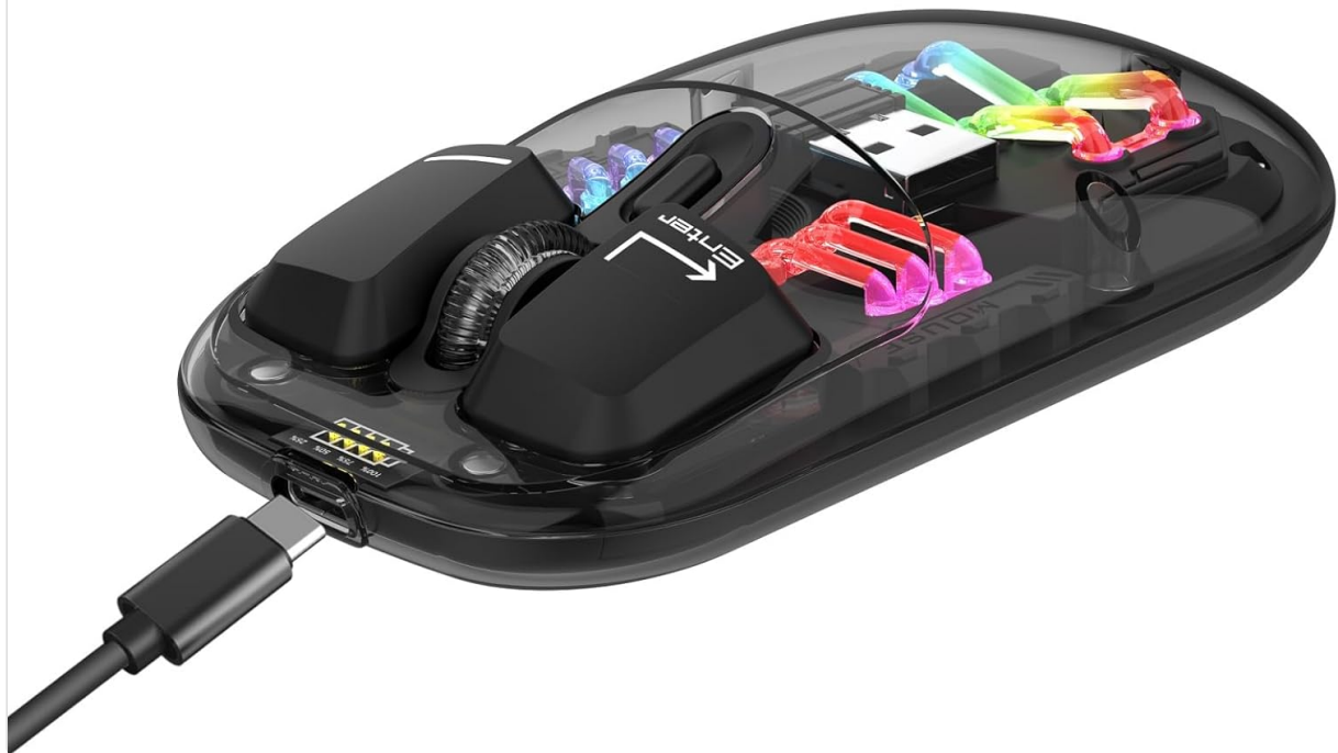
Image: The mouse highlighting its dual-mode connectivity options.