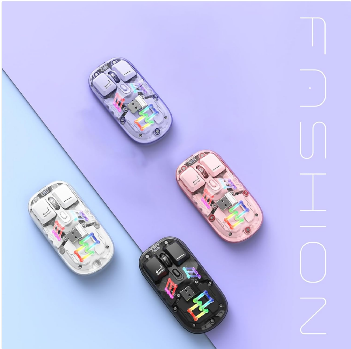
Image: The mouse displaying various RGB lighting effects.