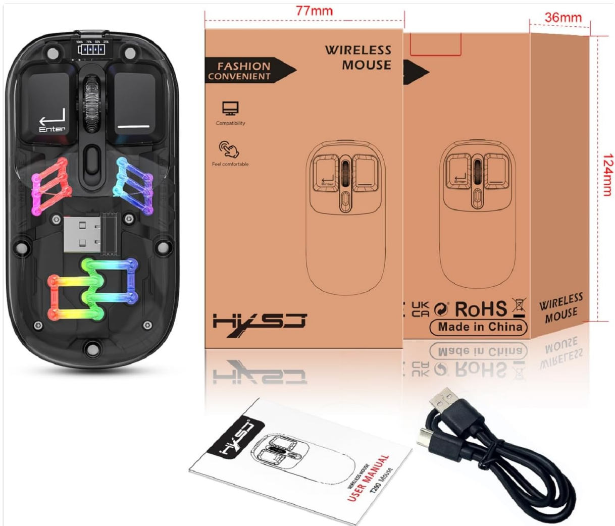
Image: Package contents of the Attoe Wireless Bluetooth Mouse MXY0614.