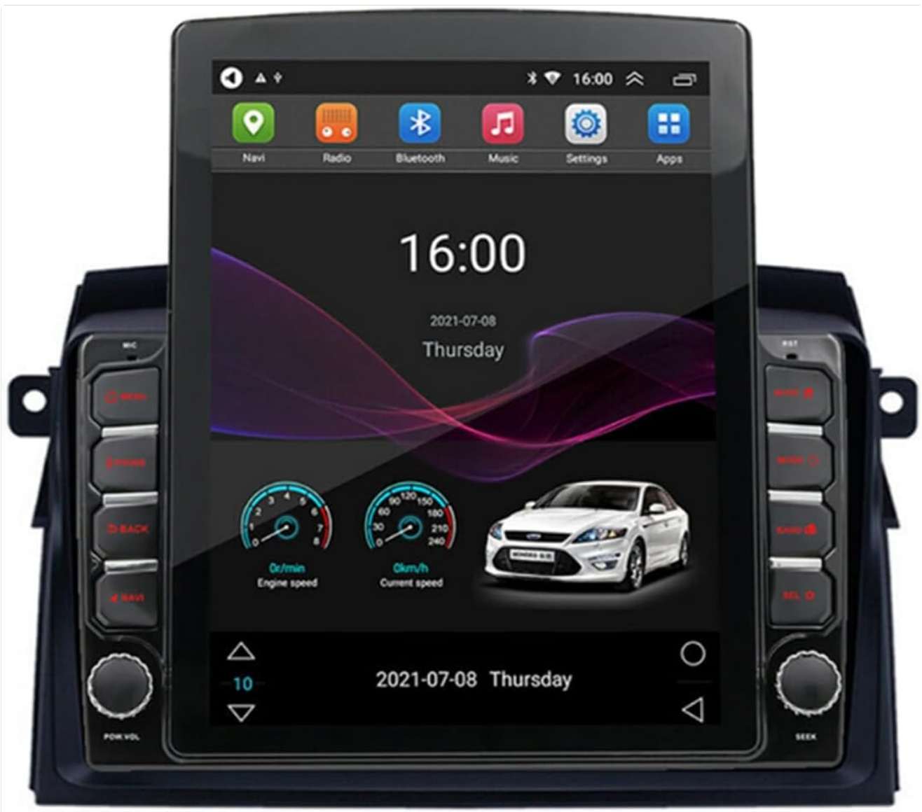
Image: The main screen interface of the GOJOHO car stereo, displaying navigation, radio, Bluetooth, music, settings, and app icons. It also shows a clock, date, and vehicle speed gauges.