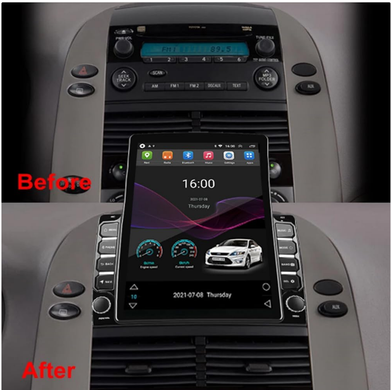
Image: Comparison of the dashboard before and after installing the GOJOHO car stereo in a Toyota Sienna. The new unit features a large vertical touchscreen display.

The included harness is pre-wired for direct connection. This unit supports existing steering wheel controls, factory amplifiers, factory cameras, factory USB ports, radar systems, door information display, and A/C information display.