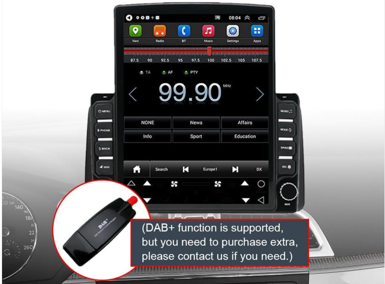
Image: The car stereo screen showing the FM radio interface, tuned to 99.90 MHz. Options for 'News', 'Affairs', 'Info', 'Sport', and 'Education' are visible. A USB dongle for DAB+ functionality is shown in an inset.

Display Radio Station Name and Covers, You Can transfer the music to the car stereo by FM, Long press to save your favorite radio station.