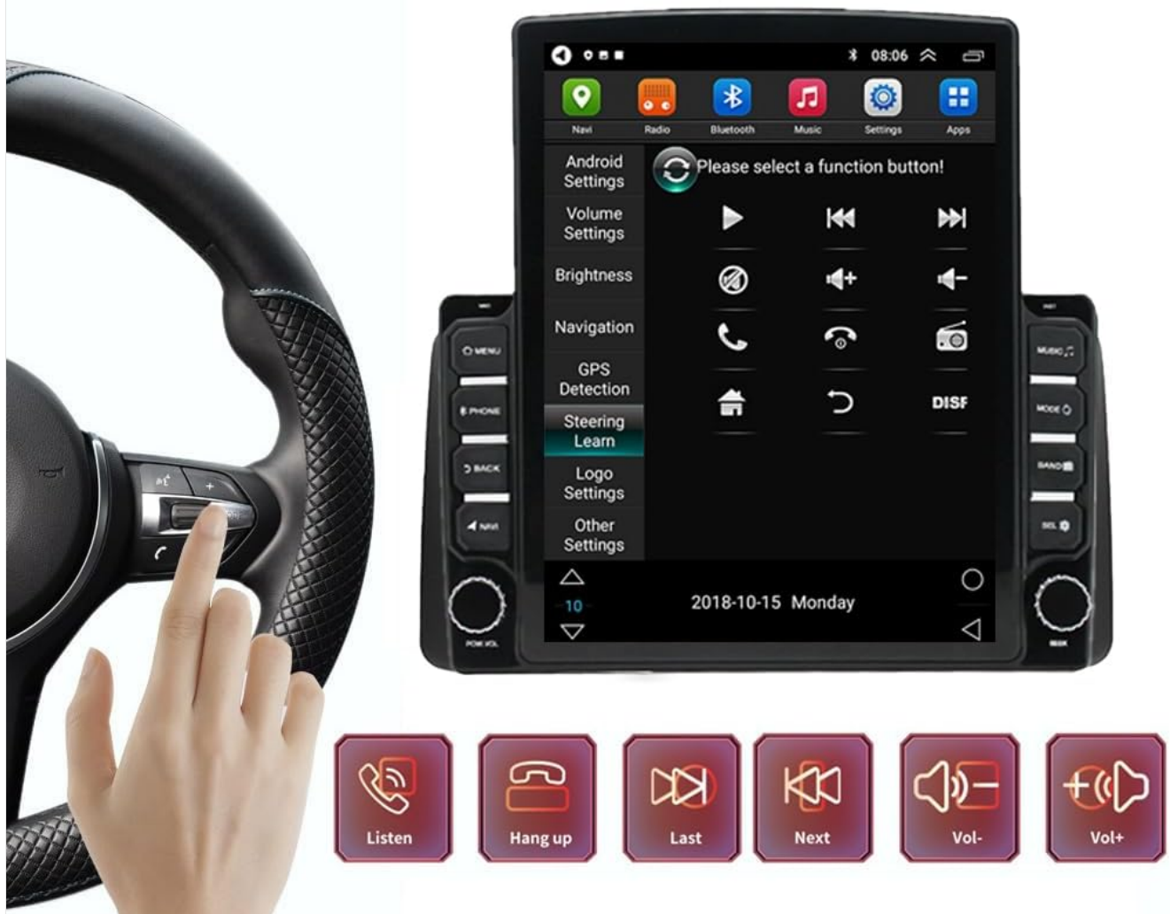
Image: The car stereo screen displaying the 'Steering Learn' interface, where users can configure the functions of their vehicle's steering wheel buttons. Icons for common controls like 'Listen', 'Hang up', 'Last', 'Next', 'Vol-', and 'Vol+' are shown.

Can Use The Original Car Steering Wheel Control