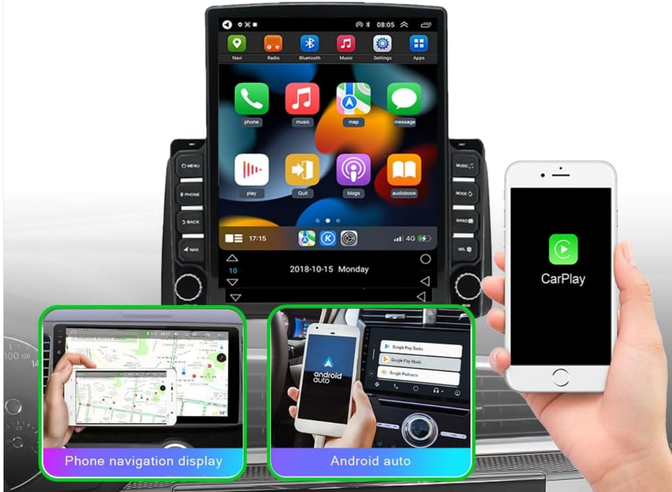
Image: The car stereo screen displaying the CarPlay interface with various app icons. Below, smaller images show a phone navigation display and the Android Auto interface on a smartphone.

Built-in TLINK application. Support wireless and wired Carplay. Support wired Android Auto. (Wired Carplay is recommended)