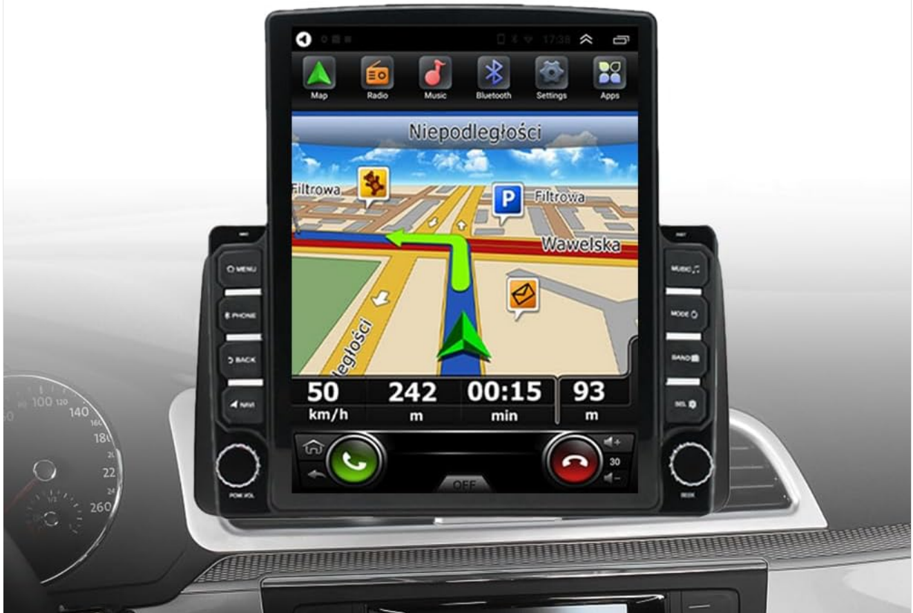
Image: The car stereo screen showing a detailed GPS navigation map with route information, current speed, and estimated time of arrival. Icons for various navigation apps like iGO, Navitel, Sygic, and Google are displayed above.