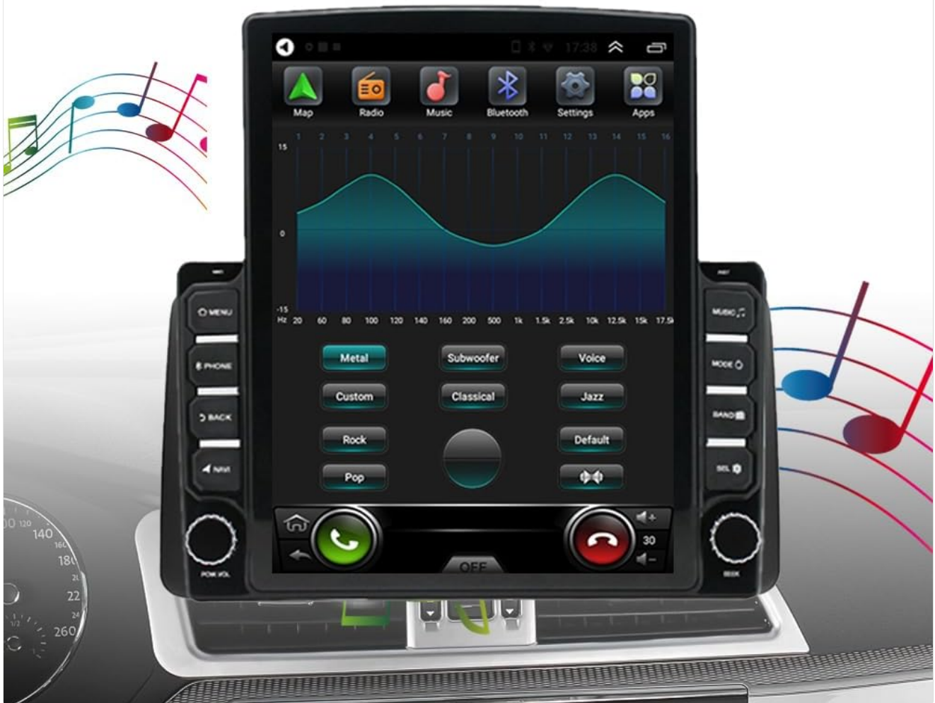
Image: The car stereo screen displaying the built-in equalizer interface, showing a 15-band frequency spectrum with adjustable sliders. Preset options like 'Metal', 'Custom', 'Classical', 'Jazz', 'Rock', 'Pop', and 'Default' are available.

Better sound brings you better journey, making the trebles smoother, the midrange richer, and the bass fuller. A variety of EQ sound effects scene selection