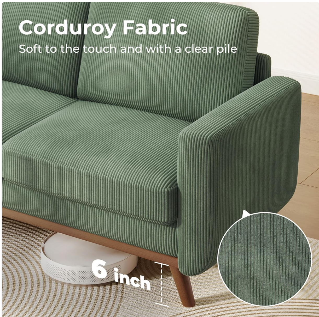
Image: Detail of the corduroy fabric texture.