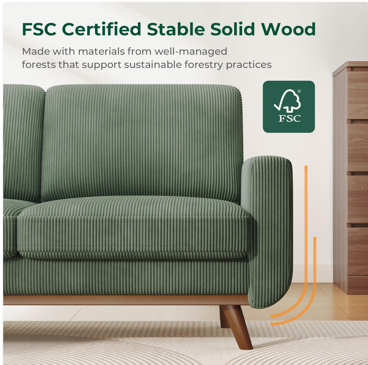
Image: Detail of the FSC Certified solid wood frame.

The loveseat sofa features an FSC Certified solid wood frame, ensuring sturdiness and durability. Non-slip protective backing on the legs provides stability and protects flooring.