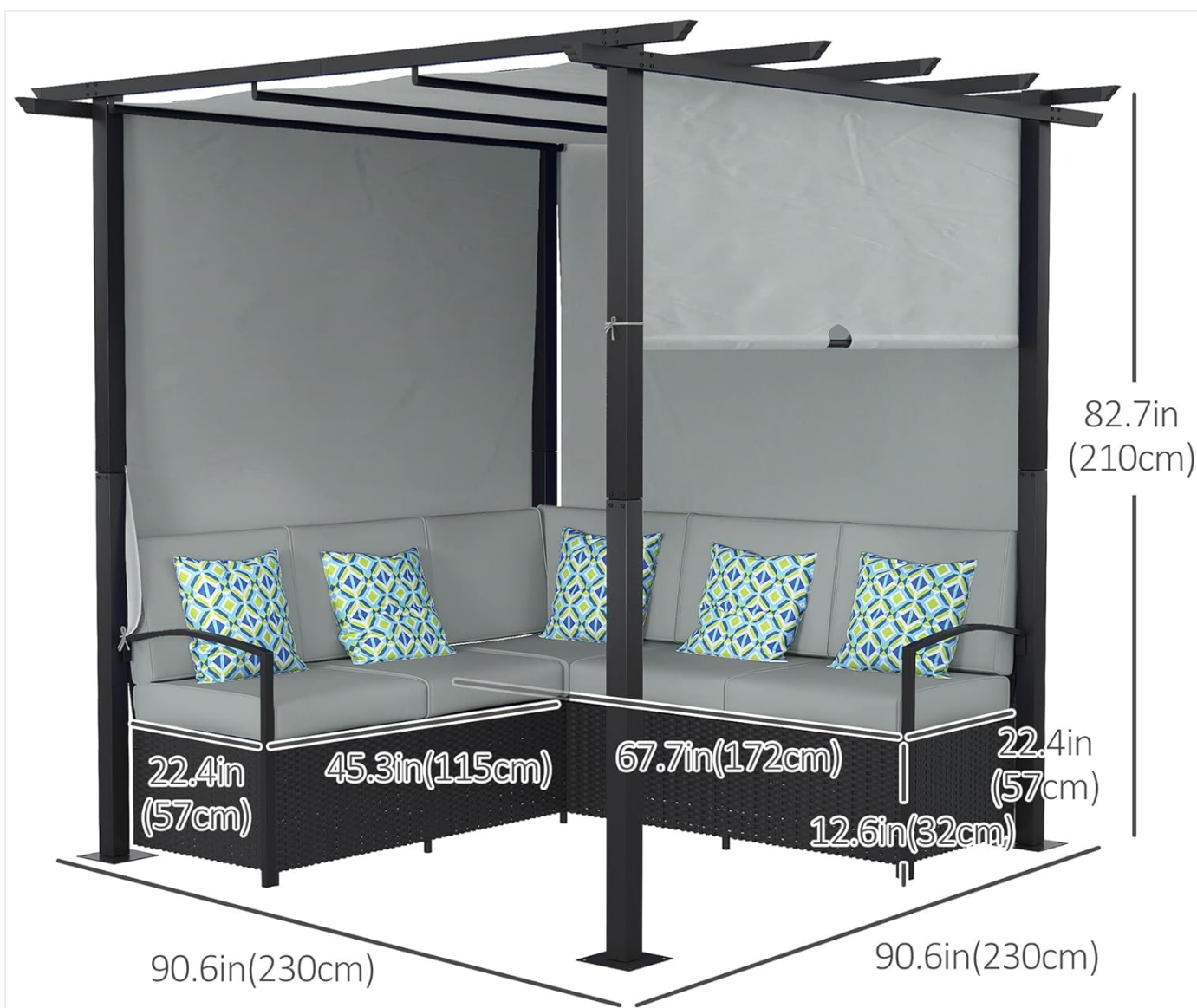
Image: Dimensional diagram of the patio furniture set, including overall height, length, and width, as well as individual sofa dimensions.