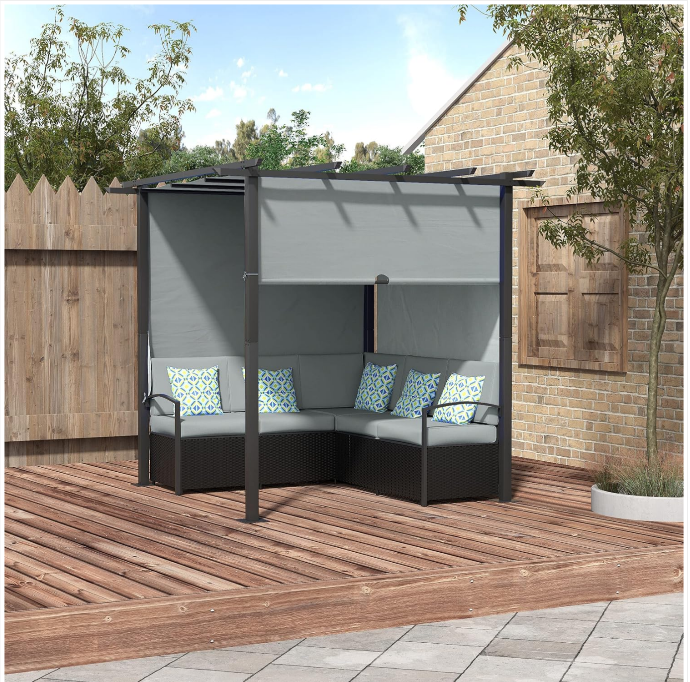
Image: The Outsunny Wicker Patio Furniture set, featuring a grey rattan base, grey cushions, and a retractable grey canopy, set on a wooden deck.