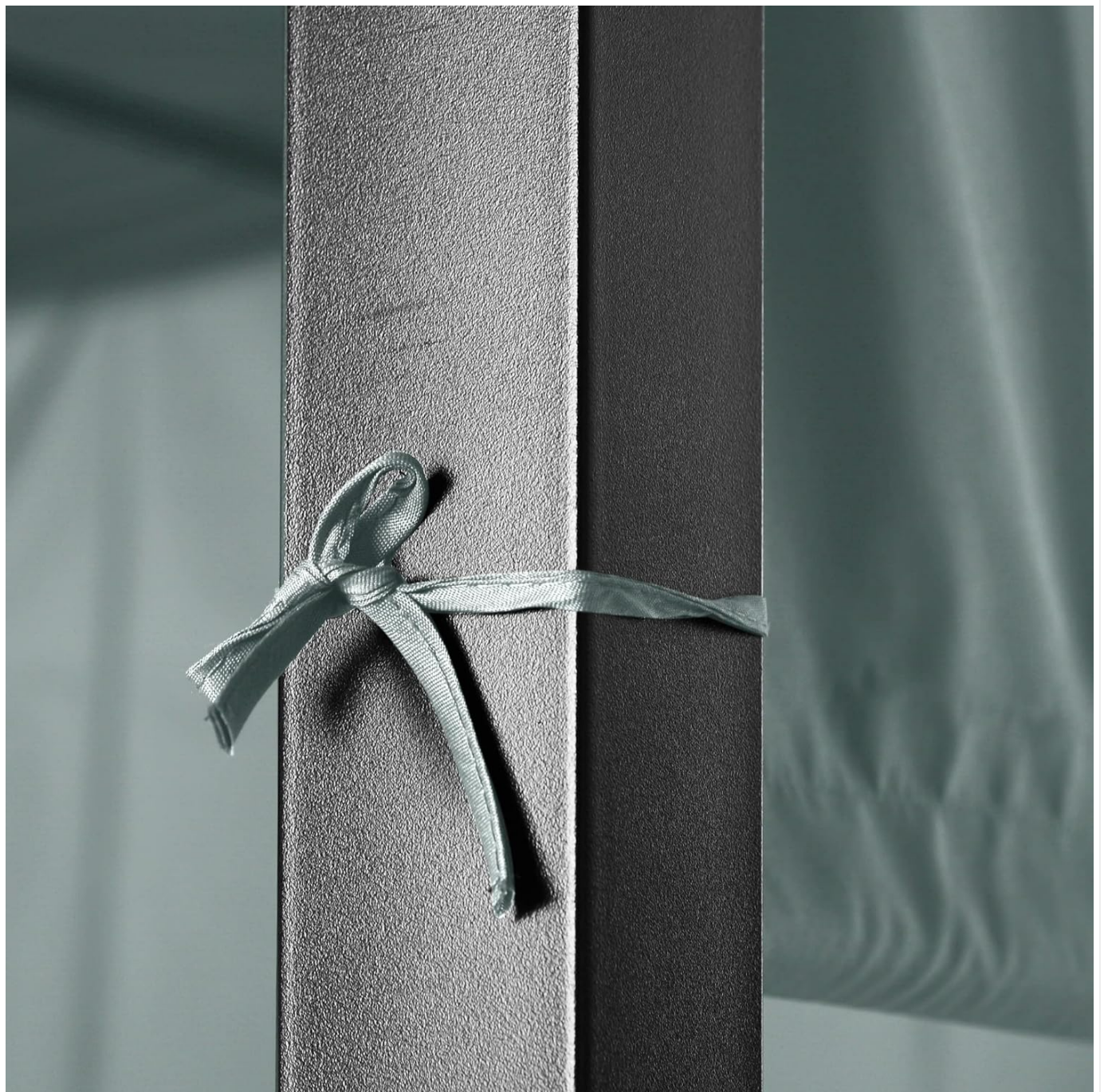
Image: Detail of the tie-back mechanism used to secure the canopy in a retracted position.