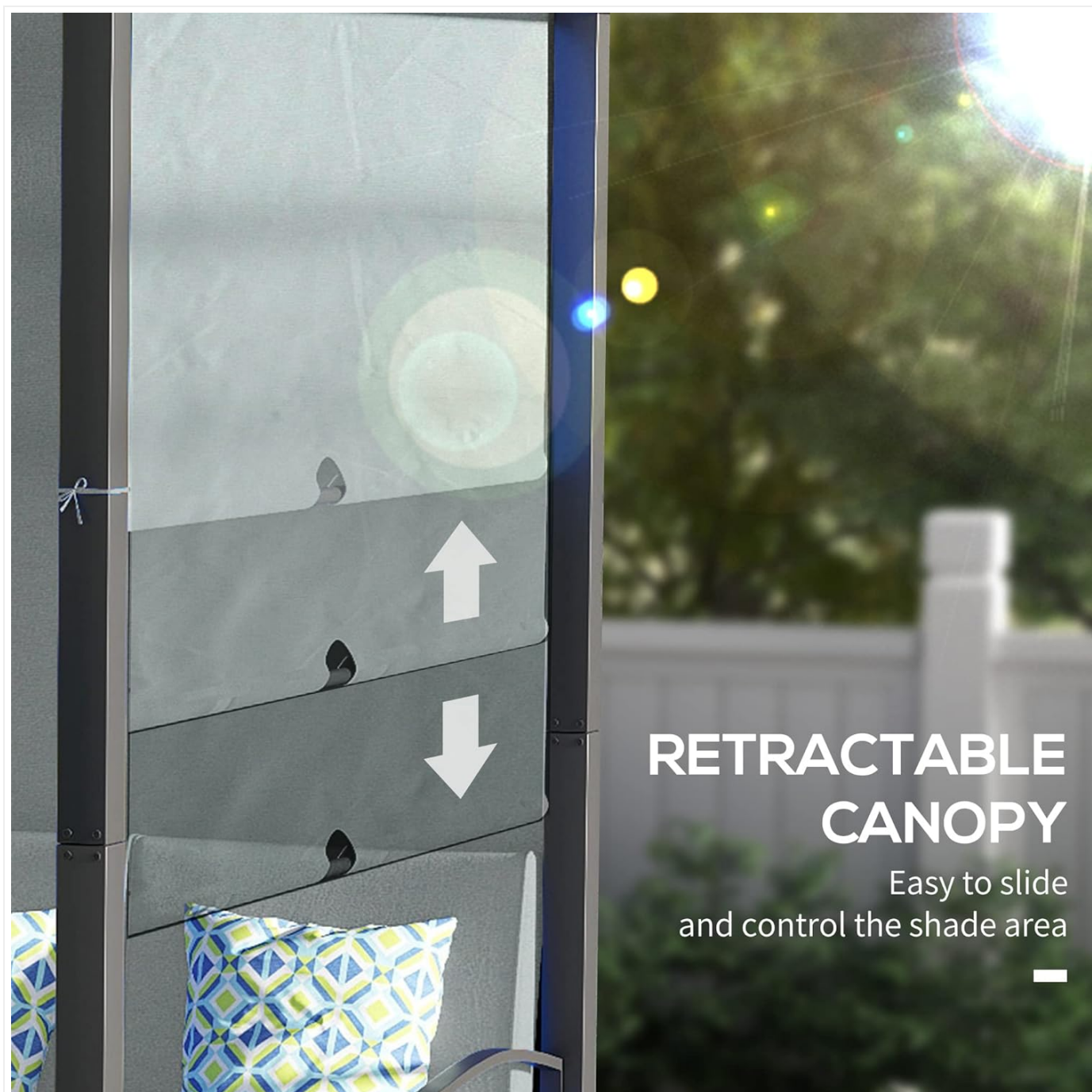
Image: Visual representation of the retractable canopy, demonstrating how to slide and control the shade area.