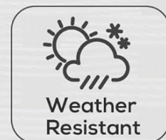
Image: Detail of the PE rattan wicker construction, highlighting its hand-woven, UV resistant, durable, and weather resistant properties.