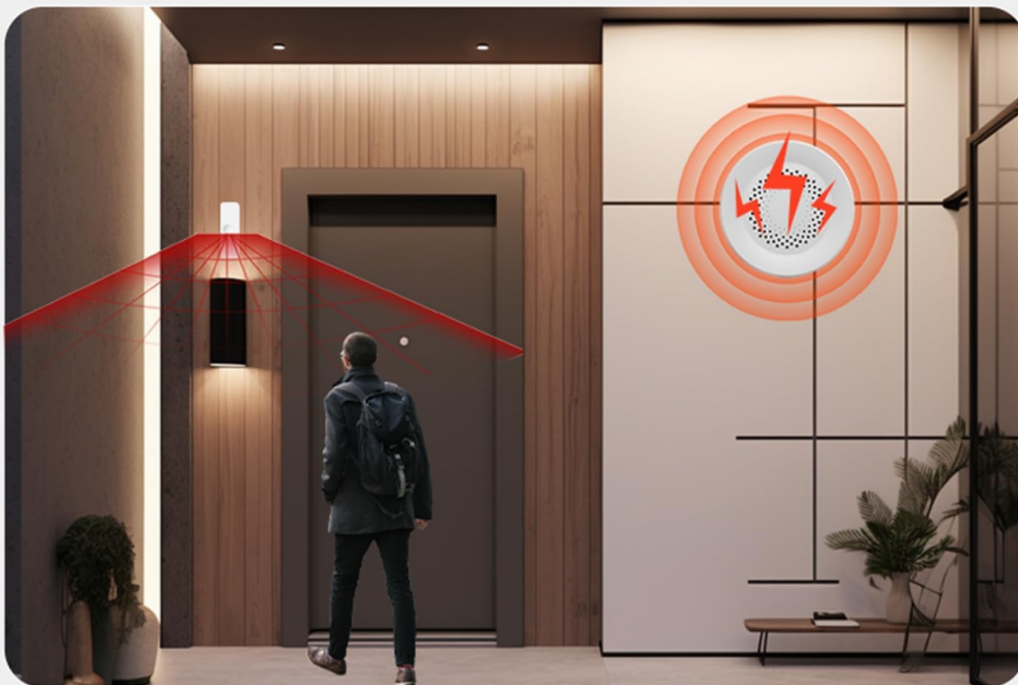
Diagram illustrating smart linkage, where a PIR motion sensor detects movement and triggers the siren alarm.

When the PIR motion sensor detects someone is passing by, the alarm sound will be heard, you will receive the alert message on your mobile.