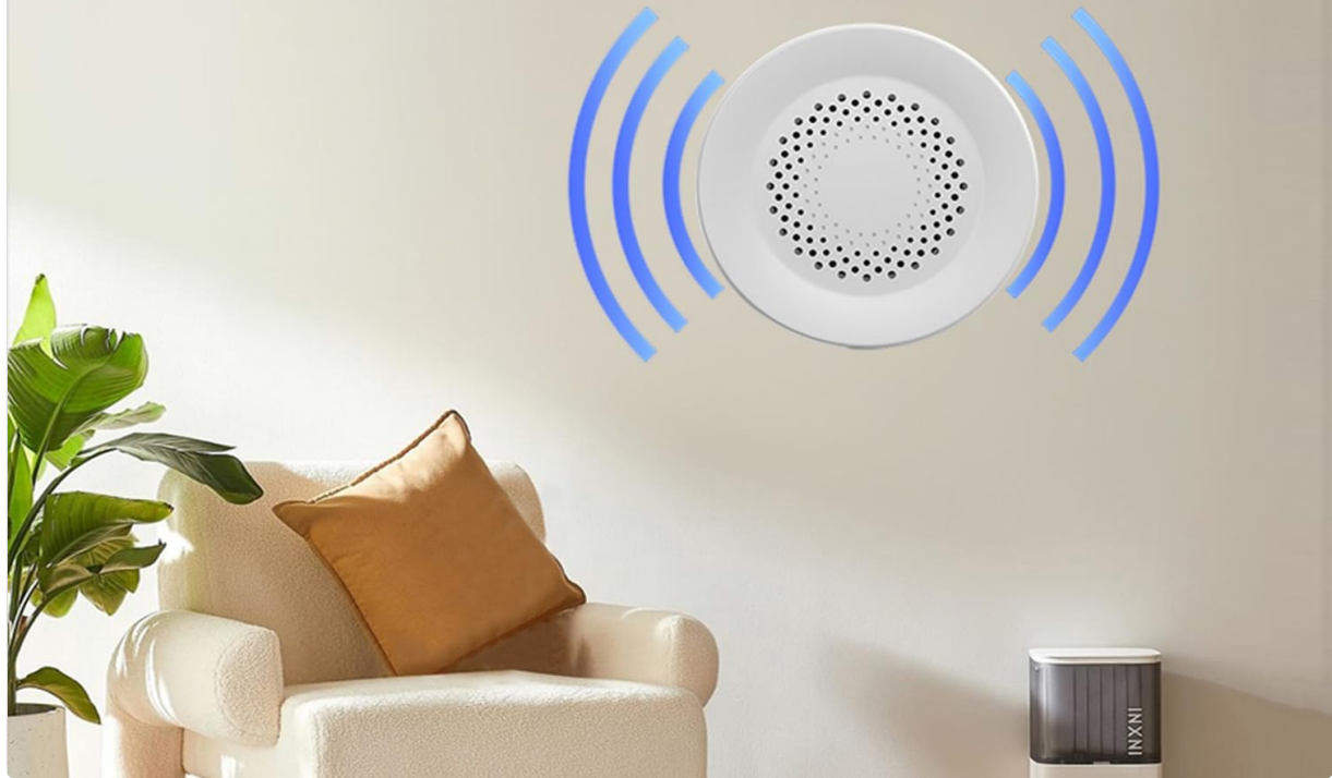
Illustration showing the siren alarm emitting sound waves, highlighting its 100dB loudness and 32 selectable tones.

You can select the alarm sound from 32 ringtones in the App according to your personal preference.