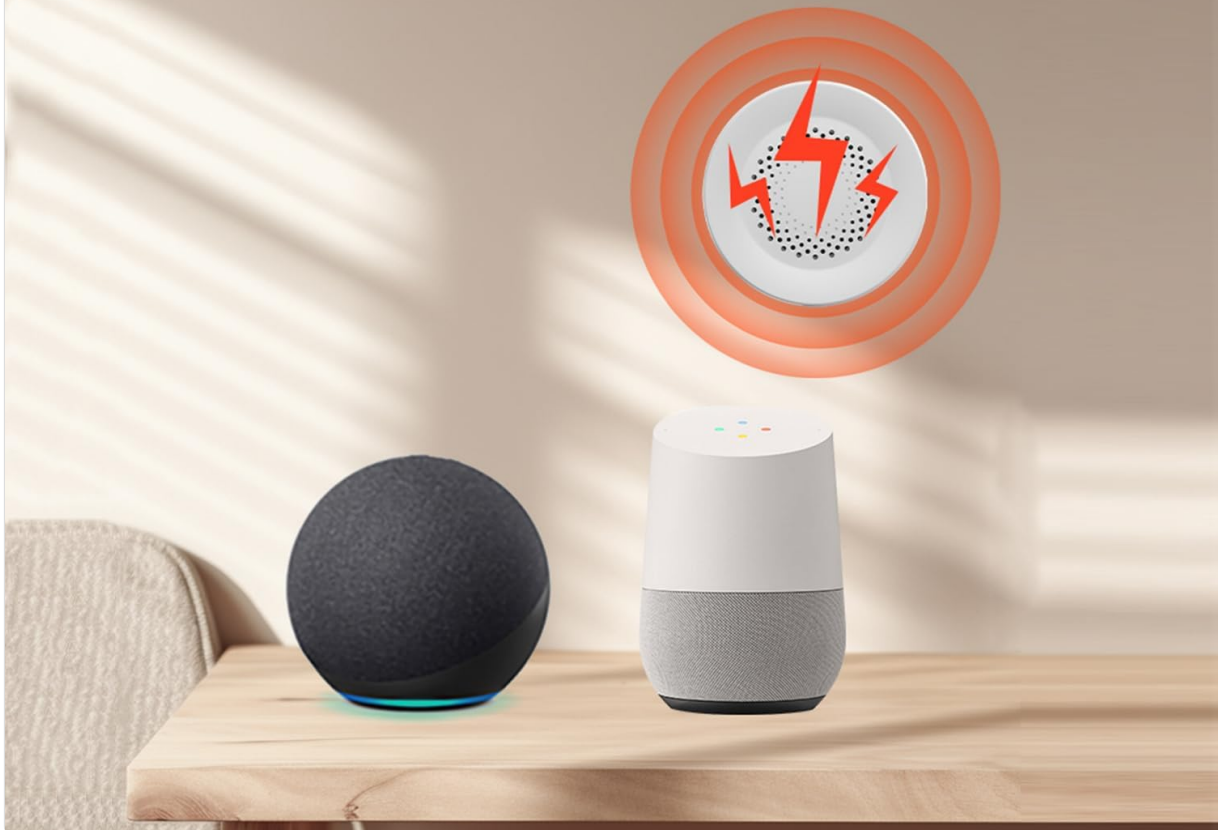
Image showing the siren alarm alongside an Amazon Echo Dot and Google Home speaker, indicating voice assistant compatibility.

Link the siren alarm with your home monitoring systems via alexa or google speaker.