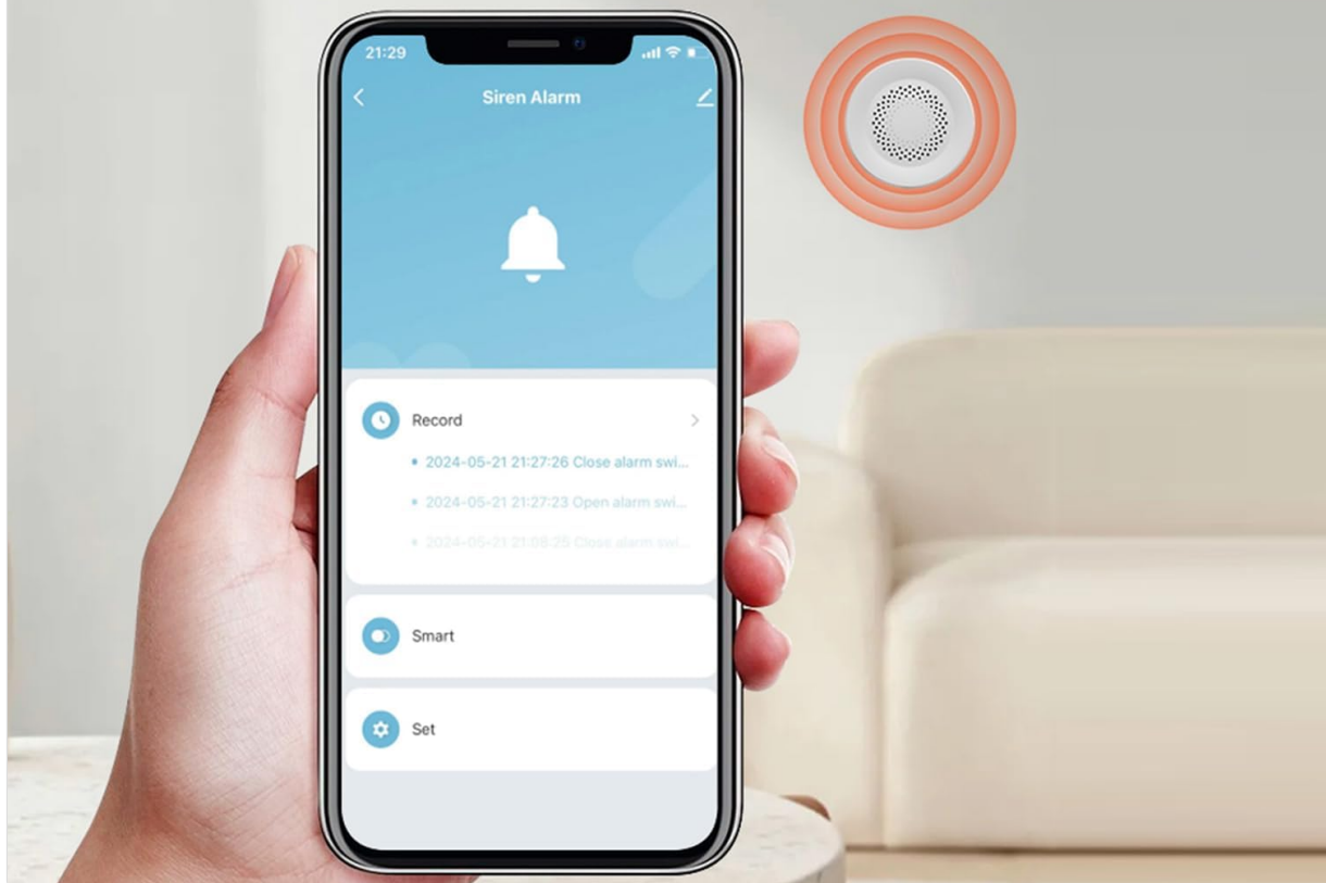
Screenshot of the Tuya Smart app interface, demonstrating options to adjust alarm volume and duration.

You can select alarm volume and alarm time in the Set depending on your usage demands.