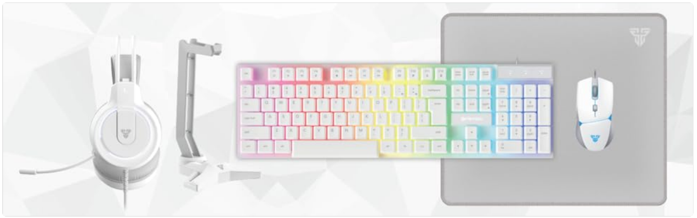
Image: All components of the FANTECH P51SW 5-in-1 Gaming Combo, including the keyboard, mouse, headset, headset stand, and mouse pad.