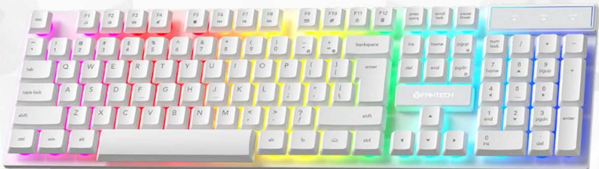
Image: The FANTECH Shikari K515 Gaming Keyboard with rainbow LED backlighting.

With Shikari K515 gaming keyboard, gamers can easily use all of their fingers without key conflicts, to easily access all of their favorite in-game commands.