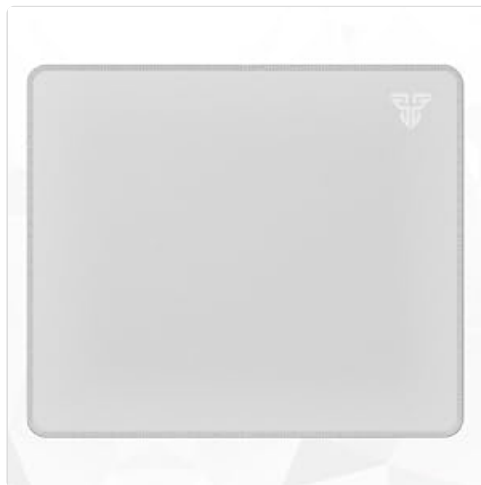
Image: The FANTECH Vigil MP356 Gaming Mouse Pad with its textured surface.