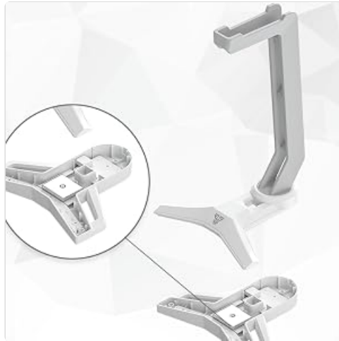
Image: Detailed view of the FANTECH Tower II AC304 Headset Stand components and assembly points.