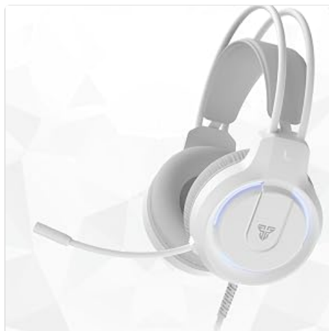
Image: The FANTECH Flash HQ53 Gaming Headset with its microphone and RGB lighting.