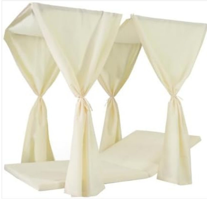
Image: Cushions and curtains, typically included components.