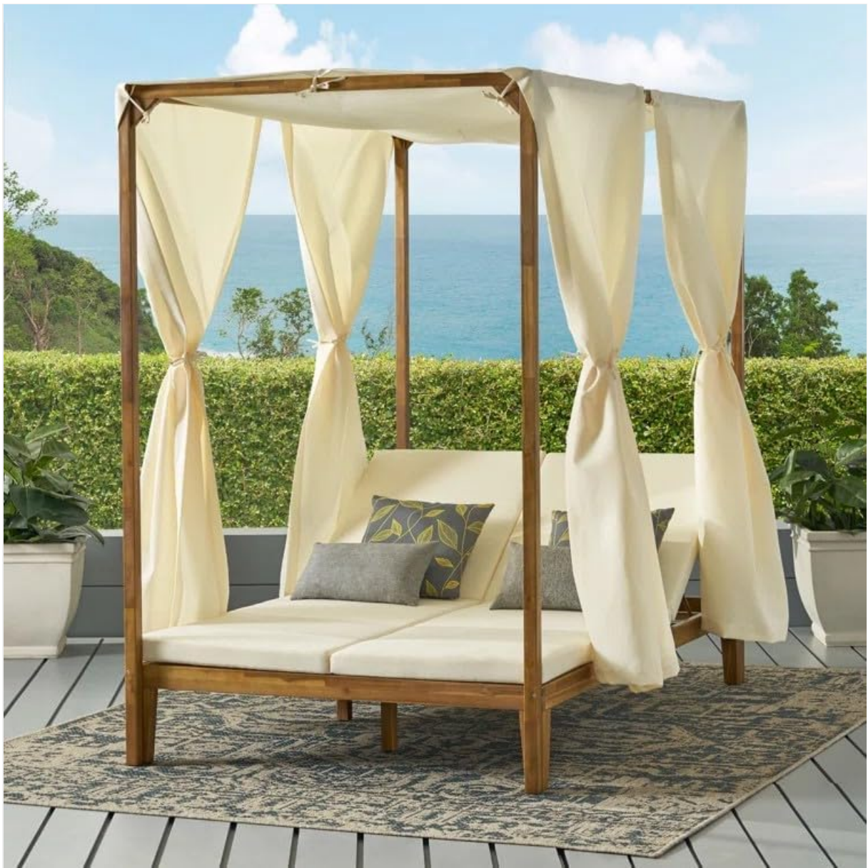
Image: Fully assembled Merax Outdoor Daybed Patio Chaise Lounge with cream cushions and curtains.