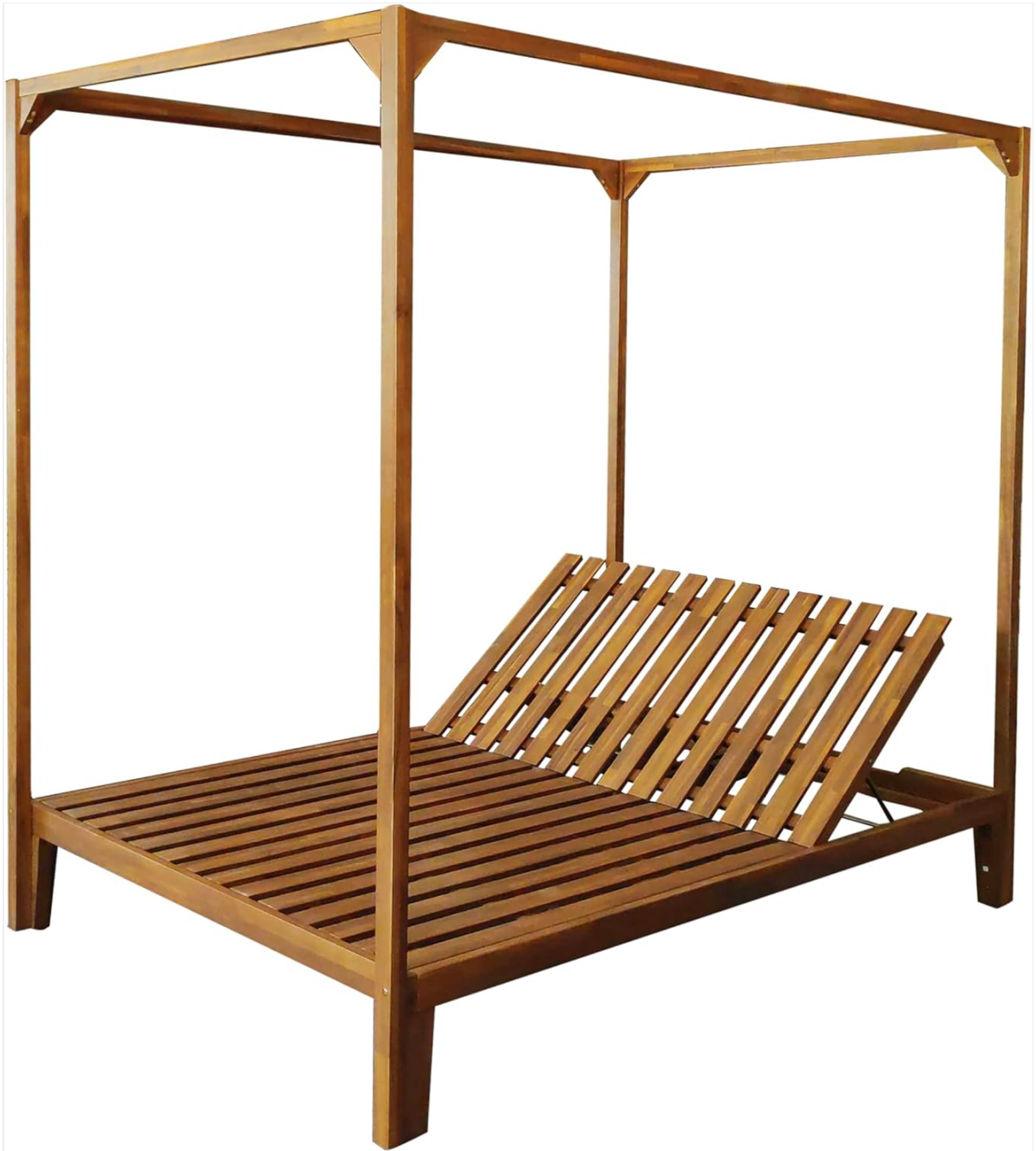
Image: The acacia wood frame structure, showing the slatted base and upright posts.