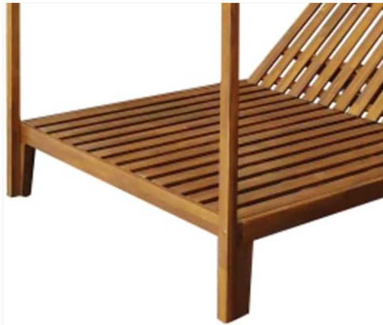
Image: Corner joint of the acacia wood frame, illustrating structural integrity.

Place the thick cushions onto the assembled frame. Secure the overhead curtains to the top frame posts. The curtains can be tied back or left down for privacy and shade.