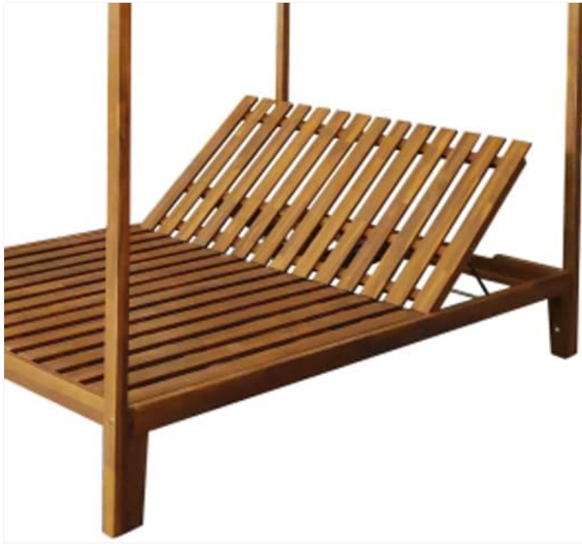
Image: Detail of the adjustable wooden slat mechanism for the chaise lounge backrest.