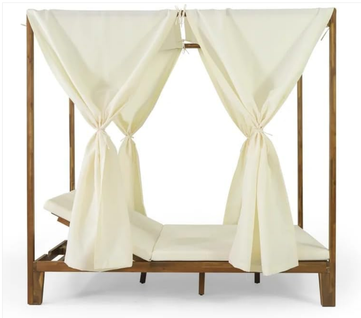
Image: Daybed showing one seat in an adjusted, upright position and curtains tied back.

The water-resistant overhead curtains provide shade and privacy. They can be untied and extended to cover the sides of the daybed or tied back to the posts using the attached ties for an open feel.