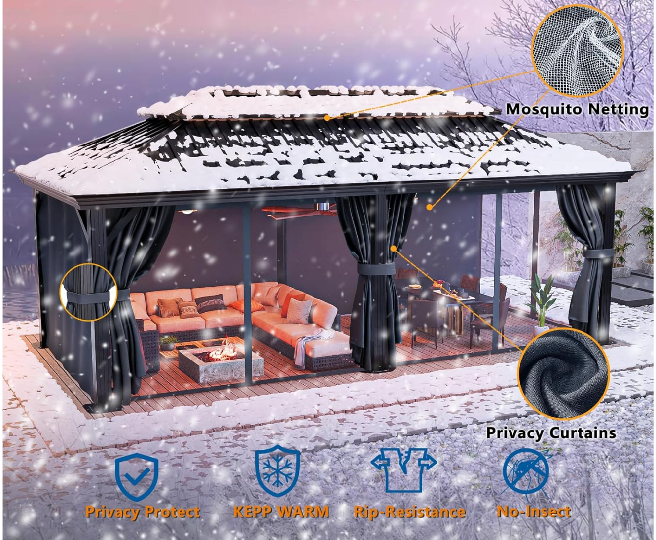
Image 5.1: Double track system for curtains and netting, offering privacy and insect protection.

allows curtains and netting to hang and slide at the same time