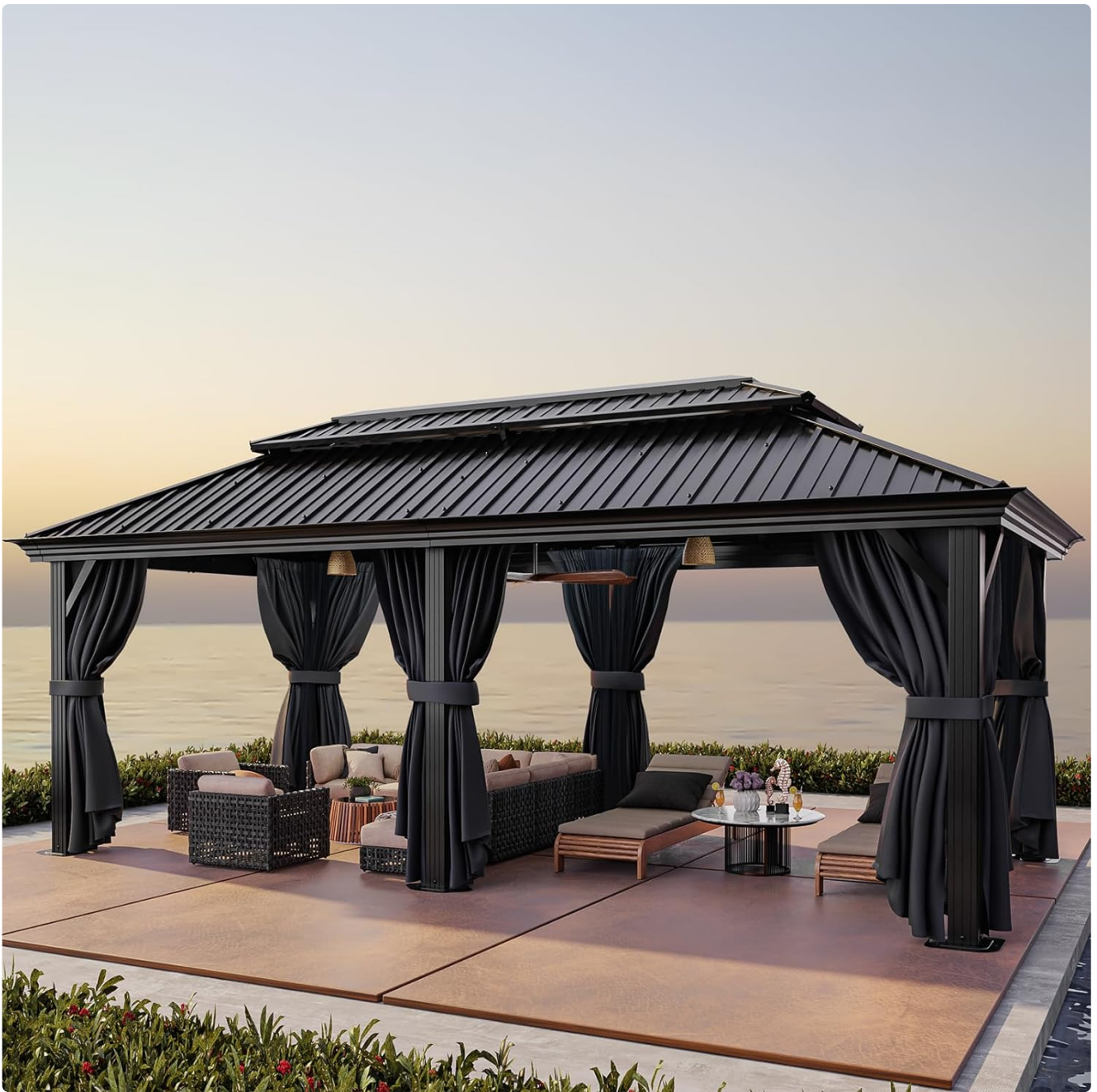
Image 1.1: The HOTEEL 12x20 Hardtop Gazebo set up in an outdoor environment.