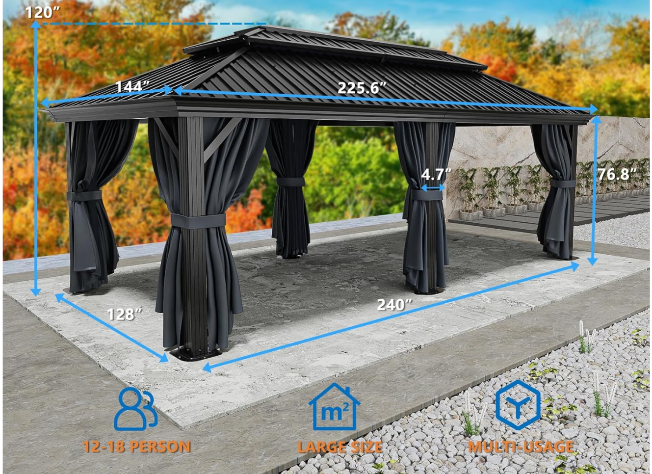
Image 4.1: Item dimension information for planning your setup space.