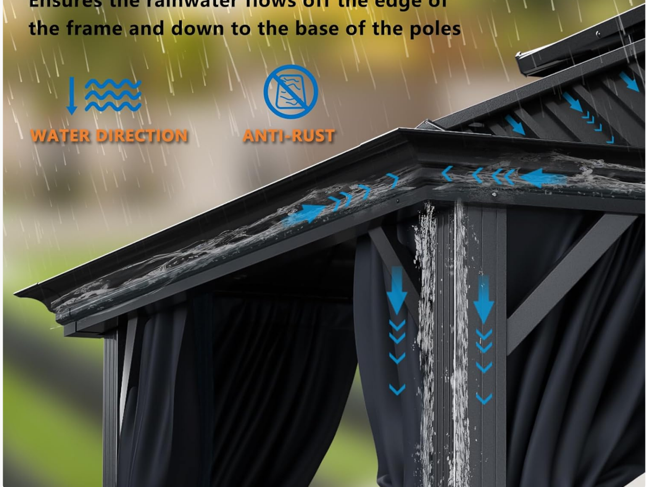
Image 6.1: The galvanized steel roof design, emphasizing ventilation and durability.