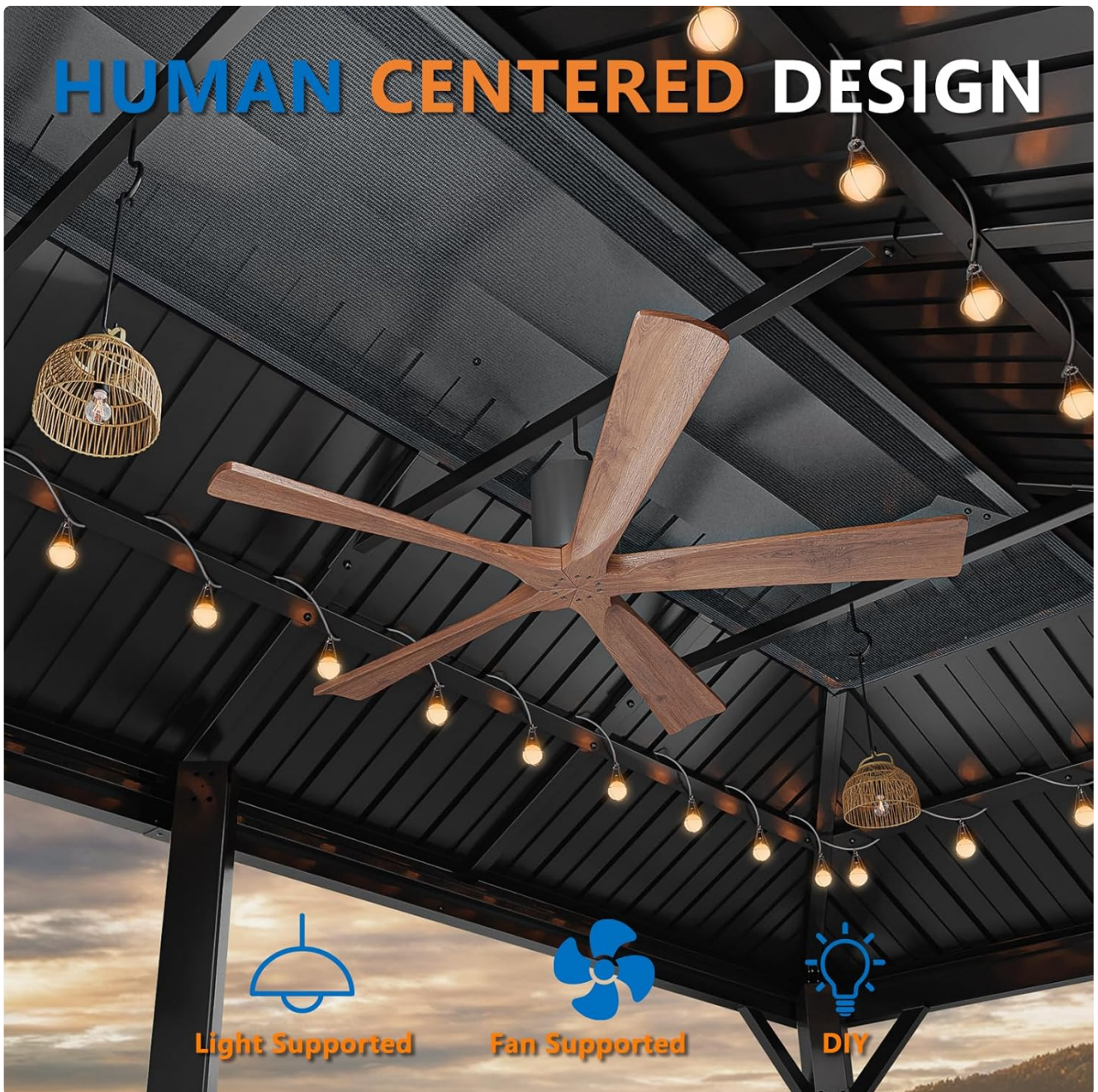
Image 5.2: Interior view highlighting light and fan support features.