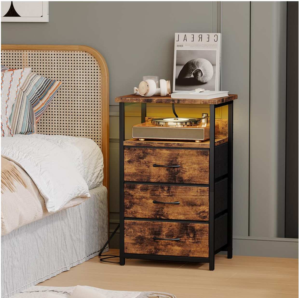
The Fixwal Night Stand, fully assembled and illuminated.