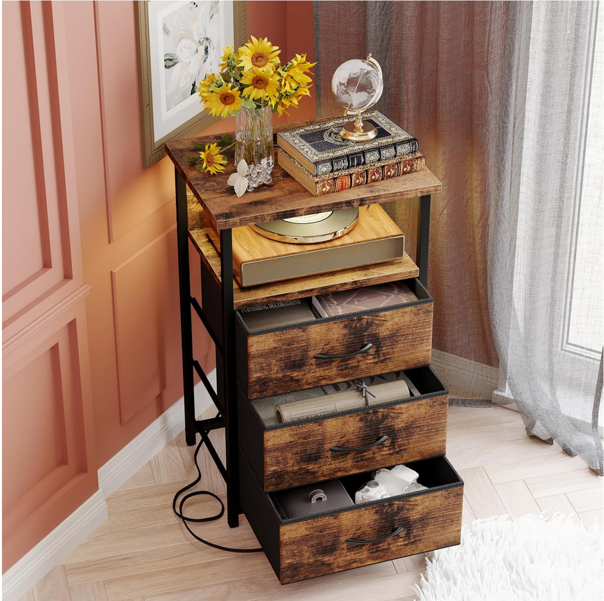
Spacious fabric drawers for organized storage.