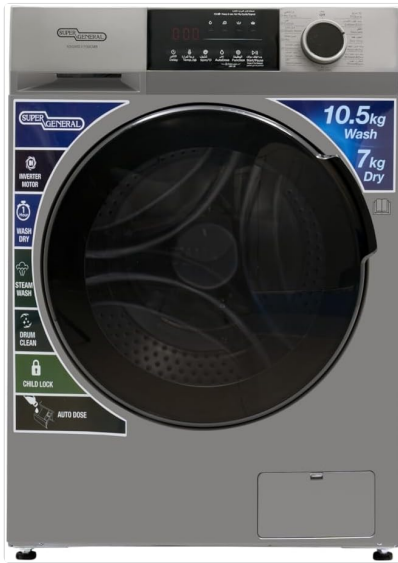
Figure 2.1: Front view of the washer dryer. This image shows the main control panel, detergent dispenser, and the front-loading door.