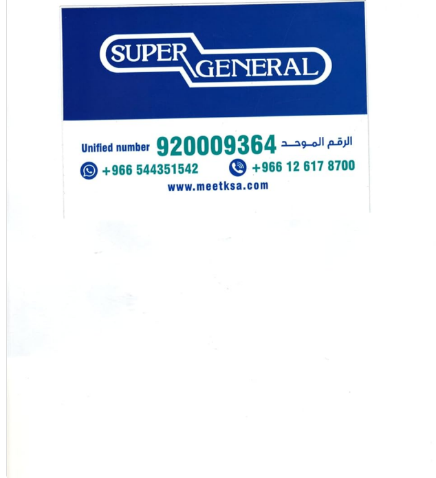
Figure 8.1: Super General Service Center Contact Information.