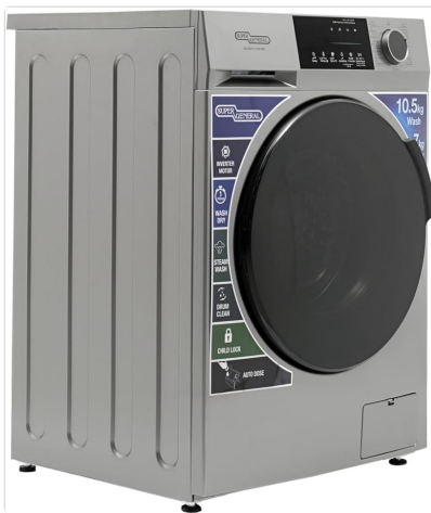
Figure 2.2: Side view of the washer dryer, illustrating its compact design.