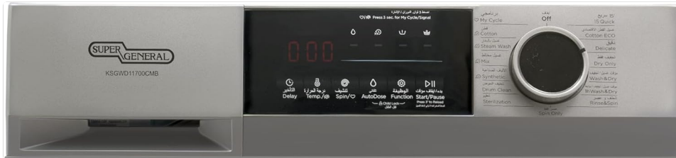
Figure 4.1: Detailed view of the control panel with program dial and function buttons.

The control panel allows you to select wash programs and customize settings. Refer to the control panel image below for button and dial locations.