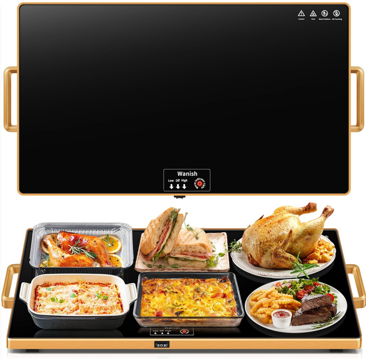
Image 1: The Wanish Electric Warming Tray (XXL 32"x18") keeping multiple dishes warm.