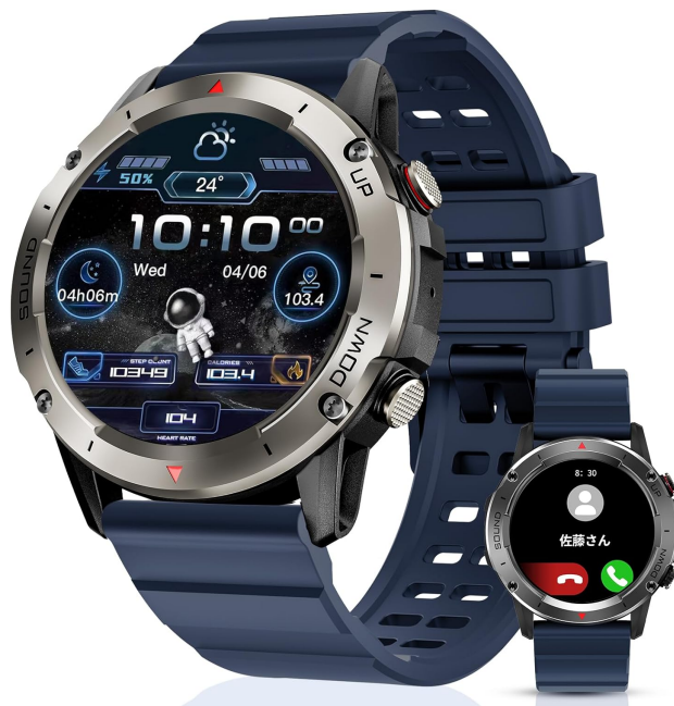
Figure 1.1: iKanzi Smartwatch, showcasing its sleek design and vibrant display.

This manual provides detailed instructions for the iKanzi Smartwatch, Model NX9. It covers setup, operation, maintenance, and troubleshooting to ensure optimal performance and user experience. Please read this manual thoroughly before using your smartwatch.