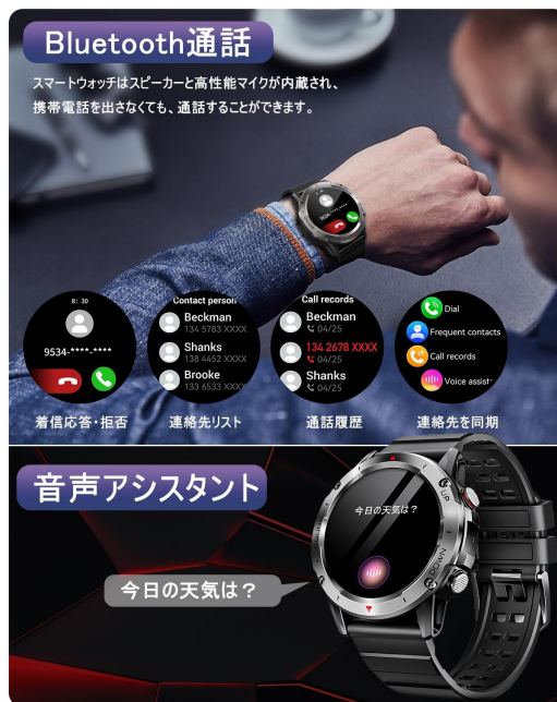
Figure 2.1: Visual guide for Bluetooth pairing and call features.