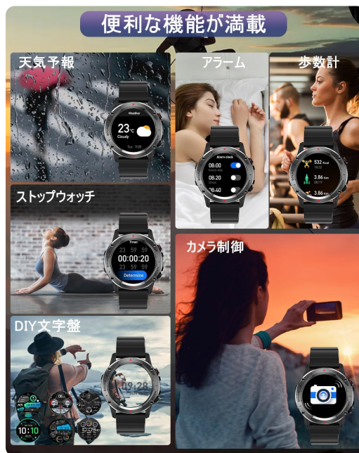
Figure 3.3: Features including music control, camera remote, and IP68 rating.