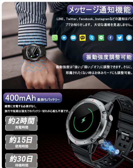
Figure 3.1: Message notification display and vibration settings.