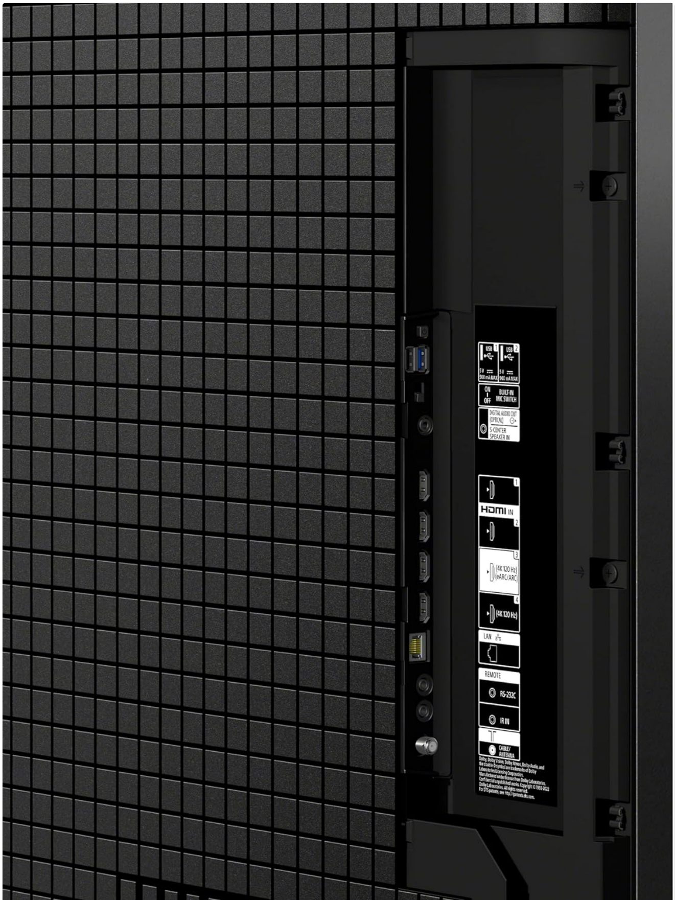
Image: Rear view of the Sony K65XR90 TV, highlighting the input ports and VESA mounting points for wall installation.