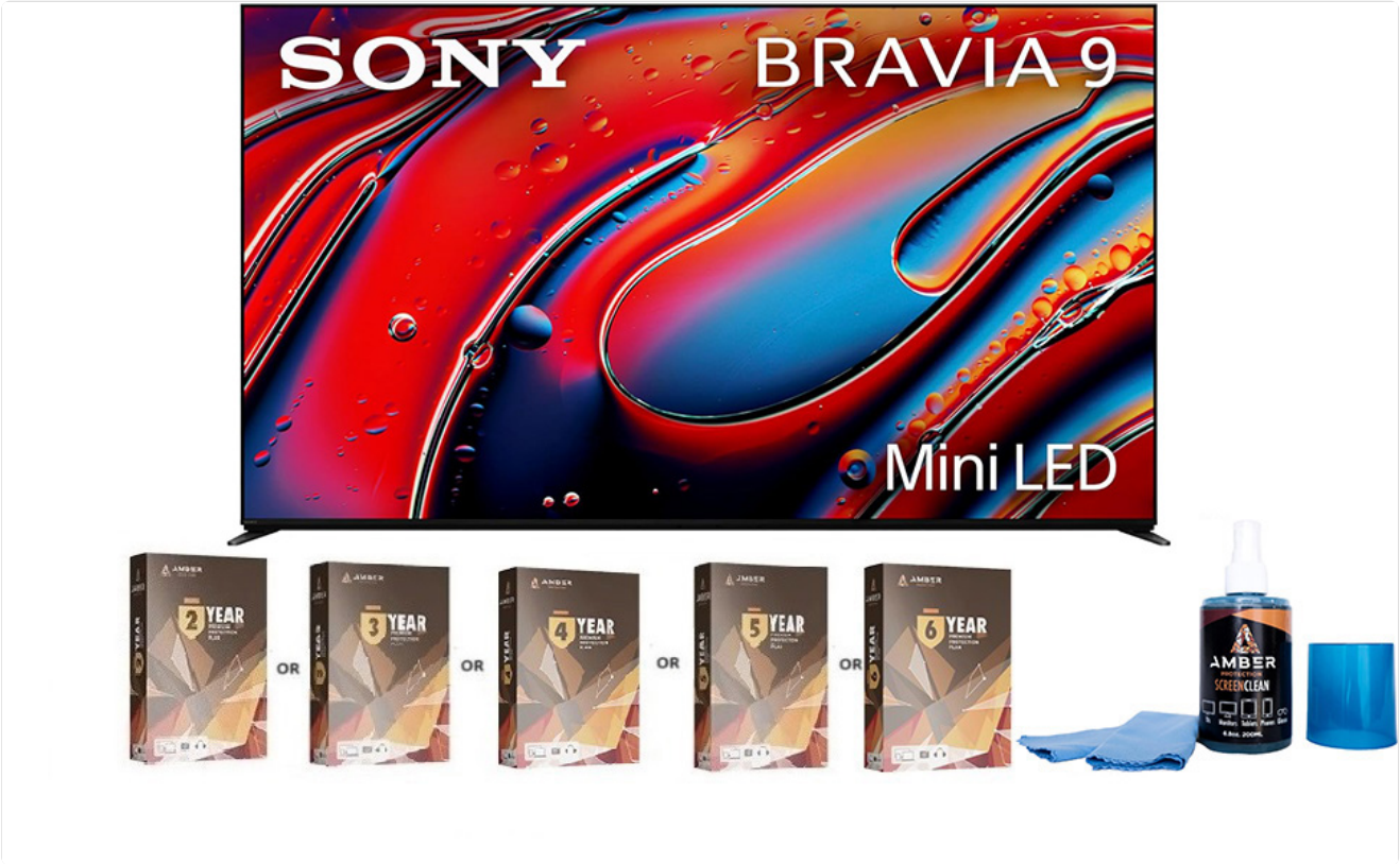
Image: Details of the Amber Protection Plan, outlining features like mechanical & electrical failure coverage, power surge protection, and 24/7 customer support.

This plan begins from the date of purchase and includes 24/7/365 customer support. For support, please refer to the contact information provided with your Amber Protection Plan documentation or visit the official Sony support website.