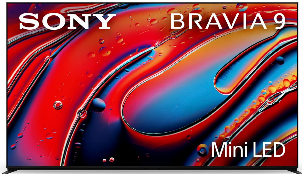
Image: Front view of the Sony K65XR90 TV with its stand attached, ready for placement.