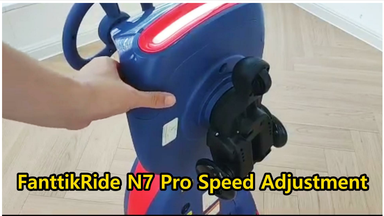
Figure 4.1: Location of the speed control button.

Video 4.1: FanttikRide N7 Classic 6V Speed Adjustment. This video demonstrates how to change between the two available speeds.