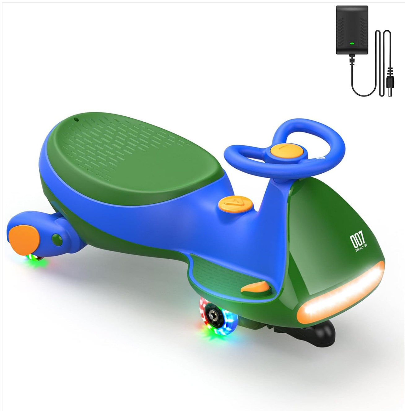
Figure 2.1: FanttikRide N7 Classic Electric Wiggle Car (Green model shown).