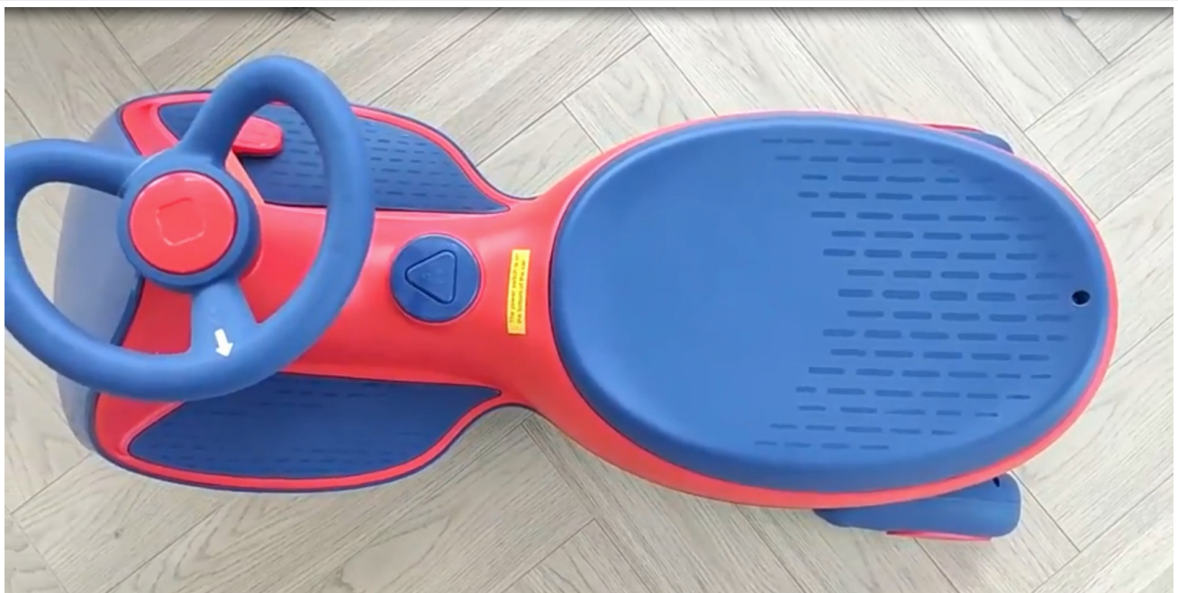
Figure 3.1: Visual guide for battery installation and key controls.

Video 3.1: FanttikRide N7 Battery Installation Guide. This video demonstrates how to access the battery compartment, connect the battery, and secure it properly.