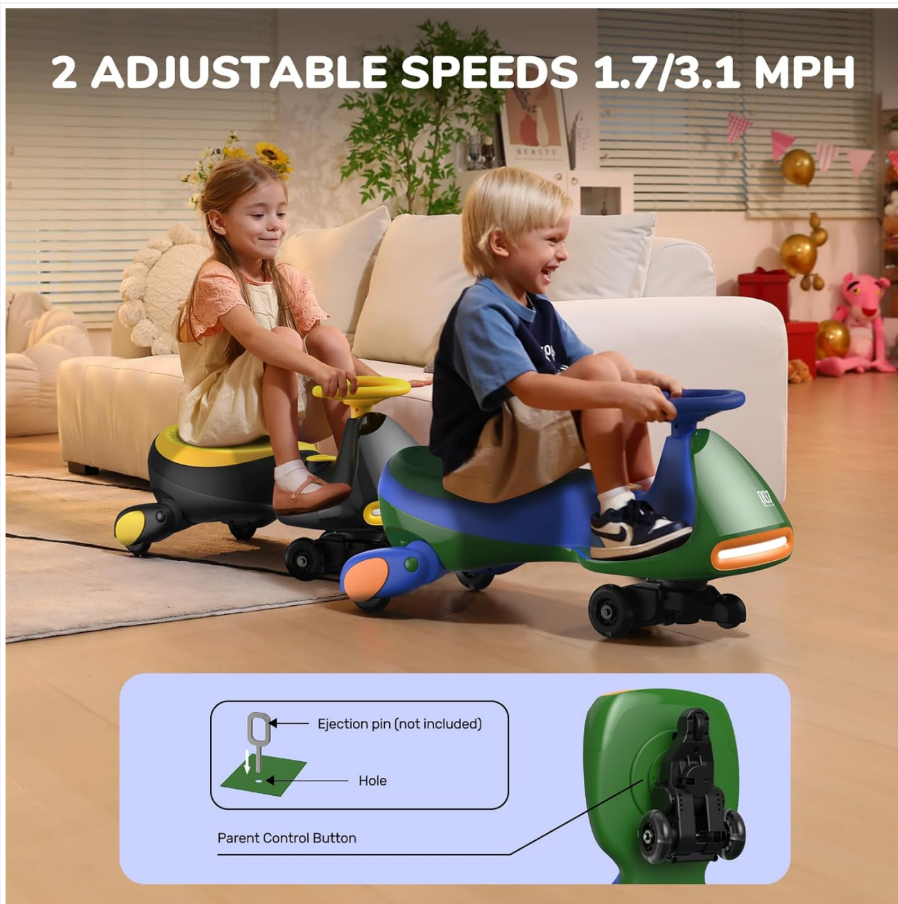
Figure 4.2: The wiggler car's Bluetooth and flashing wheel features in use.