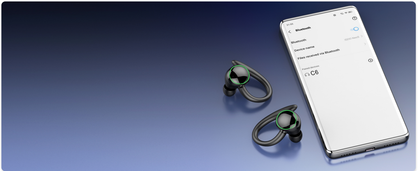
Image: Visual showing the earbuds compatible with various devices including smartphones, tablets, and laptops, supporting iOS, Android, and Windows systems.