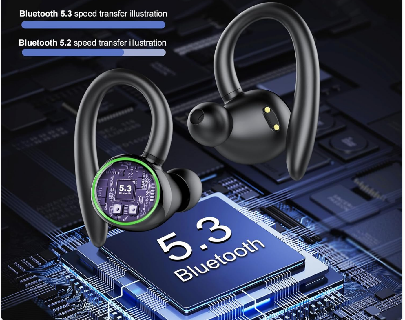
Image: Diagram illustrating the advanced Bluetooth 5.3 chip, emphasizing stable connection and independent usage of left and right earbuds.