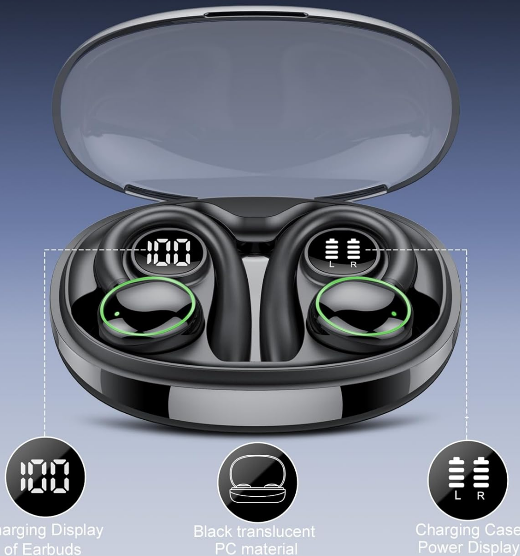
Image: Close-up of the charging case with its semi-transparent lid, highlighting the dual LED digital display for earbud and case battery levels.

Easy and convenient to know the remaining power