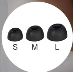
3 Size Eartips(S/M/L)