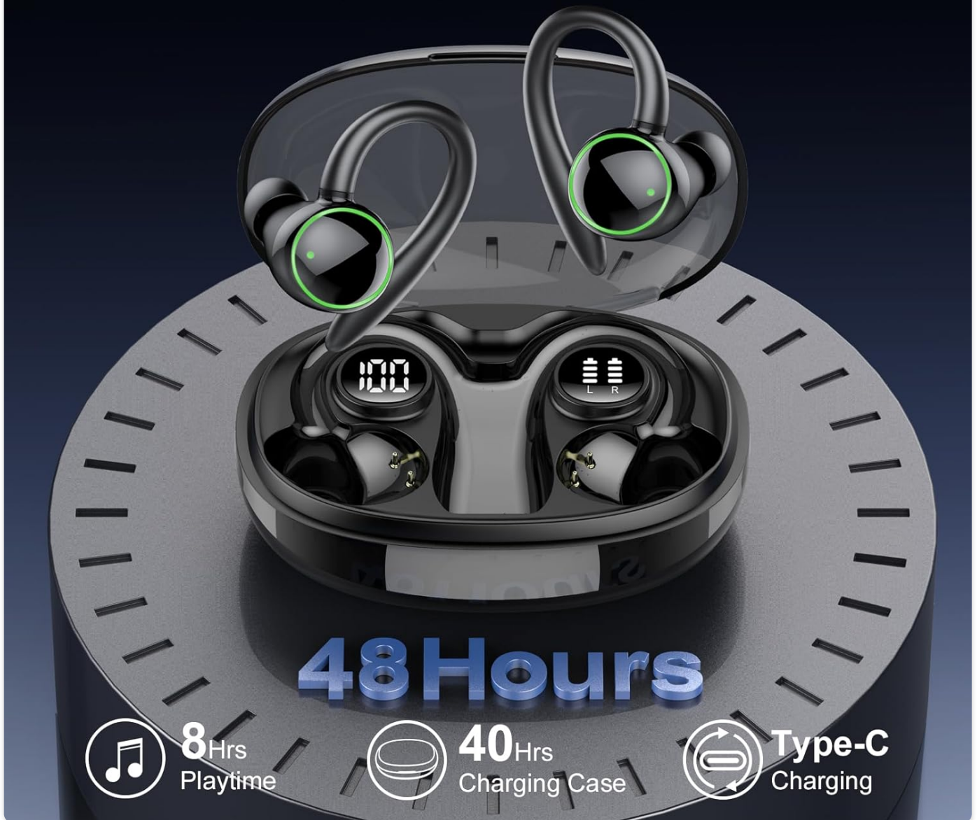
Image: Illustration showing the earbuds in the charging case with the "48 Hours" battery life indicator and Type-C charging port.

Experience an all-day immersion in the music world with extended battery capacity for extended playtime.