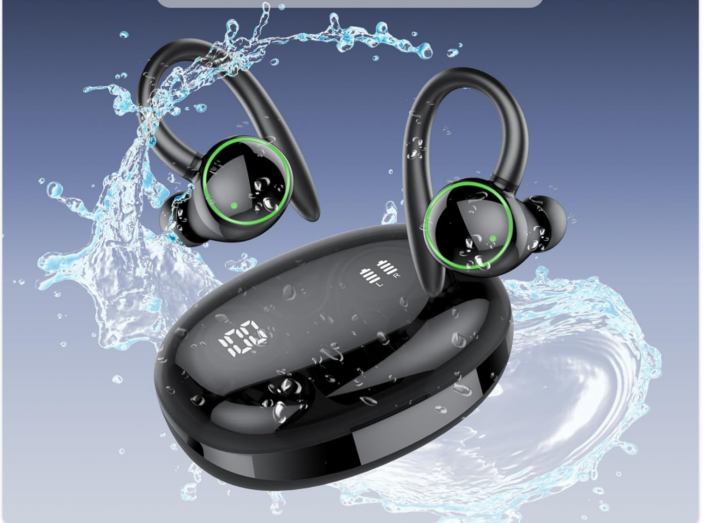
Image: Illustration showing the earbuds being resistant to rain, sweat, and splashes, highlighting their IP7 waterproof rating.