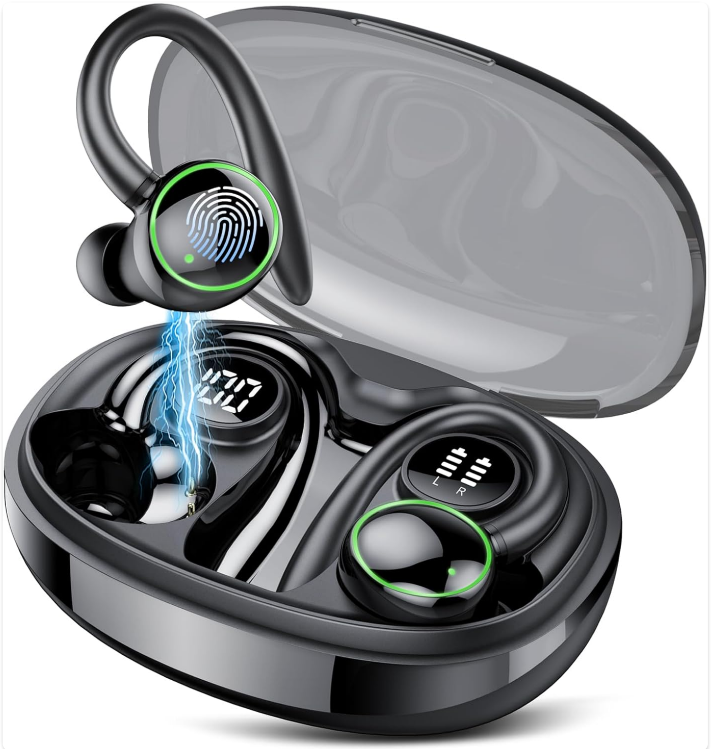
Image: PEFUPEW Wireless Earbuds in their charging case, showcasing the sleek black design and LED display.