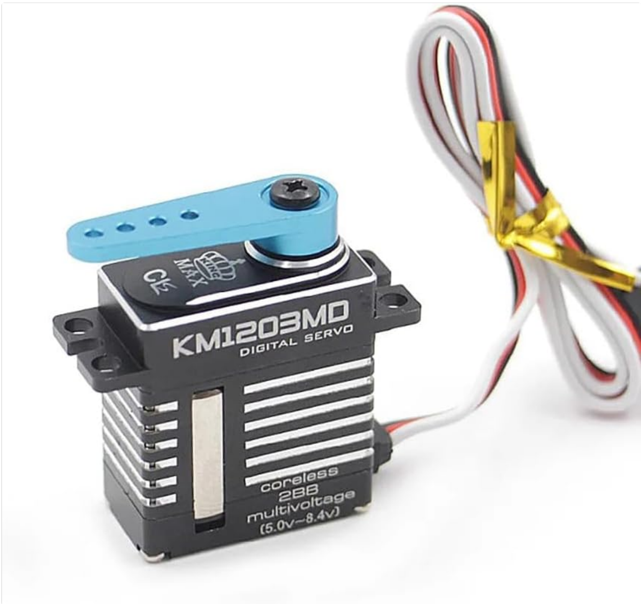
Image 1.1: The SPARKHOBBY KINGMAX KM1203MD Mini Digital Servo with its metal arm.