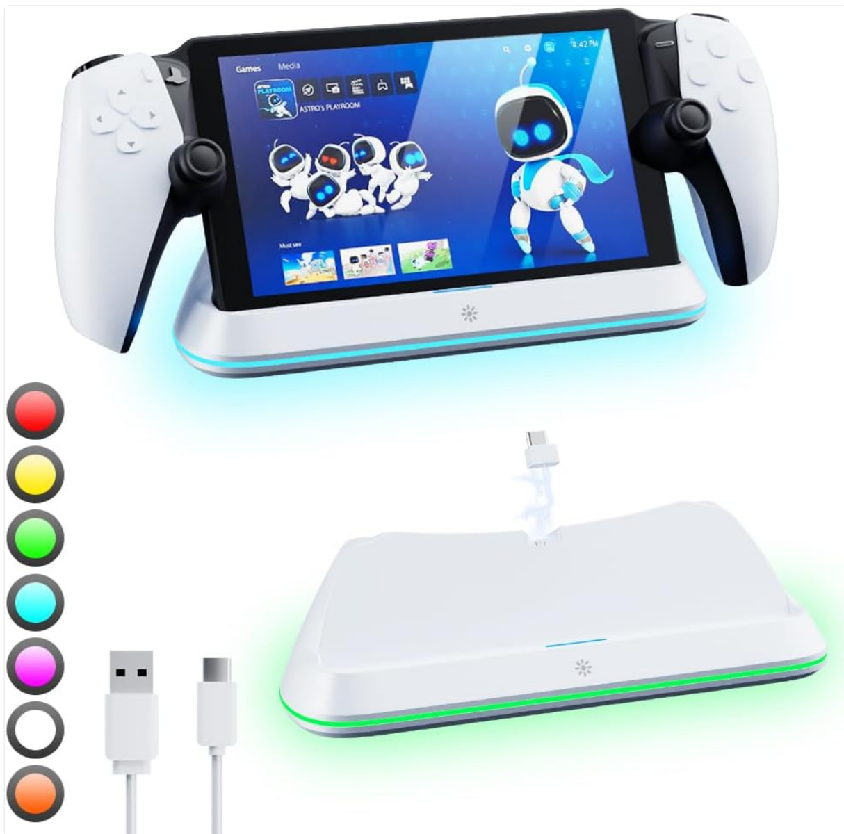
Image 1.1: HONCAM Charging Stand with PlayStation Portal connected.

This image displays the white HONCAM Charging Stand with a PlayStation Portal securely docked and charging. The stand features an illuminated base, indicating its RGB light capabilities. A USB-C cable and magnetic adapter are also shown, highlighting the product's components.