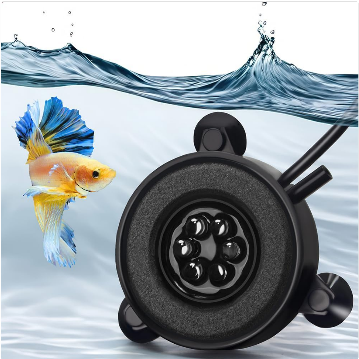
Image: The DaToo 2-inch Aquarium LED Air Bubble Stone Disk, a compact device for aeration and lighting.