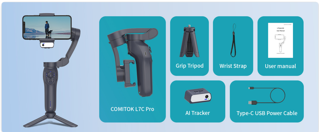
Figure 2: Contents of the COMITOK L7C Pro Kit.