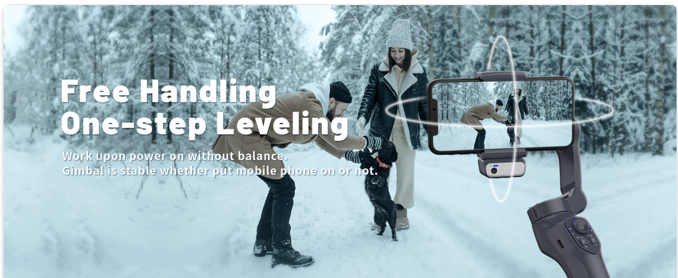
Figure 3: Quick and easy phone installation without manual leveling.

Clip your phone securely into the center of the gimbal's phone holder. The gimbal is designed for quick start with no leveling required. Press and hold the power button for one second to turn the gimbal on/off.