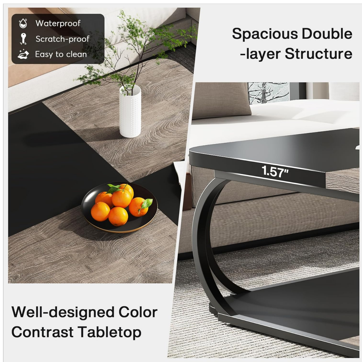
Image: Key features of the tabletop including durability and ease of cleaning.

Official Tribesigns 2-Tier Square Coffee Table overview. This video showcases the design and features of the coffee table in a living room setting.