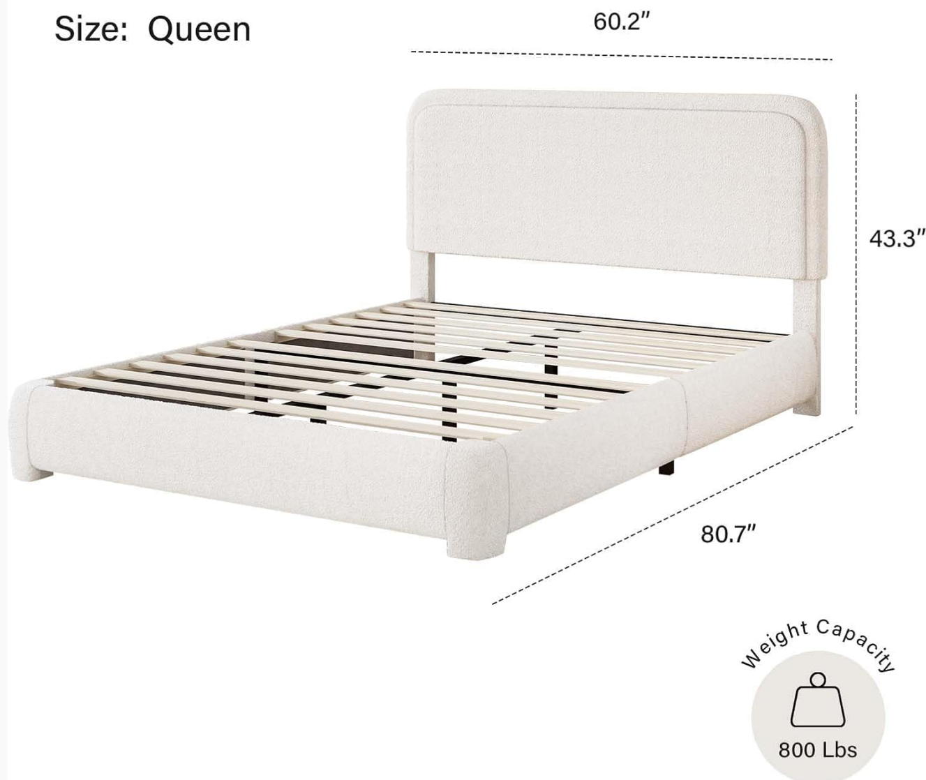
Figure 2.1: Internal metal frame and upholstered side rails of the BarnFurin Queen Size Bed Frame, ready for slat installation.