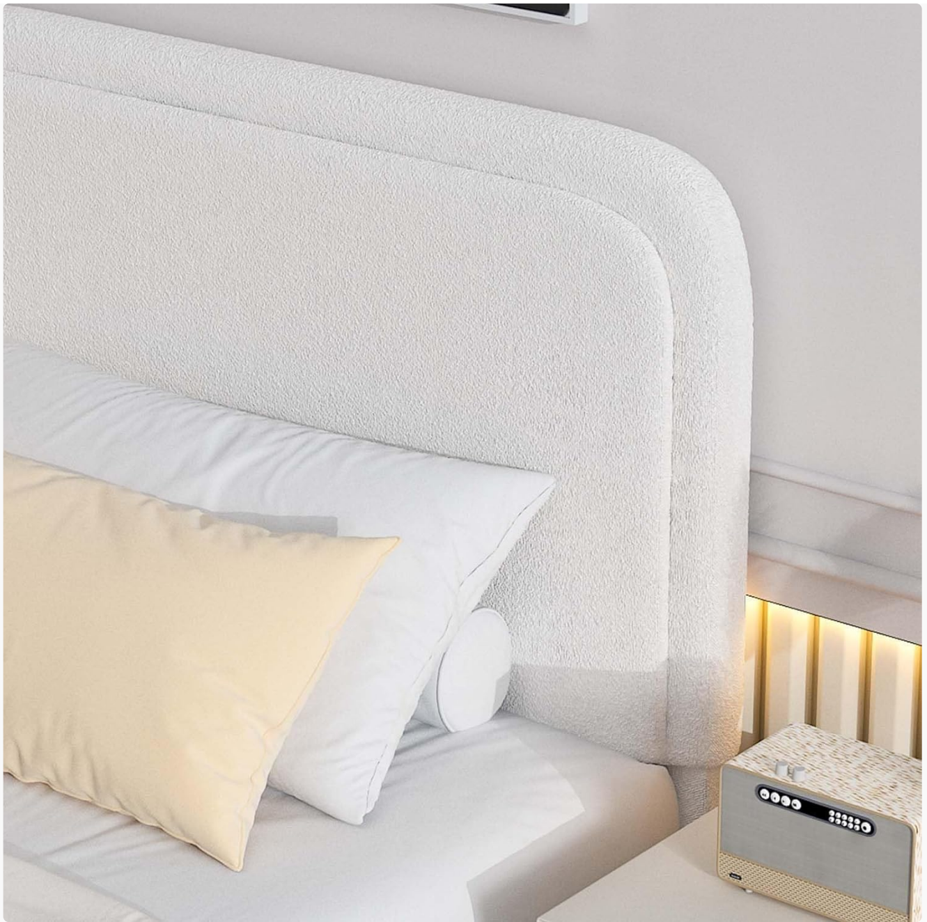
Figure 4.1: The complete BarnFurin Queen Size Bed Frame with a mattress and bedding, highlighting the soft boucle upholstered headboard and rounded corners.