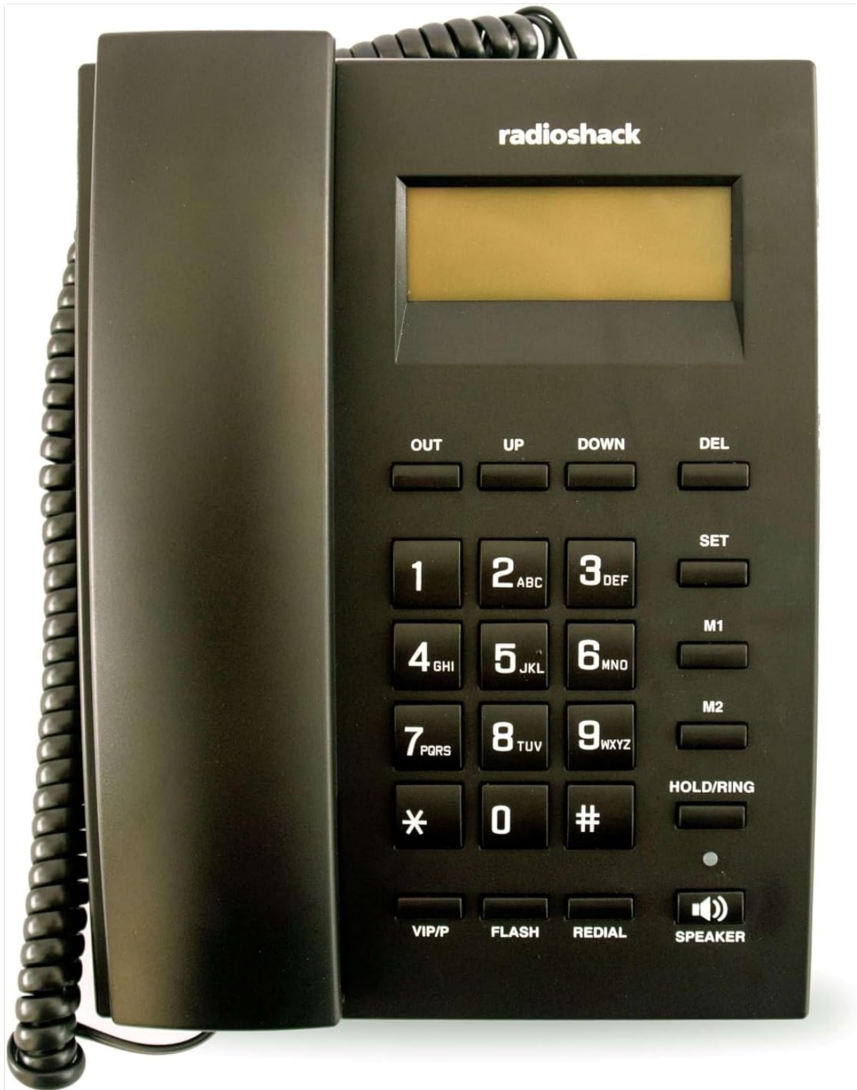
Figure 1: Front view of the RadioShack Corded Black Phone with Display. This image shows the handset resting on the base, the numeric keypad, function buttons, and the digital display screen.