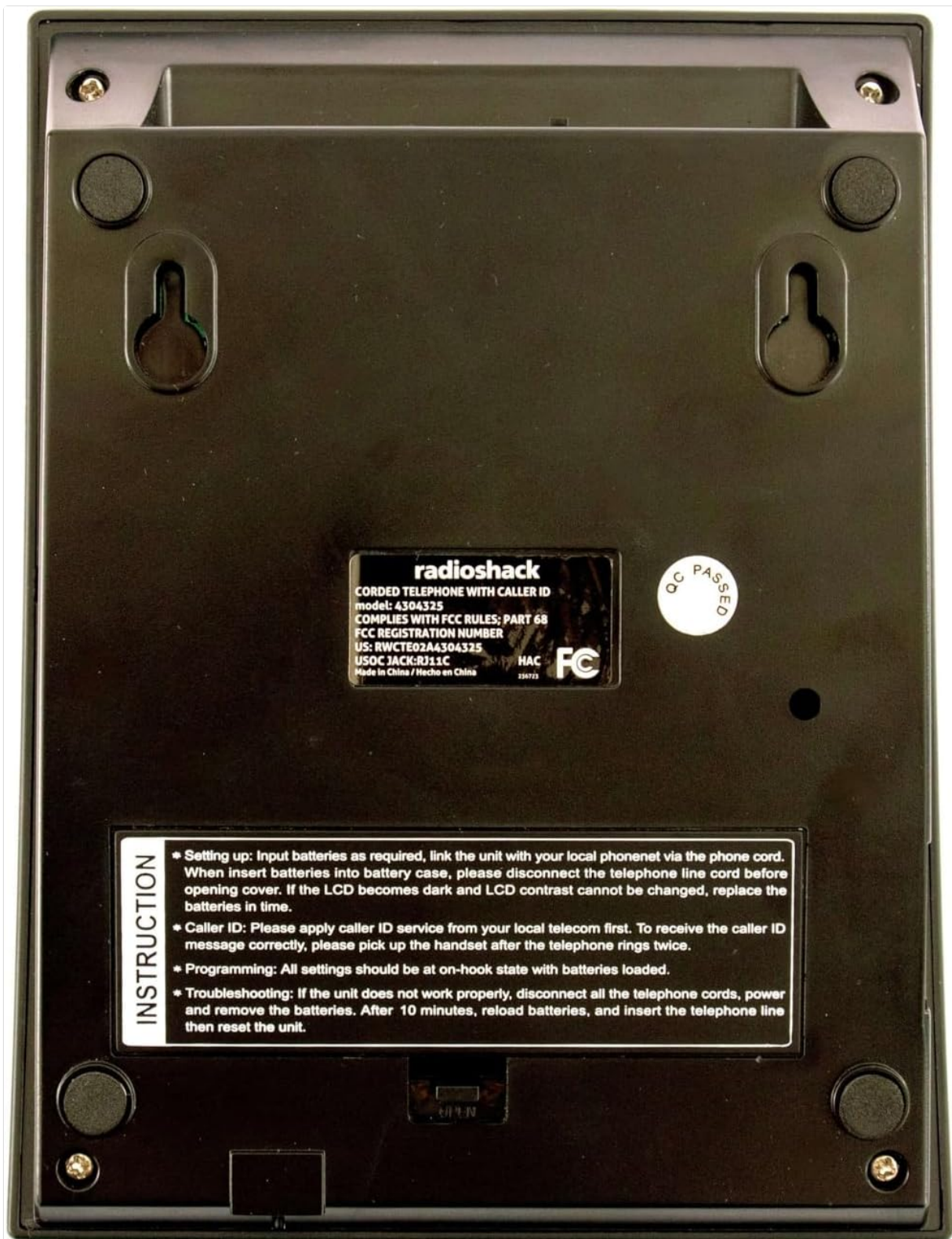
Figure 3: The bottom of the phone, showing the battery compartment and printed setup instructions. This view is crucial for initial battery installation and understanding the physical connections.