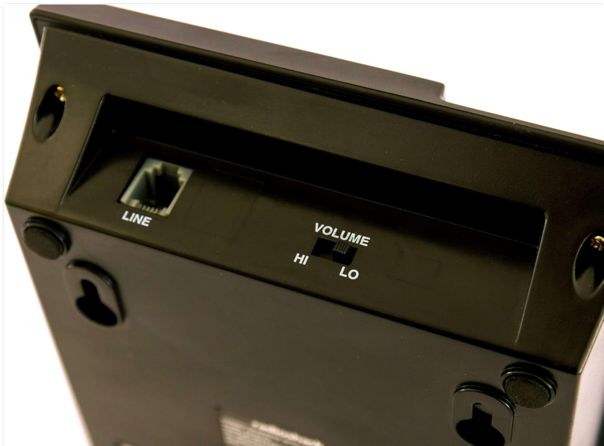
Figure 4: A detailed view of the rear connections, specifically the "LINE" input for the telephone cord and the "VOLUME" switch for adjusting audio levels.