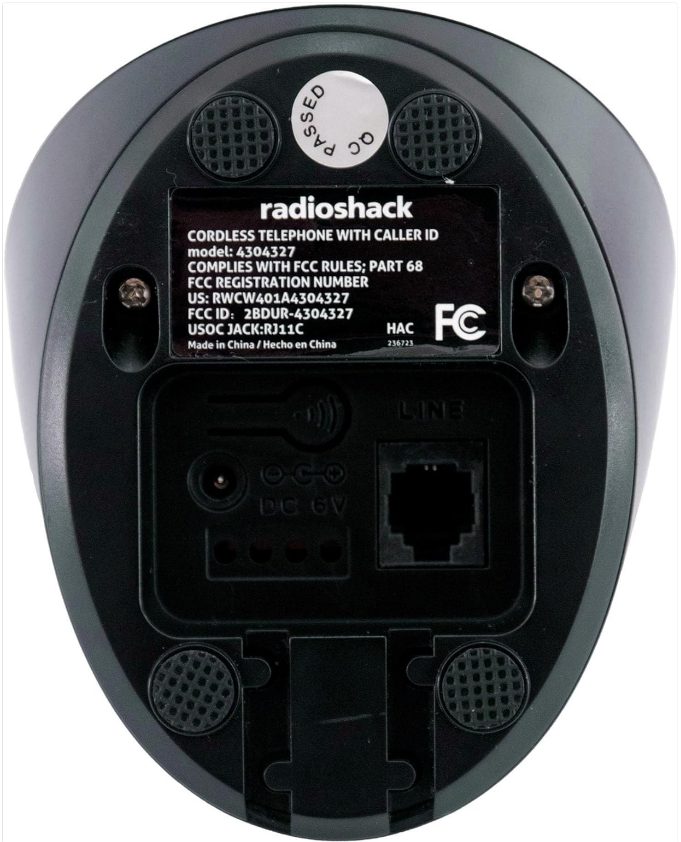
Figure 3.1: Rear view of the base unit with power and line connections.