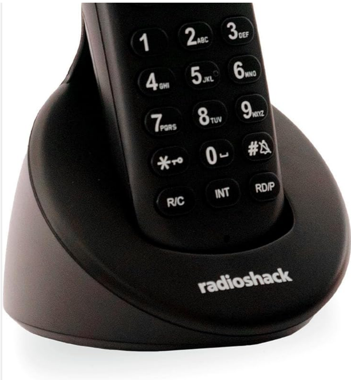
Figure 1.1: RadioShack Cordless Phone Handset in Charging Base.