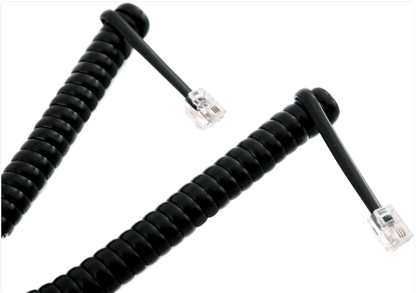
Figure 2.1: Included telephone line cords.