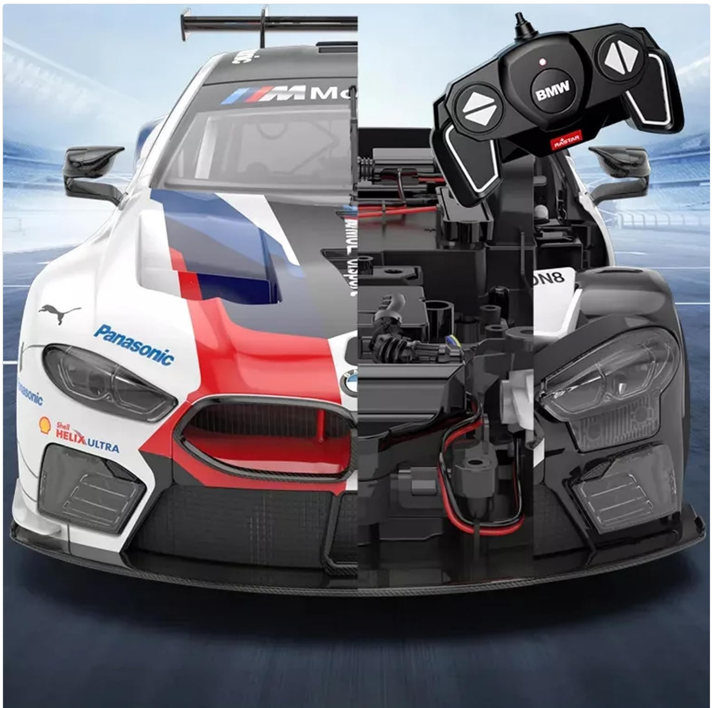
Image: A split image showing the exterior of the Rastar BMW M8 GTE RC car on the left and its internal chassis and electronic components on the right, alongside the remote control unit.