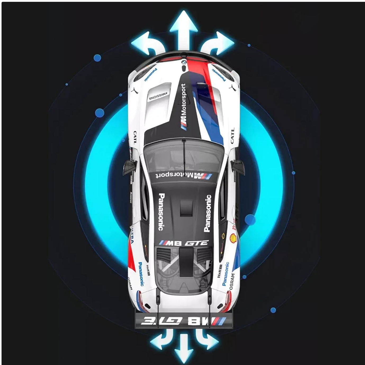
Image: An overhead view of the Rastar BMW M8 GTE RC car, showing blue arrows indicating forward, backward, left, and right movement capabilities.