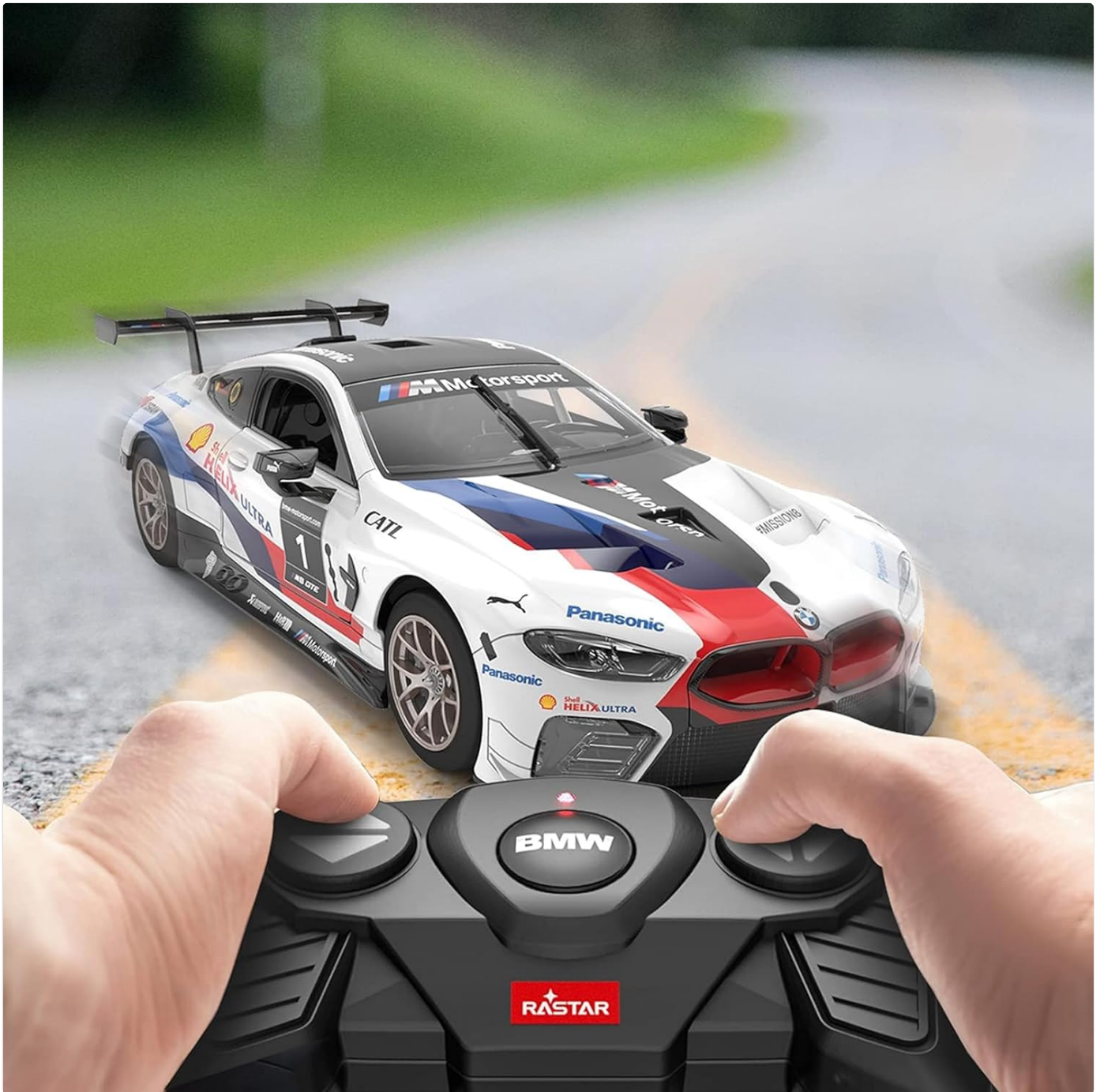
Image: A pair of hands holding the black remote control with BMW and Rastar logos, operating the white, red, and blue BMW M8 GTE RC car on a paved surface.

Once assembled and batteries are installed, you are ready to operate your BMW M8 GTE RC car.