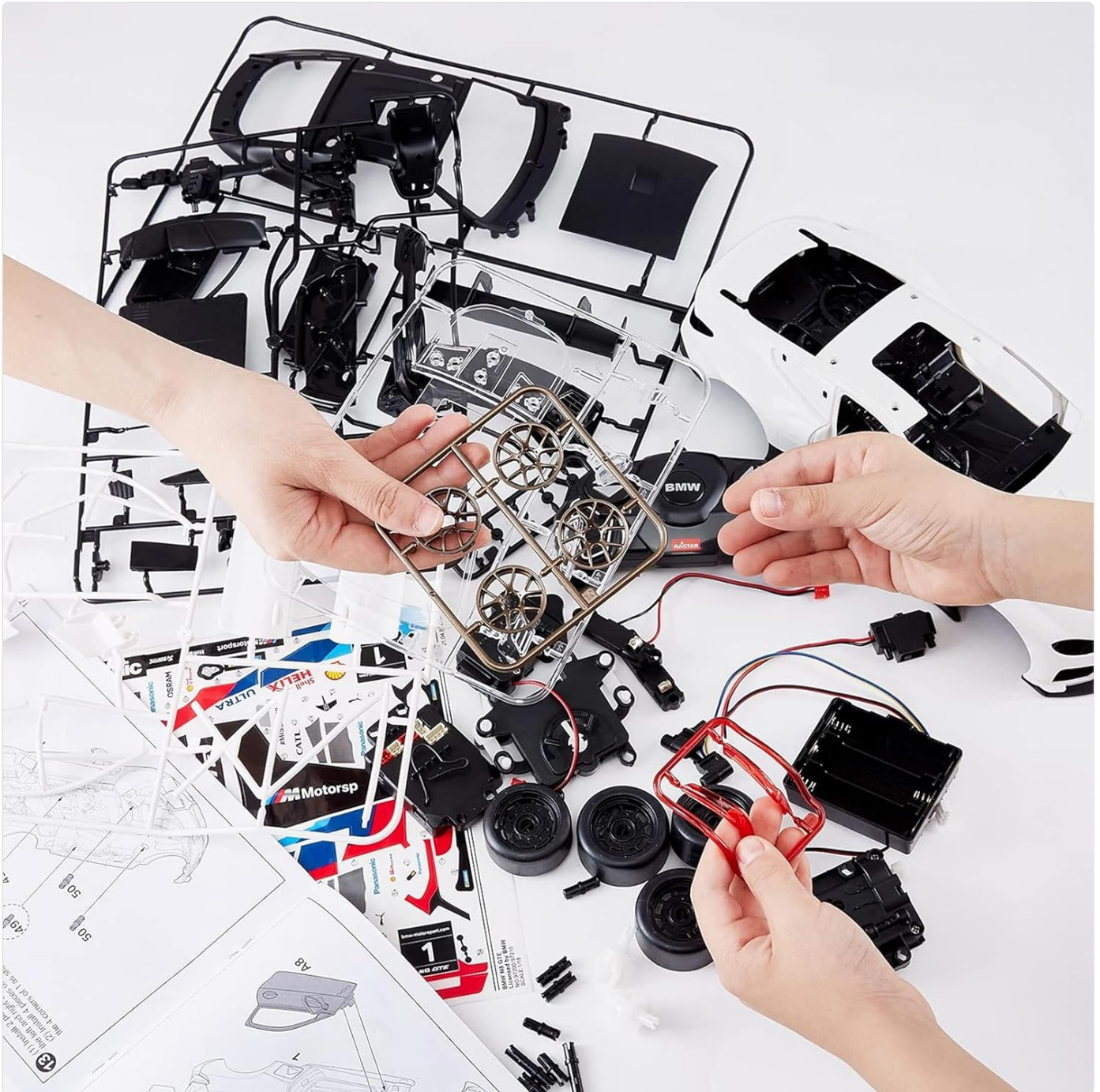
Image: Two pairs of hands carefully assembling small plastic components of the Rastar BMW M8 GTE RC car kit, with various parts and the instruction manual visible on a table.

wheels, and internal electronics, laid out for assembly.