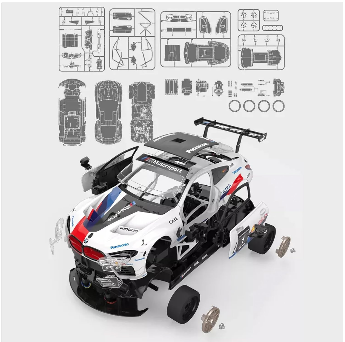
Image: Exploded view diagram showing all 74 components of the Rastar BMW M8 GTE RC car kit, including the chassis, body panels,

The Rastar 97200 is a DIY model kit consisting of 74 pieces. Follow the detailed assembly instructions provided in the box to construct your BMW M8 GTE. The kit includes all necessary components, including the motor and electronic parts.