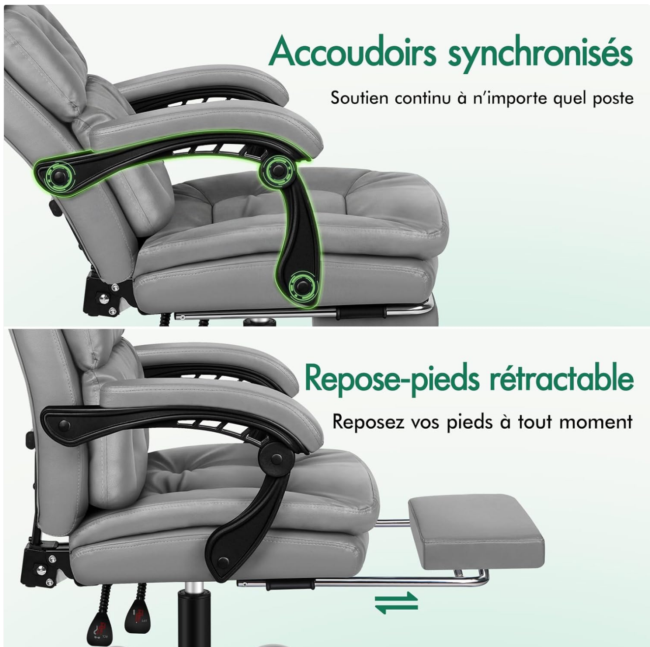
Figure 4.2: Synchronized Armrests and Retractable Footrest