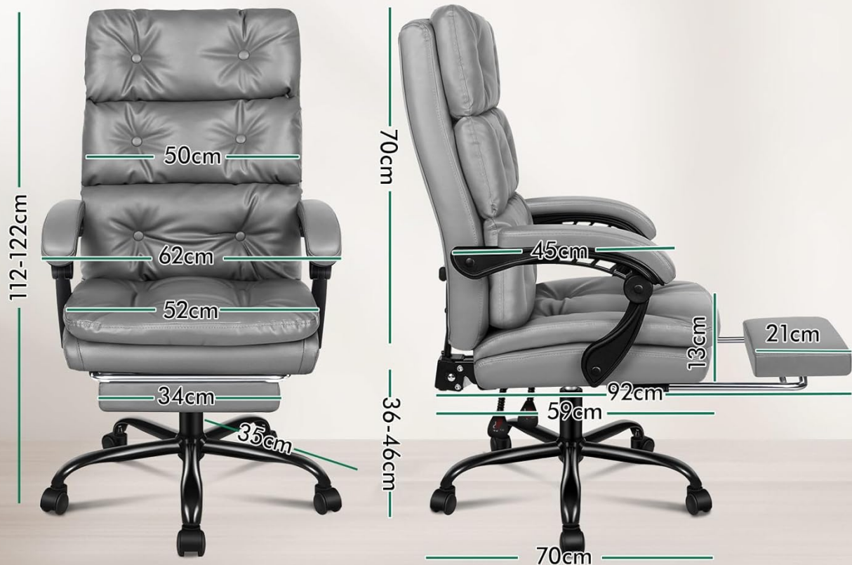
Figure 2.2: Chair Dimensions