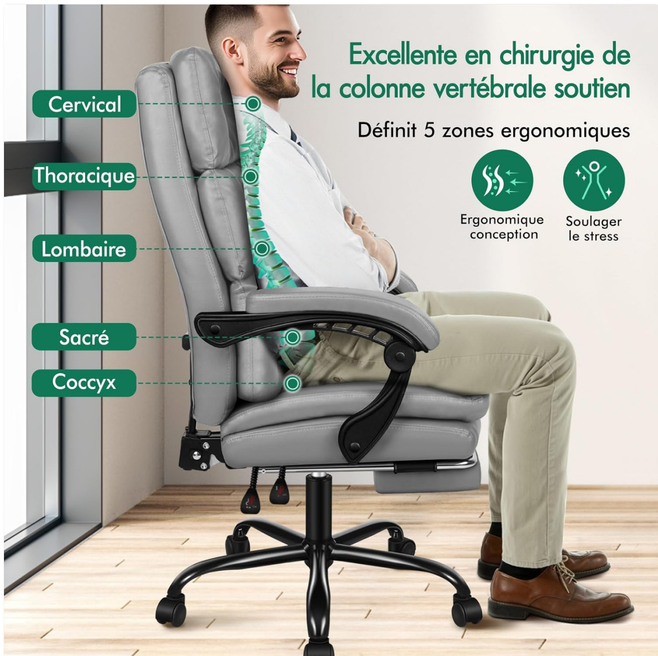
Figure 2.1: Ergonomic Support Zones

This chair is designed to provide comfort and support for various body types, with a wider and higher backrest and a double-layer seat for enhanced cushioning.