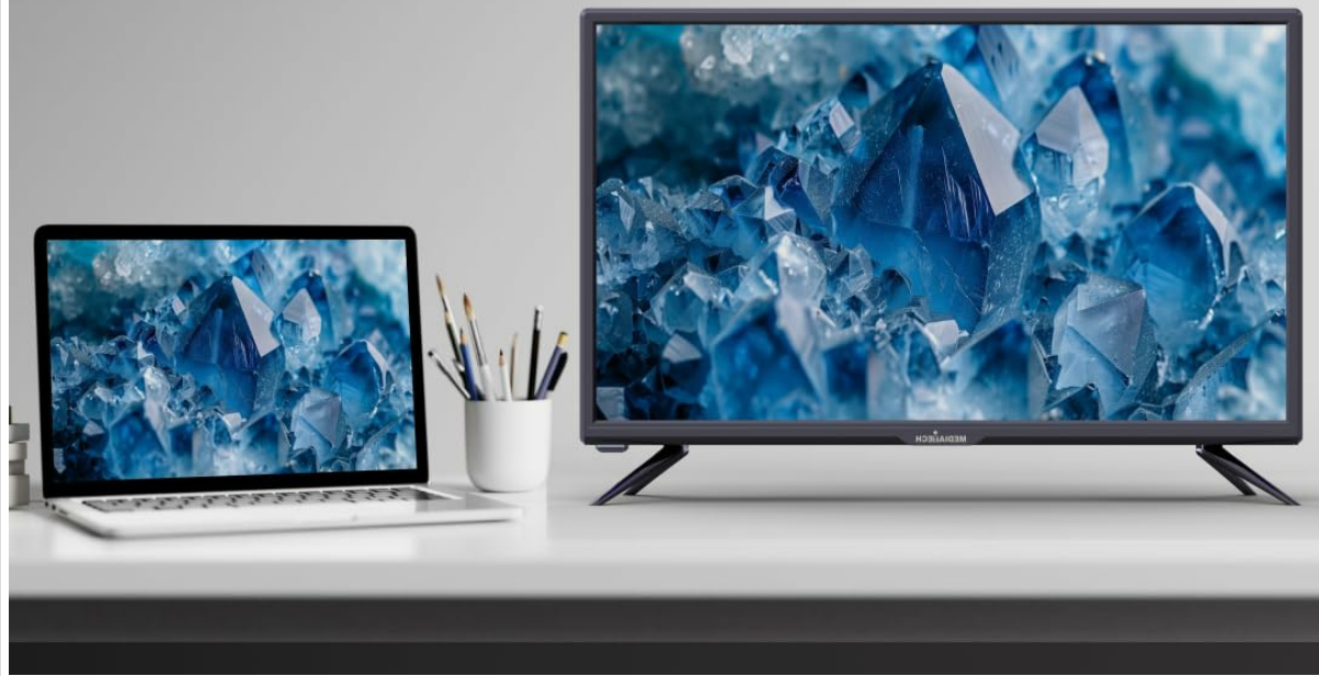
Image 4: The MEDIATECH TV displayed next to a laptop, illustrating its capability as a multi-purpose screen for devices like CCTV cameras, laptops, CPUs, and gaming consoles (PS4/PS5).

Can be utilized with CCTV Cameras, Laptop, CPU and PS4/5