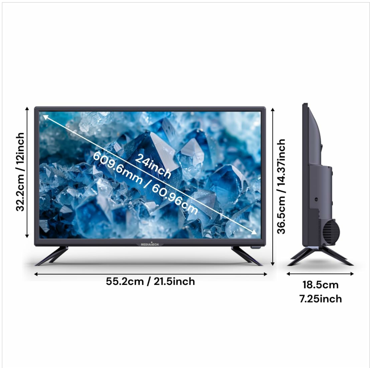
Image 2: Diagram illustrating the physical dimensions of the MEDIATECH 24-inch LED TV, including width, height, and depth measurements.