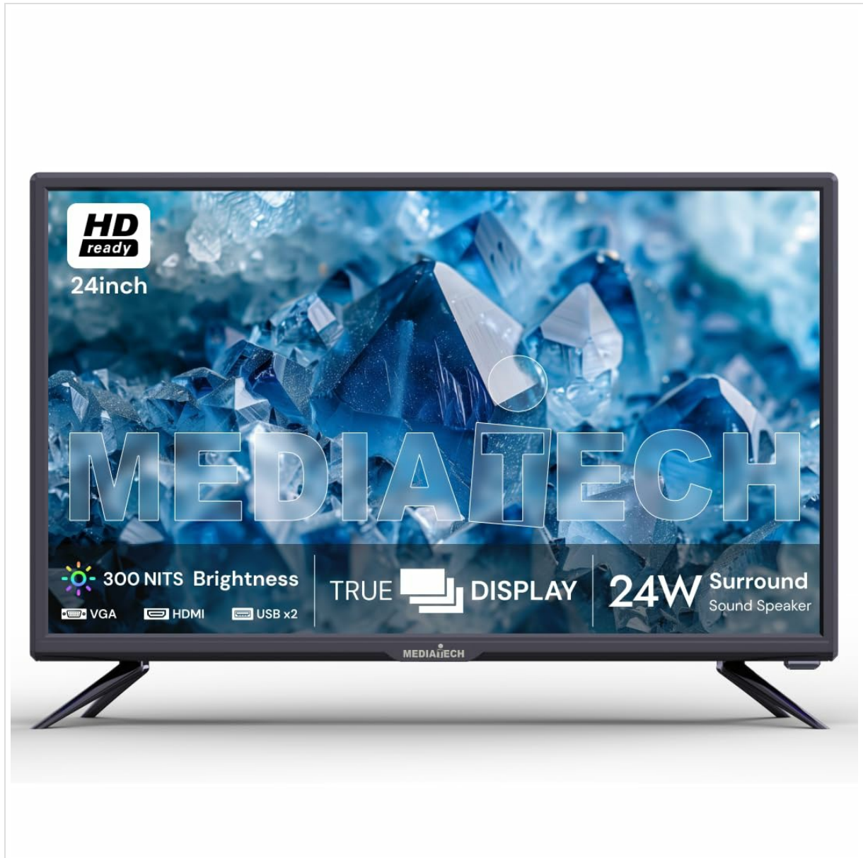
Image 1: Front view of the MEDIATECH 24-inch HD Ready LED TV, showcasing its display and branding.

Your MEDIATECH TV can be placed on a flat surface using the included stand or mounted on a wall. Ensure the TV is placed in a well-ventilated area, away from direct sunlight and heat sources.