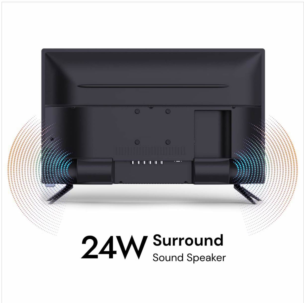
Image 6: Rear view of the MEDIATECH TV, highlighting the integrated 24W Surround Sound Speakers for powerful audio output.