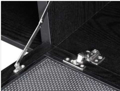
The surface is designed to be waterproof and easy to clean.