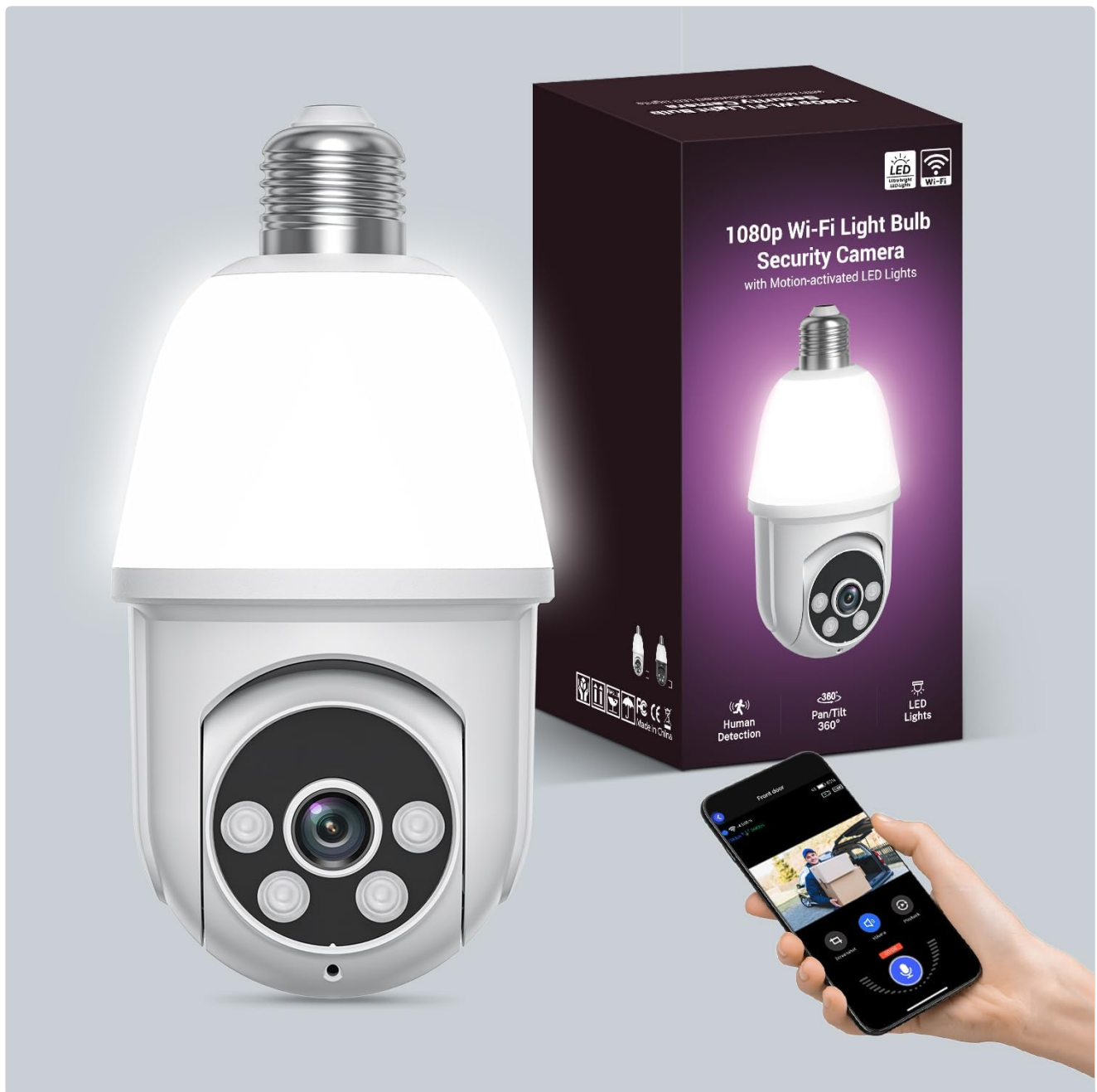
Image 1.1: HubFlashy 1080P Light Bulb Security Camera and Packaging