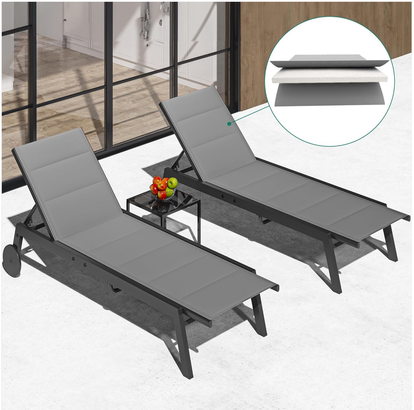
Image 2.1: The YITAHOME Outdoor Chaise Lounge Chairs Set of 3. This image shows two grey chaise lounges and a small black side table, positioned on an outdoor patio.