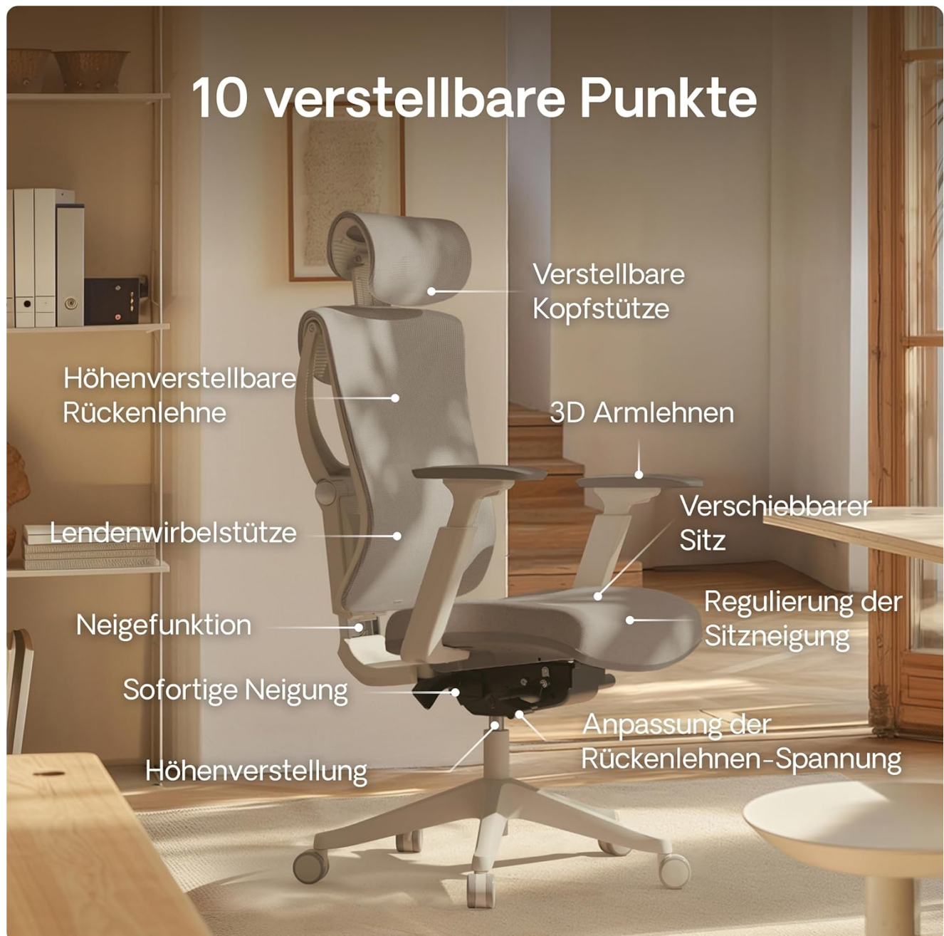
Image: Overview of the 10 adjustable points on the Desktronic SitPro chair, including headrest, backrest height, lumbar support, tilt