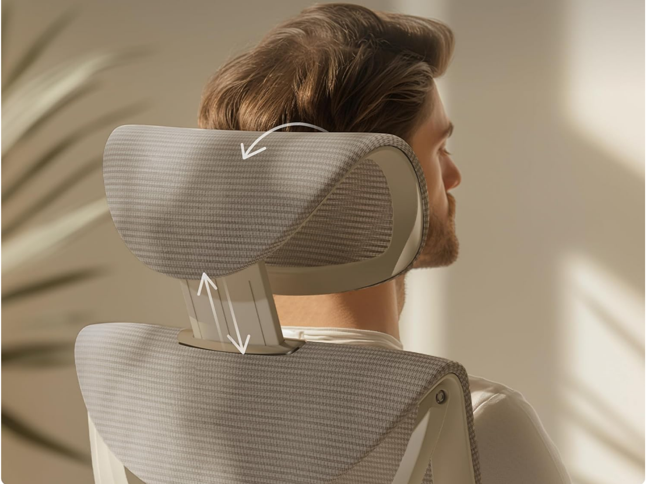
Image: The fully adjustable headrest provides precise neck support, helping to prevent neck strain.

Voll verstellbare Kopfstütze stützt den Nacken präzise