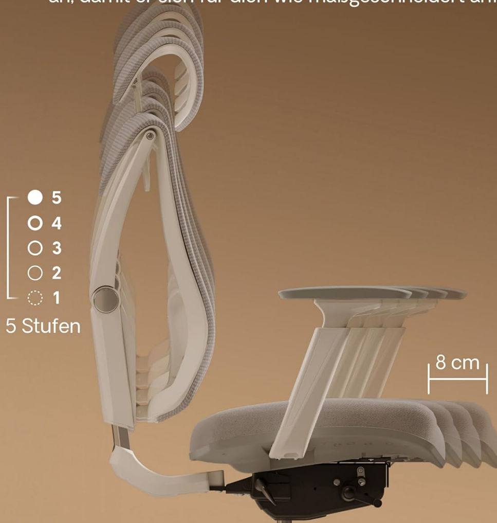
Image: The seat depth can be adjusted by 8 cm in 5 steps, allowing for a tailored fit for various body types.

Passe den Stuhl speziell auf deine Körpergröße und Körperform an, damit er sich für dich wie maßgeschneidert anfühlt