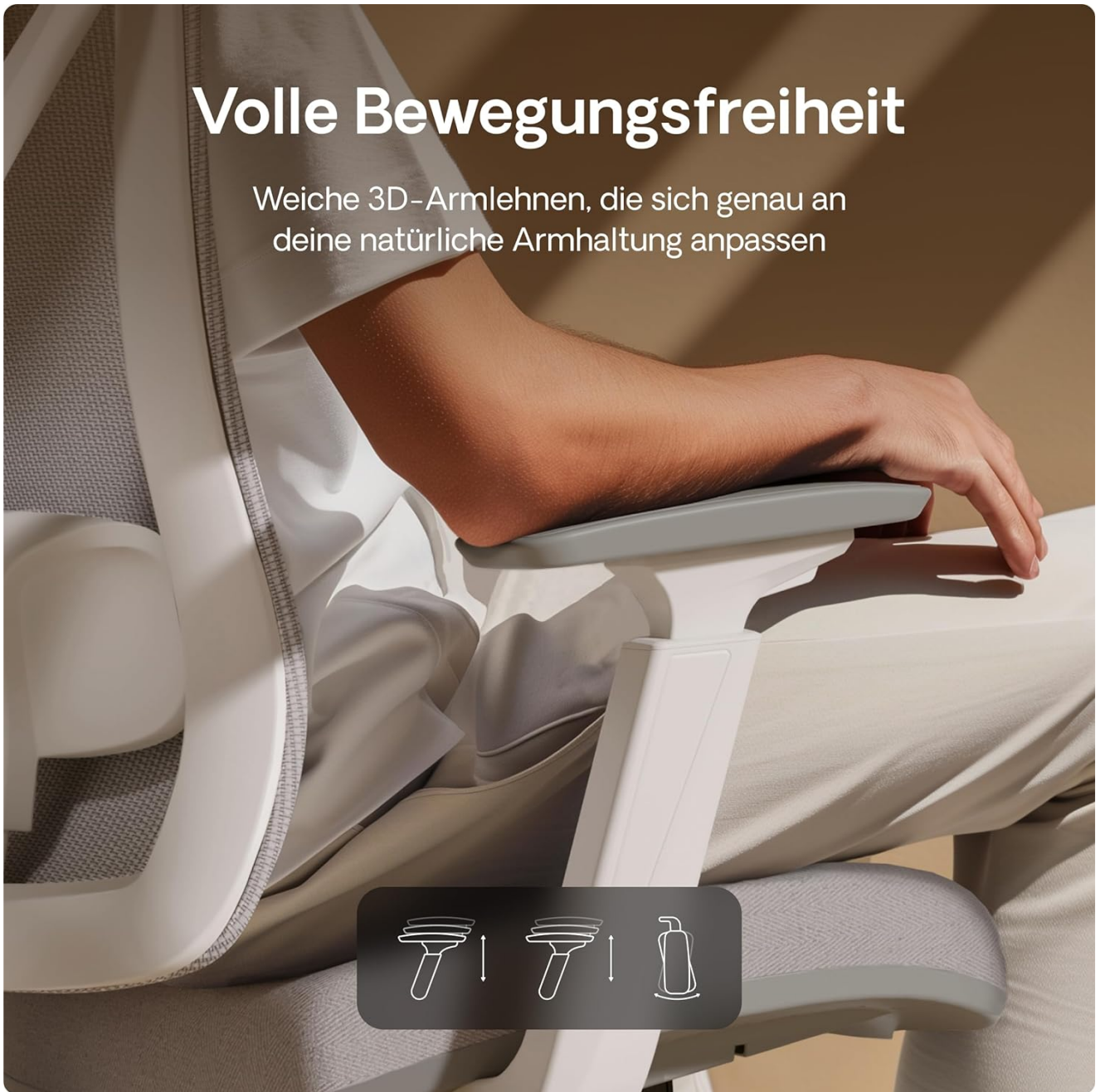
Image: The soft 3D armrests provide full range of motion and adapt to your natural arm posture.

Weiche 3D-Armlehnen, die sich genau an deine natürliche Armhaltung anpassen