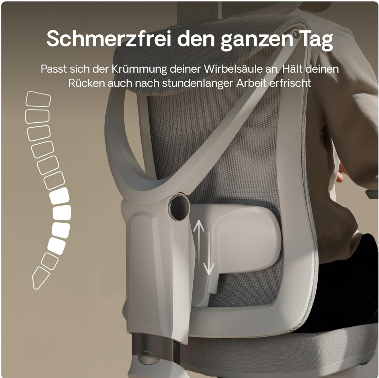
Image: Detail of the adjustable lumbar support, designed to conform to the spine's curvature for all-day comfort.