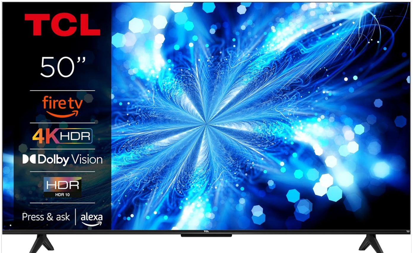
Image: Front view of the TCL 50PF650 4K HDR Fire TV, showcasing its slim bezels and integrated Fire TV and Alexa branding.

Equipped with Fire TV, the television provides direct access to a wide array of streaming services and applications. Its built-in Alexa voice control allows for convenient navigation and command execution using the included remote control.