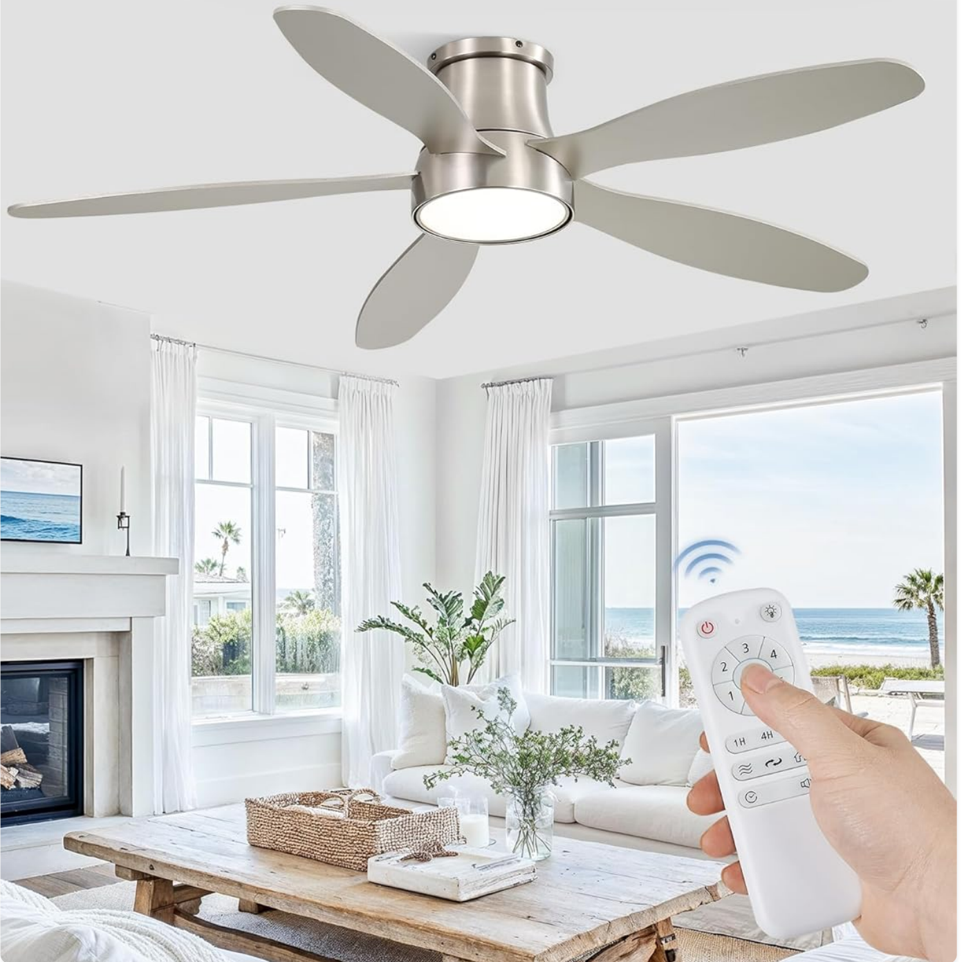
Image: An overview of the ZMISHIBO Multifunctional Ceiling Fan highlighting its key features: 6 wind speeds, 1H/4H/8H timing, 3 color temperatures, and a reversible DC motor.