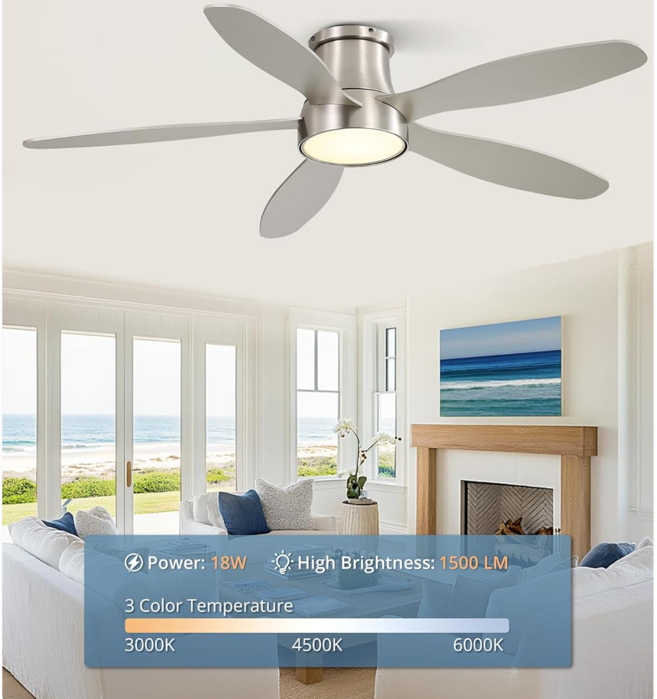
Image: The ZMISHIBO ceiling fan showcasing its three lighting options: 3000K, 4500K, and 6000K, with a power of 18W and high brightness of 1500 LM.