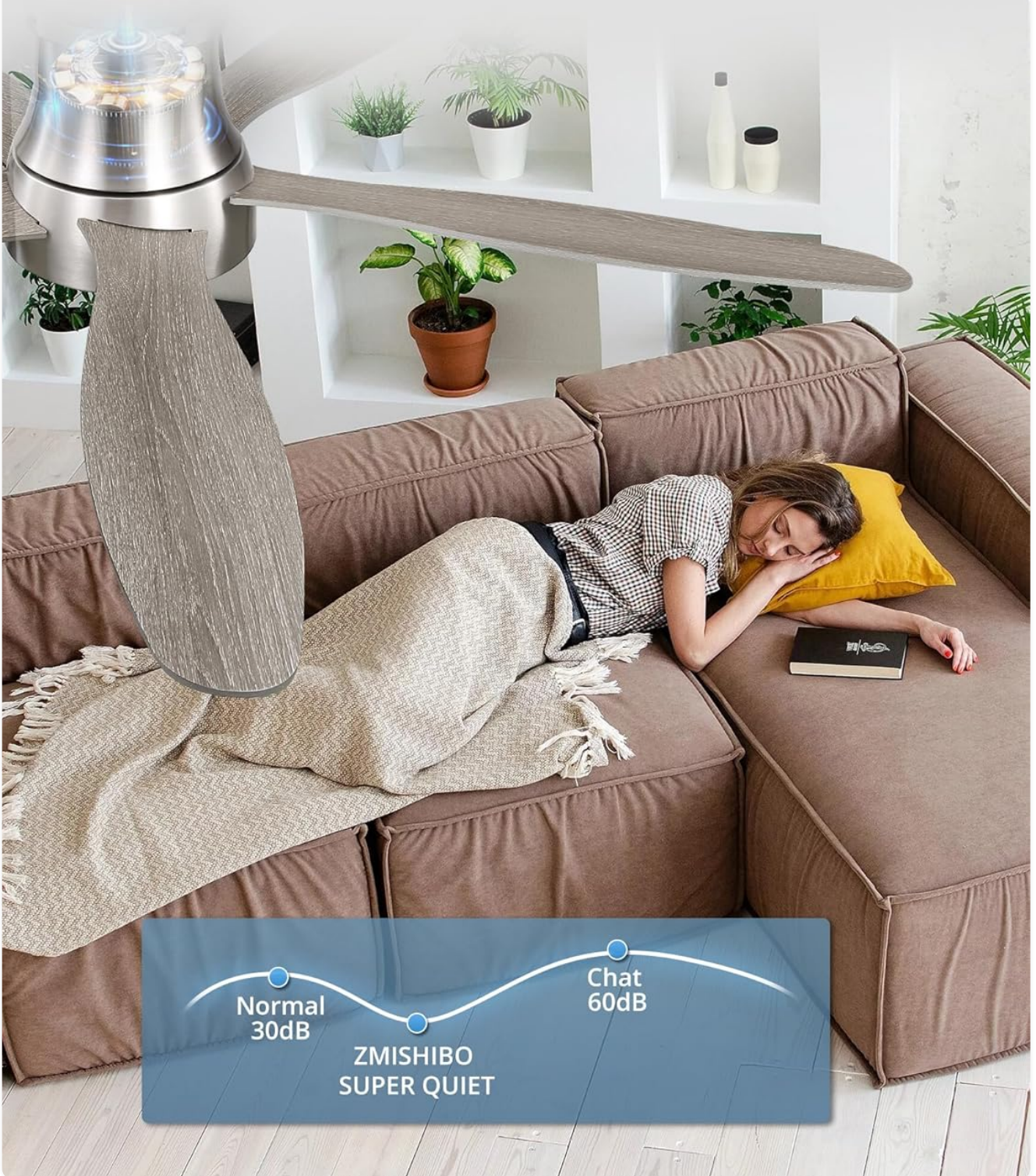
Image: The ZMISHIBO ceiling fan emphasizing its quiet operation, with a graphic indicating noise levels: Normal at 30dB and Chat at 60dB, highlighting the fan's "Super Quiet" performance.