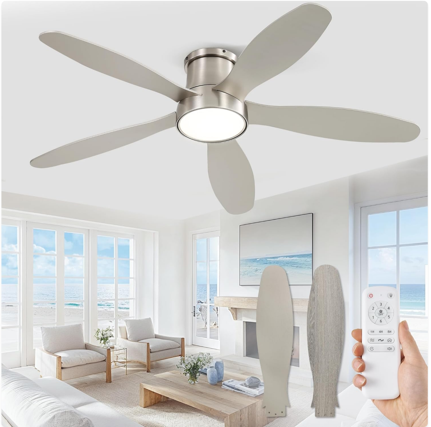
Image: The ZMISHIBO 52 Inch Flush Mount Ceiling Fan with light, featuring a sleek nickel finish and five blades, seamlessly integrated into a contemporary living room setting with large windows overlooking a beach.