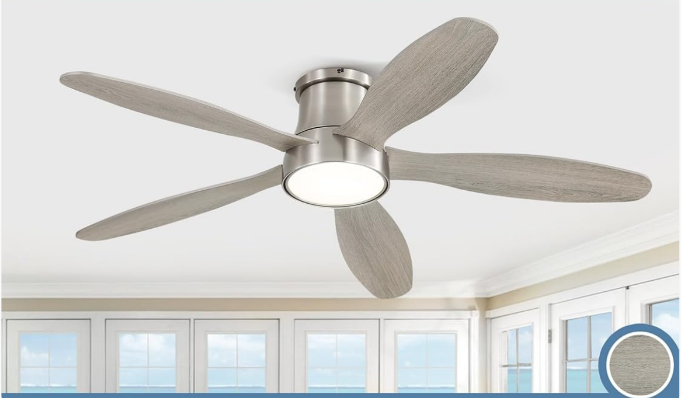
Image: The fan features two-color blades, allowing for customization to match various interior decoration styles. One side is a solid nickel color, and the other is a light wood grain.