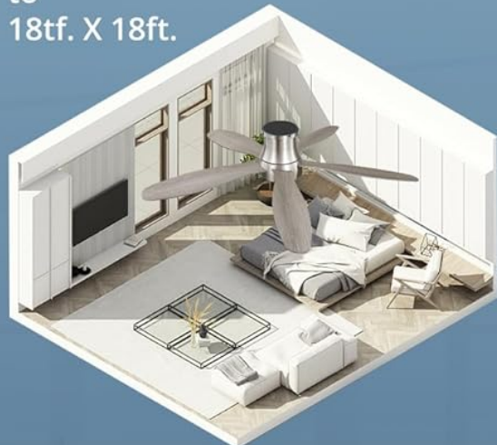
Image: A diagram illustrating the flush mount design of the ZMISHIBO 52 Inch Ceiling Fan, showing its 52-inch diameter and 9-inch height. It also indicates recommended room sizes for optimal performance, ranging from 12ft x 12ft to 18ft x 18ft.

Fit To: Recommended for Indoor 12tf. X 12ft. to 18tf. X 18ft.