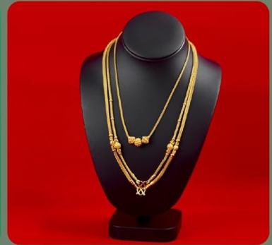
Image: Displays the six included PVC backdrops (black, white, red, blue, green, orange) and examples of products photographed with different colored backgrounds.