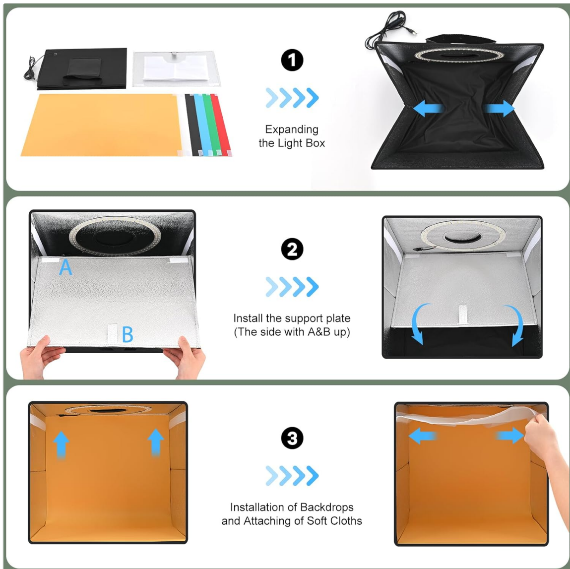
Image: A hand expanding the folded light box into its cube shape, showing the internal reflective material.