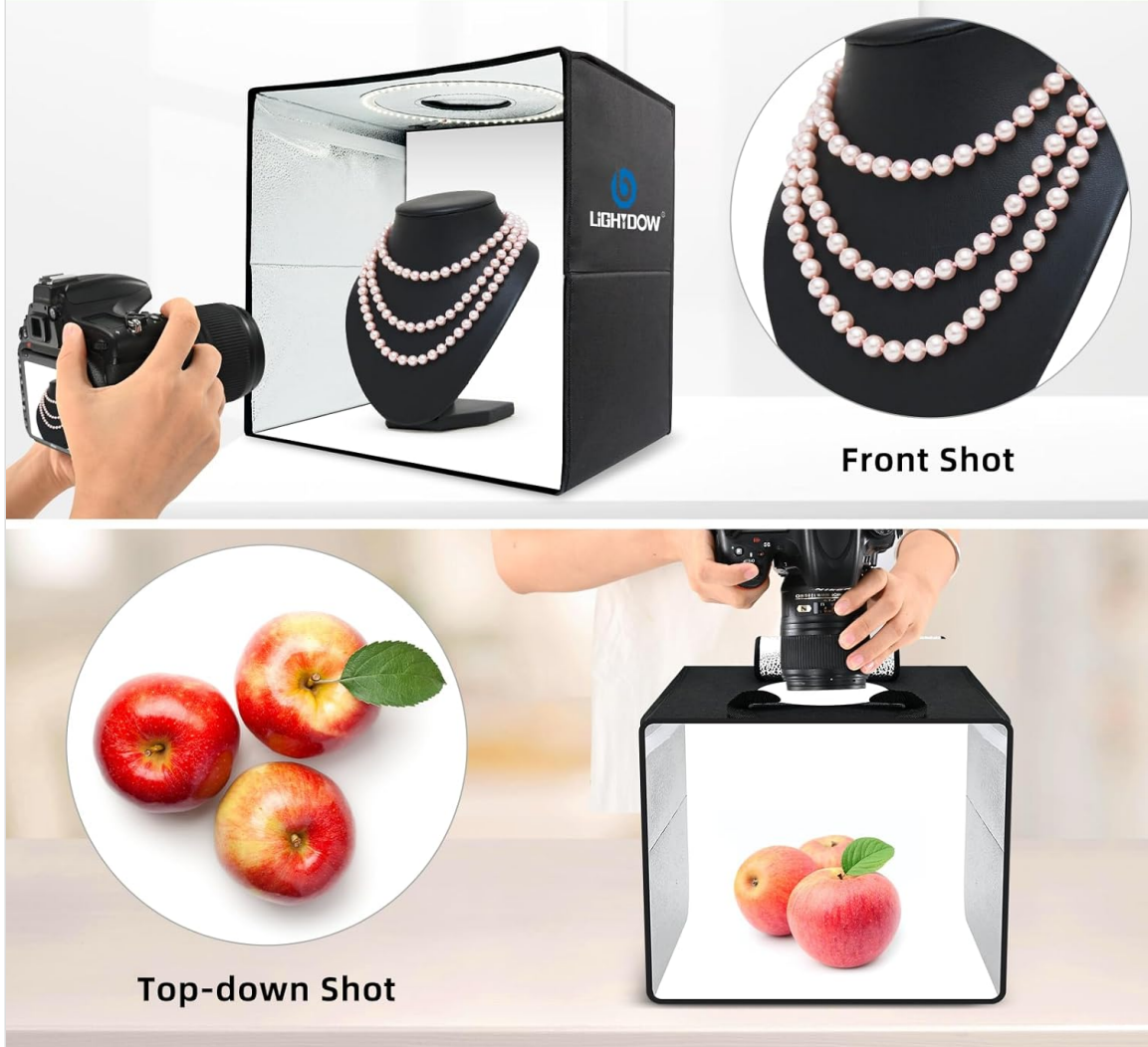
Image: Demonstrates how to use both the front opening for standard shots and the top opening for overhead shots of products within the light box.