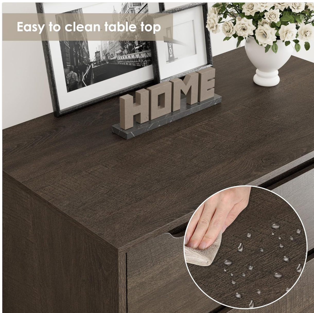
Figure 6.1: The dresser's tabletop is designed for easy cleaning, as shown by wiping away liquid.