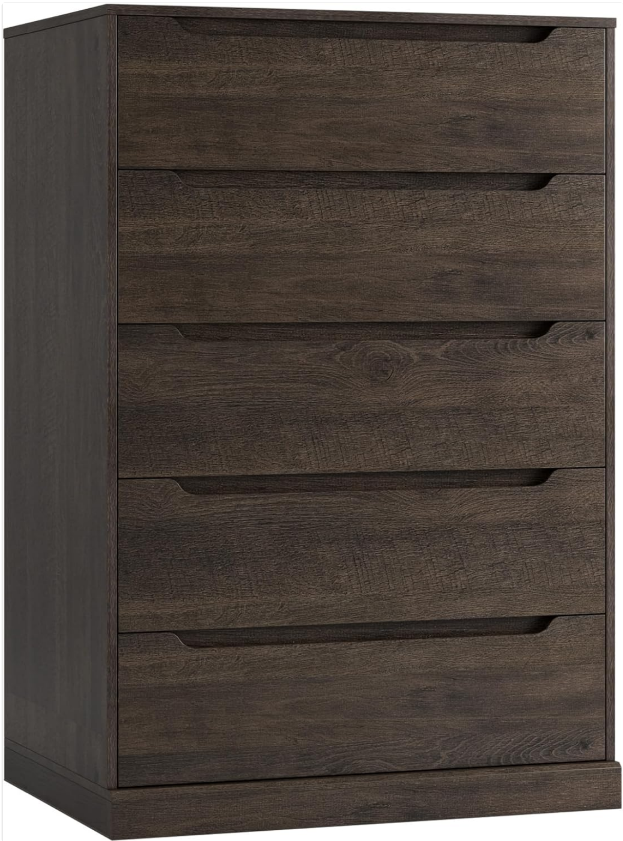
Figure 4.1: The fully assembled HOSTACK 5-drawer dresser.