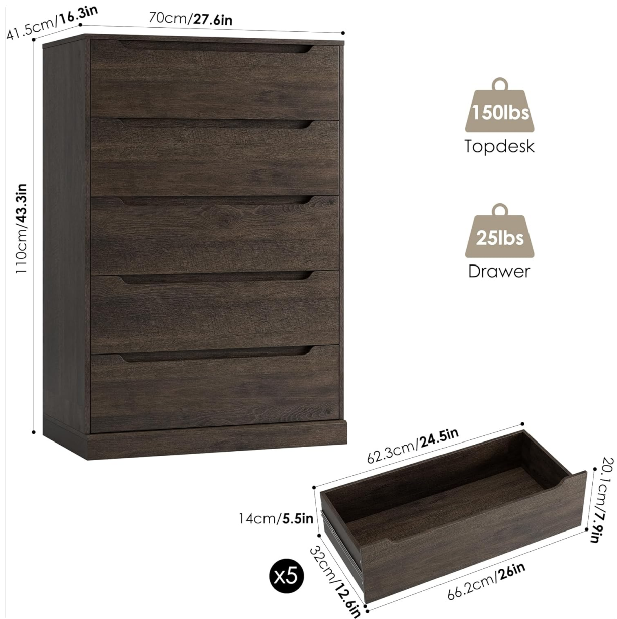
Figure 8.1: Detailed dimensions and weight capacities for the dresser and its drawers.