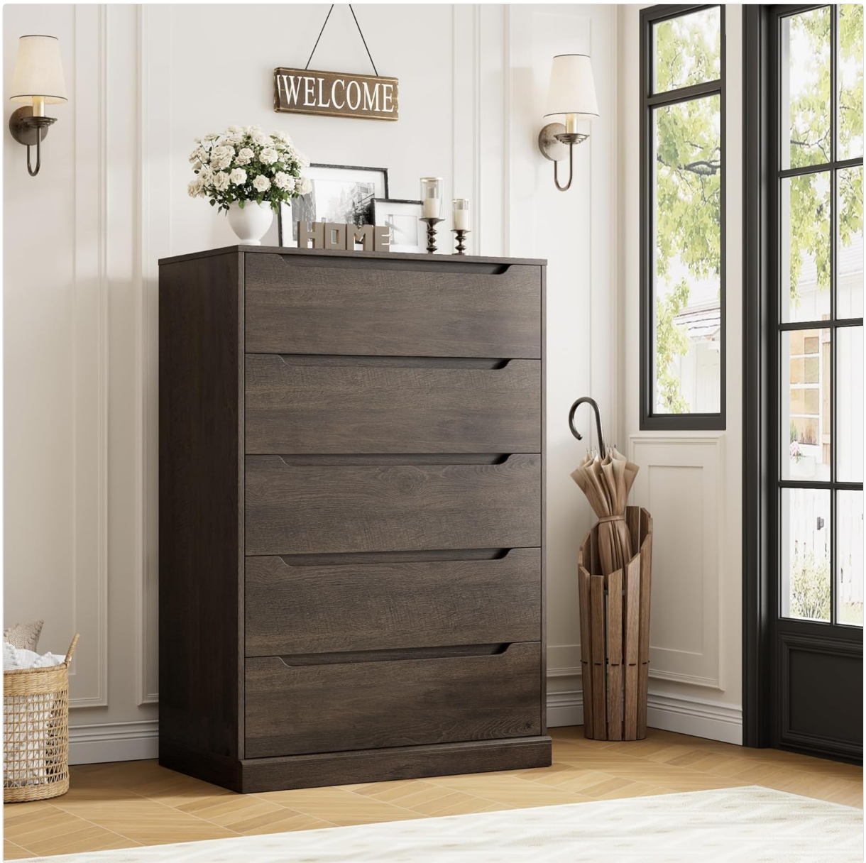
Figure 8.2: The HOSTACK 5-drawer dresser integrated into a living space.