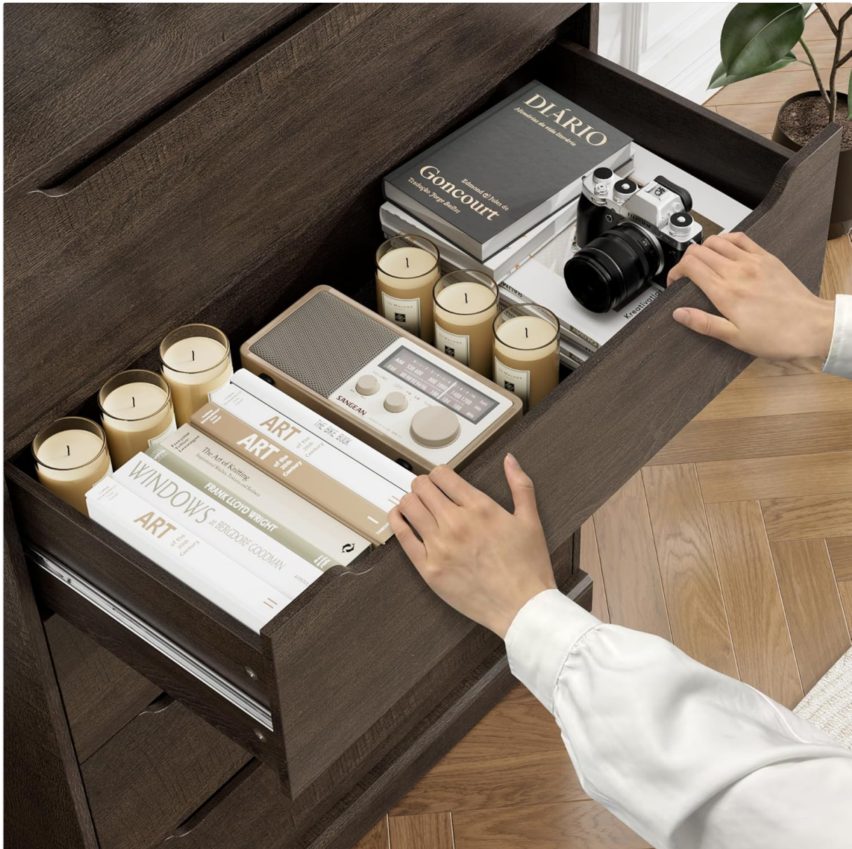
Figure 5.1: An open drawer demonstrating the internal storage capacity.