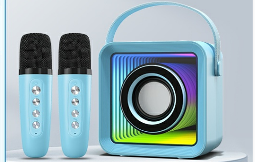
Image: Overview of the speaker's control buttons and input ports for easy operation.

Power Button (On/Off): Long press to turn the speaker on or off.