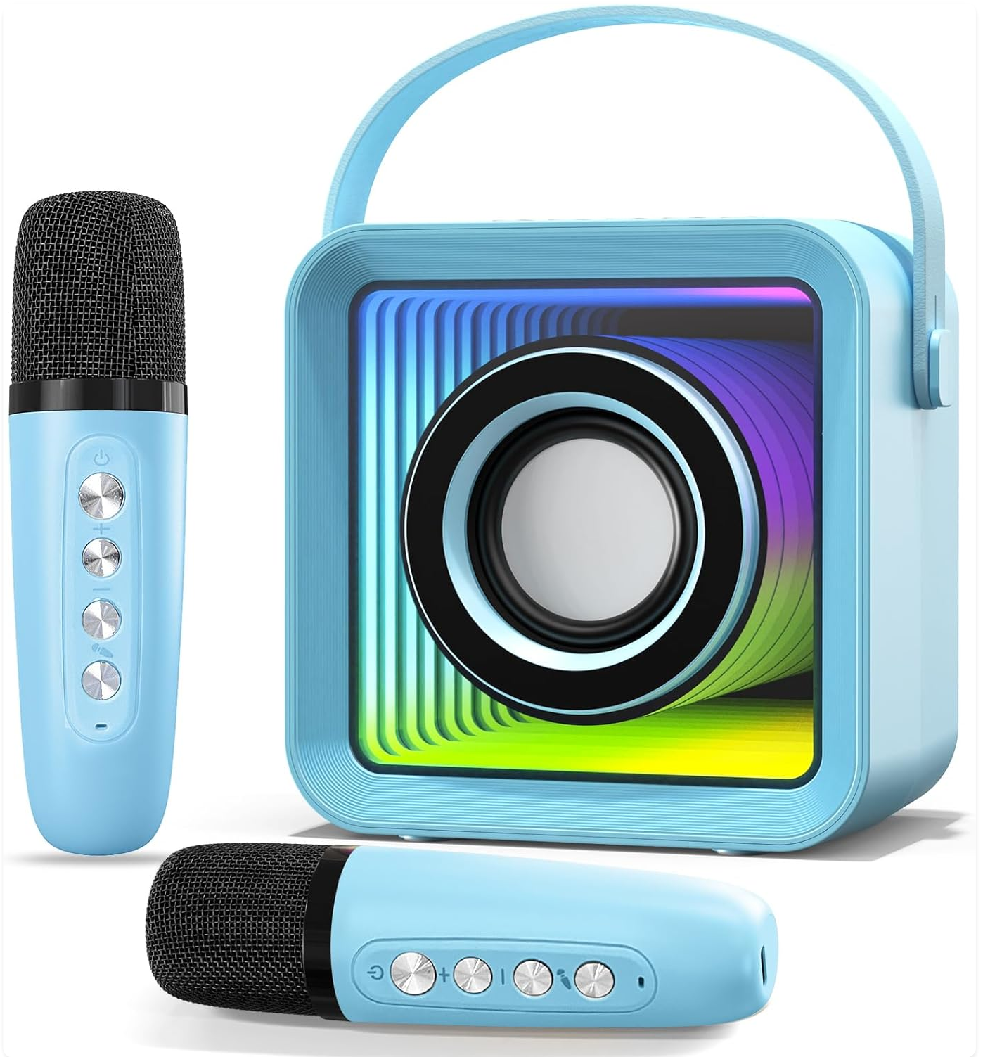
Image: The main components of the HUABAO Mini Karaoke Machine, including the speaker and two wireless microphones.