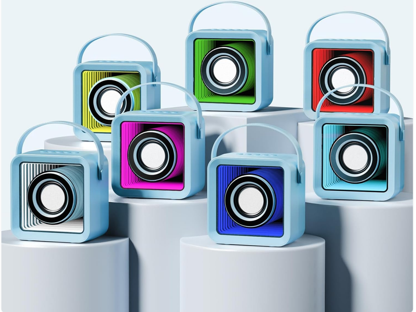
Image: The Abyss Mirror Design of the speaker, showing its appearance with lights on and off.

Beautiful lights bounce to the beat of the music, making the party more vibe