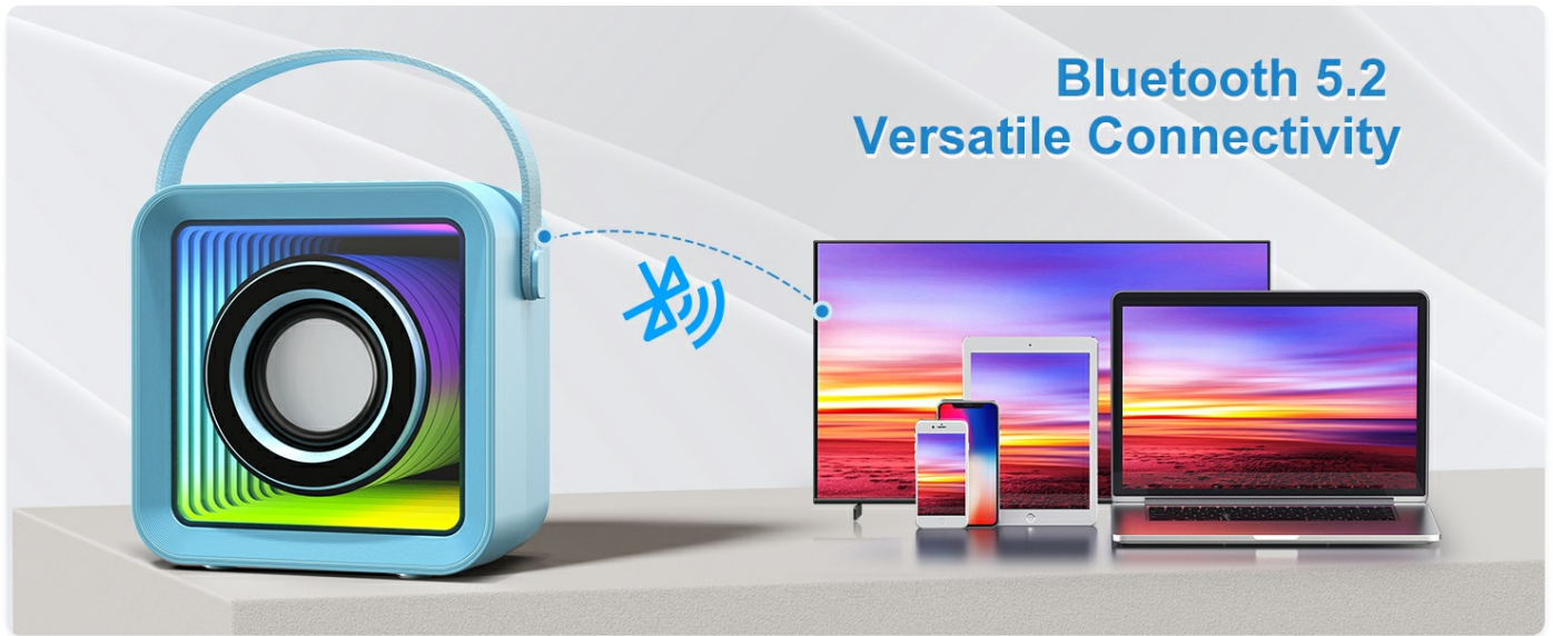
Image: The speaker offers versatile connectivity options, including Bluetooth 5.2 for seamless pairing with various devices.