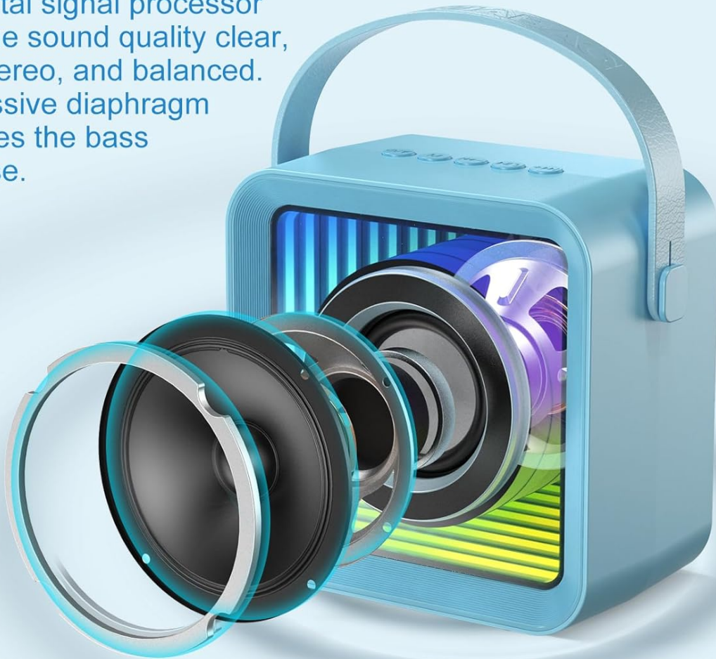
Image: The speaker's colorful lights can bounce to the beat of the music, enhancing the party atmosphere.

The advanced audio driver and digital signal processor make the sound quality clear, more stereo, and balanced. The passive diaphragm enhances the bass response.